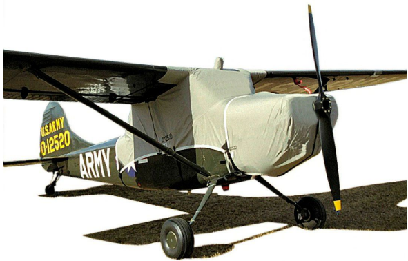
Cessna L-19 Canopy & Engine Covers (similar to Siai Marchetti 1019)

This cover type is made from Silver Acrylic Sunbrella canvas and is 100% lined with a soft and smooth microfiber. Bruce's Custom Covers developed this material combination especially for aircraft protection. The outer material is medium weight and treated for water resistance, UV resistance and anti-static buildup. The inner lining is a very soft and smooth microfiber to prevent scratching. The material is very reflective, and tests show that the cabin interior temperature can be reduced to near-ambient temperature on the hottest of days. It is water, ice and snow repellent, yet breathable to allow moisture to escape from between the cover and the aircraft surface.