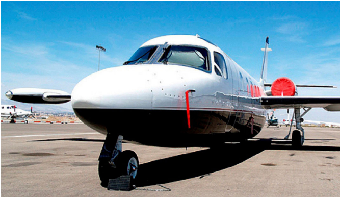
Westwind Engine Cover Set, Pitot Cover

The Engine Inlet Plugs are custom fit for your Israel Aircraft Industries Jet Commander 1121 intakes, made with heavy-duty vinyl material, and stuffed with a single block of sculpted urethane foam. Each plug has a zipper that allows the foam to be removed and dried if necessary. Engine plugs have 'remove before flight' streamers sewn onto the face of the plugs. Most plugs are imprinted with the aircraft registration number in black for an extra charge. Storage bag NOT included. Engine plugs may be inserted after flight when the engine is still warm. Engine Inlet Plugs are commonly referred to as Cowl Plugs, Intake Plugs, Cowl Blocks, Engine Blocks, and Engine Bungs.