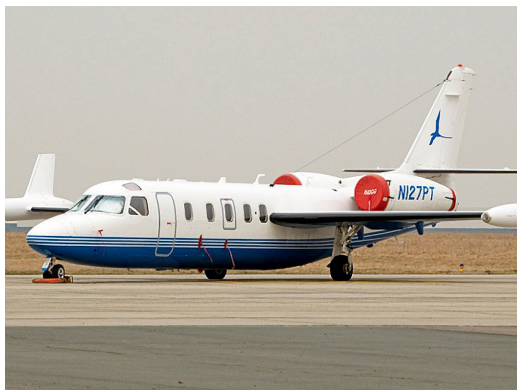
Engine Covers & Cockpit HeatShields

The Israel Aircraft Industries Jet Commander 1121 Bikini Style Engine Covers are a single-piece design using a soft and smooth stretchy and fabric. The cover stretches tightly over both the intake and exhaust, installing quickly and easily. These covers are designed to be used as hangar dust covers and have a useful life of approximately one year.