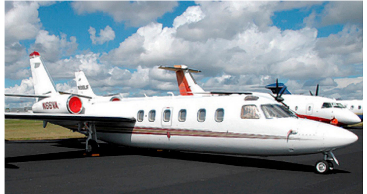
Westwind Engine Intake Plugs