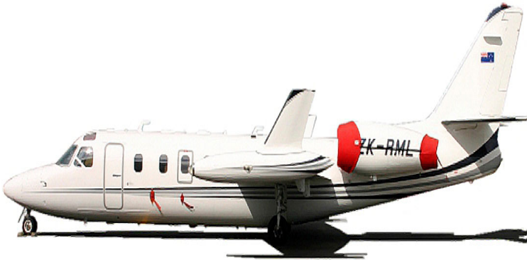
Jet Commander Engine Covers

The Israel Aircraft Industries Jet Commander 1121 Bikini Style Engine Covers are a single-piece design using a soft and smooth stretchy and fabric. The cover stretches tightly over both the intake and exhaust, installing quickly and easily. These covers are designed to be used as hangar dust covers and have a useful life of approximately one year.