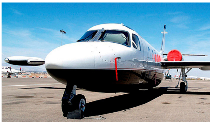
Westwind Engine Cover Set, Pitot Cover