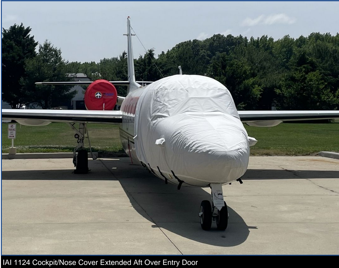
IAI 1124 Cockpit/Nose Cover Extended Aft Over Entry Door