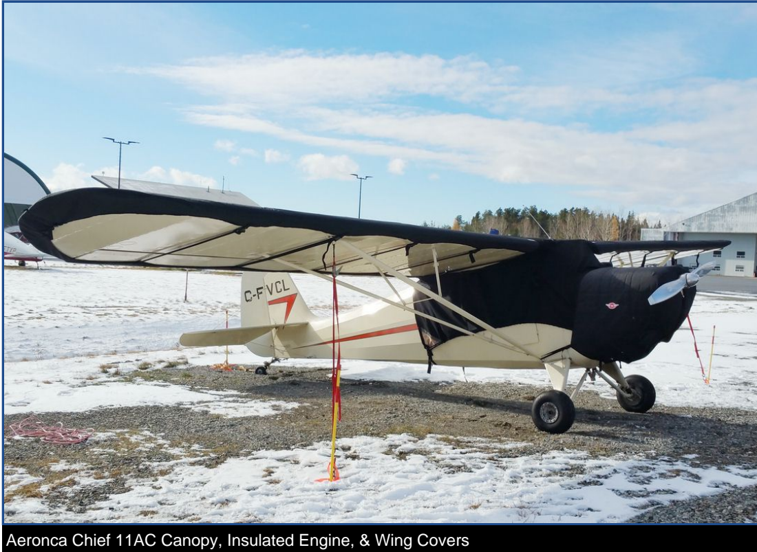
Aeronca Chief 11AC Canopy, Insulated Engine, &amp; Wing Covers