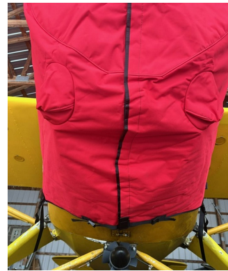
Aeronca 11AC Chief Insulated Engine Cover