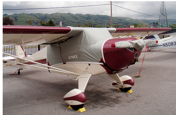
Taylorcraft Over-Top Canopy Cover