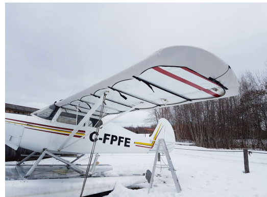
Christavia Mk 1 Wing Covers