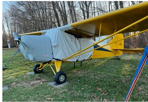
Aeronca Super Chief 11CC Extended Over-Top Canopy Cover, Insulated Engine Cover