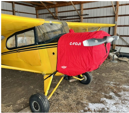
Aeronca 11AC Chief Insulated Engine Cover

This cover type is made from Silver Acrylic Sunbrella canvas and is 100% lined with a soft and smooth microfiber. Bruce's Custom Covers developed this material combination especially for aircraft protection. The outer material is medium weight and treated for water resistance, UV resistance and anti-static buildup. The inner lining is a very soft and smooth microfiber to prevent scratching. The material is very reflective, and tests show that the cabin interior temperature can be reduced to near-ambient temperature on the hottest of days. It is water, ice and snow repellent, yet breathable to allow moisture to escape from between the cover and the aircraft surface.