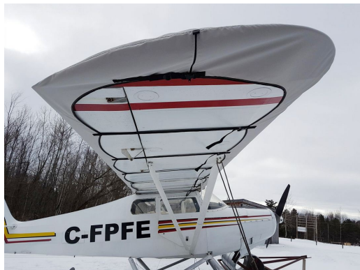
Christavia Mk 1 Wing Covers

WINTER USE MATERIAL - Made with Solution-Dyed Polyester fabric, this option is intended for seasonal use to aid in deicing, rain mitigation, or for occasional travel. The material is lighter and more compact, but more susceptible to UV damage and may have a shorter useful life if used continuously outside than the all-year use material.