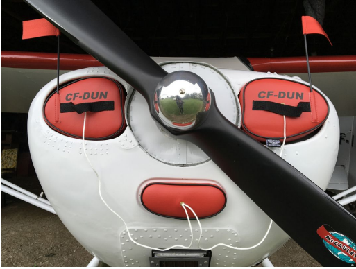
Aeronca 11AC Engine Inlet Plugs

Engine Inlet Plugs are custom fit for your Aeronca Chief 11AC, Super Chief 11CC intakes, made with heavy-duty vinyl material, and stuffed with a single block of sculpted urethane foam. Each plug has a zipper that allows the foam to be removed and dried if necessary. Engine plugs have warning flags that are visible from the cockpit or 'remove before flight' streamers sewn onto the face of the plugs. Most plugs are imprinted with the aircraft registration number in black for an extra charge. Storage bag NOT included. Engine plugs may be inserted after flight when the engine is still warm. Engine Inlet Plugs are commonly referred to as Cowl Plugs, Intake Plugs, Cowl Blocks, Engine Blocks, and Engine Bungs.