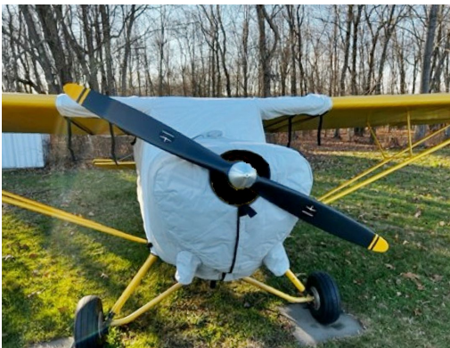
Aeronca Super Chief 11CC Extended Over-Top Canopy Cover, Insulated Engine Cover Aeronca Super Chief 11CC Extended Over-Top Canopy Cover, Insulated Engine Cover