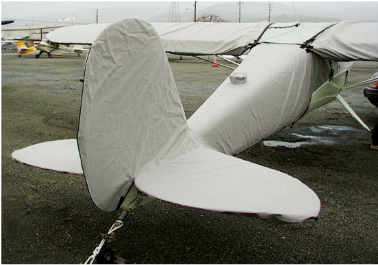
Cessna 120 Empennage Cover

WINTER USE MATERIAL - Made with Solution-Dyed Polyester fabric, this option is intended for seasonal use to aid in deicing, rain mitigation, or for occasional travel. The material is lighter and more compact, but more susceptible to UV damage and may have a shorter useful life if used continuously outside than the all-year use material.