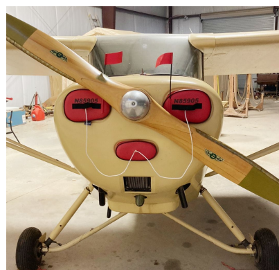
Aeronca 11AC Chief Engine Plugs