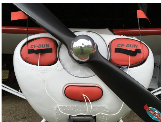
Aeronca 11AC Engine Inlet Plugs

Engine Inlet Plugs are custom fit for your Aeronca Chief 11AC, Super Chief 11CC intakes, made with heavy-duty vinyl material, and stuffed with a single block of sculpted urethane foam. Each plug has a zipper that allows the foam to be removed and dried if necessary. Engine plugs have warning flags that are visible from the cockpit or 'remove before flight' streamers sewn onto the face of the plugs. Most plugs are imprinted with the aircraft registration number in black for an extra charge. Storage bag NOT included. Engine plugs may be inserted after flight when the engine is still warm. Engine Inlet Plugs are commonly referred to as Cowl Plugs, Intake Plugs, Cowl Blocks, Engine Blocks, and Engine Bungs.