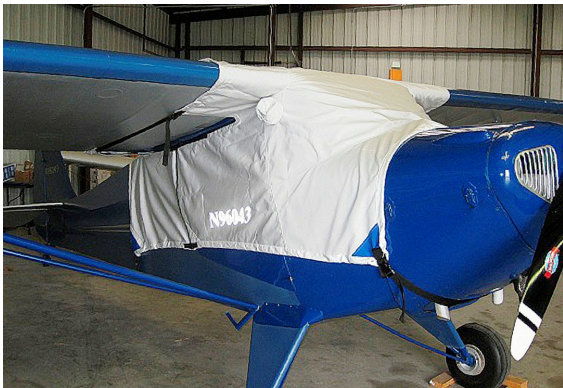
Taylorcraft BC12-D Over-the-top Canopy Cover

This cover type is made from Silver Acrylic Sunbrella canvas and is 100% lined with a soft and smooth microfiber. Bruce's Custom Covers developed this material combination especially for aircraft protection. The outer material is medium weight and treated for water resistance, UV resistance and anti-static buildup. The inner lining is a very soft and smooth microfiber to prevent scratching. The material is very reflective, and tests show that the cabin interior temperature can be reduced to near-ambient temperature on the hottest of days. It is water, ice and snow repellent, yet breathable to allow moisture to escape from between the cover and the aircraft surface.