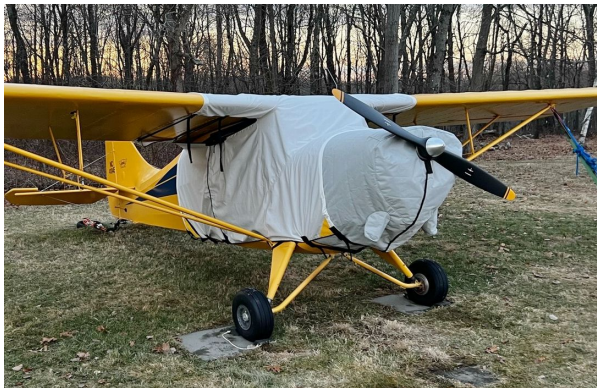
Aeronca Chief 11AC, Super Chief 11CC Insulated Engine Cover

This cover type is made from Silver Acrylic Sunbrella canvas and is 100% lined with a soft and smooth microfiber. Bruce's Custom Covers developed this material combination especially for aircraft protection. The outer material is medium weight and treated for water resistance, UV resistance and anti-static buildup. The inner lining is a very soft and smooth microfiber to prevent scratching. The material is very reflective, and tests show that the cabin interior temperature can be reduced to near-ambient temperature on the hottest of days. It is water, ice and snow repellent, yet breathable to allow moisture to escape from between the cover and the aircraft surface.