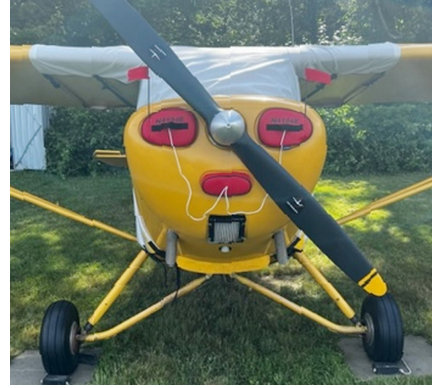
Aeronca 11CC Super Chief Engine Plugs, Extended Canopy Cover (also covers gas caps)