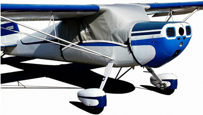
Cessna 120 Over-Top Canopy Cover

This cover type is made from Silver Acrylic Sunbrella canvas and is 100% lined with a soft and smooth microfiber. Bruce's Custom Covers developed this material combination especially for aircraft protection. The outer material is medium weight and treated for water resistance, UV resistance and anti-static buildup. The inner lining is a very soft and smooth microfiber to prevent scratching. The material is very reflective, and tests show that the cabin interior temperature can be reduced to near-ambient temperature on the hottest of days. It is water, ice and snow repellent, yet breathable to allow moisture to escape from between the cover and the aircraft surface.