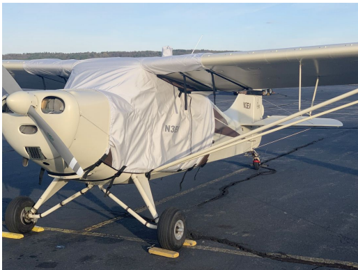
Aeronca Chief 11BC Extended Over-Top Canopy Cover