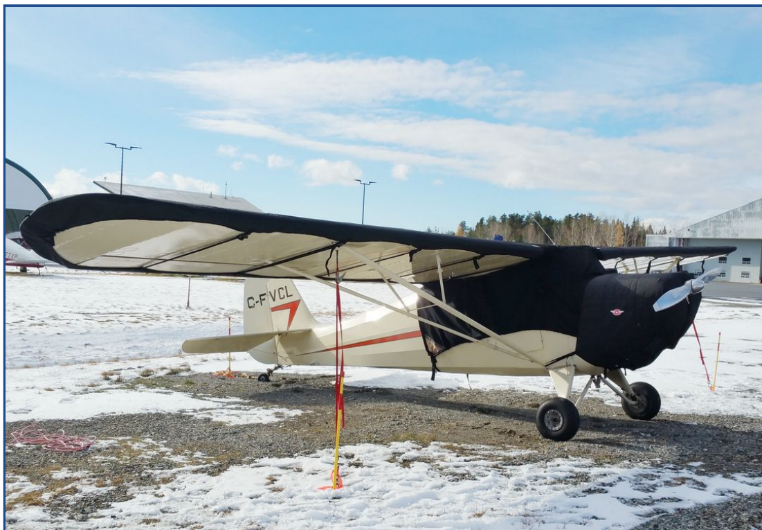
Aeronca Chief 11AC Canopy, Insulated Engine, &amp; Wing Covers