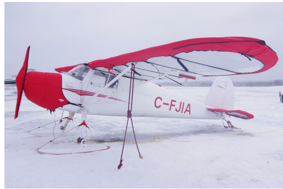
Cessna 120 Insulated Engine & Prop Covers, Wing & Tail Covers