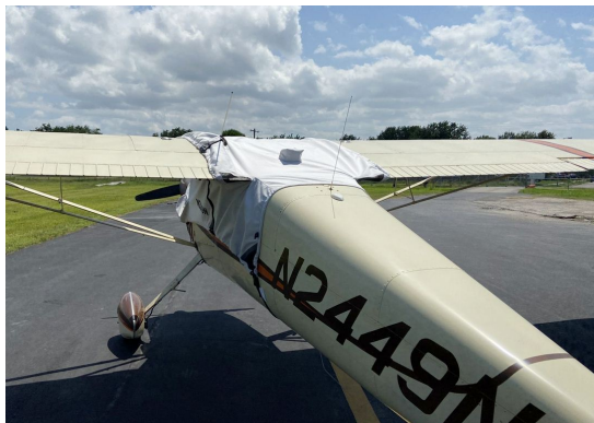
Cessna 140 Over-Top Canopy Cover

This cover type is made from Silver Acrylic Sunbrella canvas and is 100% lined with a soft and smooth microfiber. Bruce's Custom Covers developed this material combination especially for aircraft protection. The outer material is medium weight and treated for water resistance, UV resistance and anti-static buildup. The inner lining is a very soft and smooth microfiber to prevent scratching. The material is very reflective, and tests show that the cabin interior temperature can be reduced to near-ambient temperature on the hottest of days. It is water, ice and snow repellent, yet breathable to allow moisture to escape from between the cover and the aircraft surface.