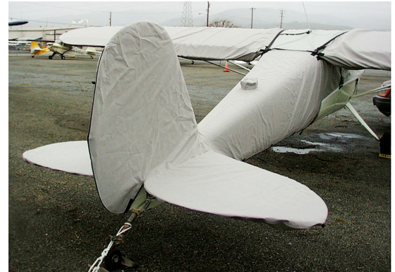
Cessna 120 Empennage & Wing Covers