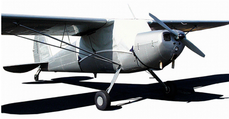
Cessna 120 Over-Top Canopy Cover