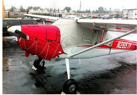
Cessna 180 Insulated Engine Cover