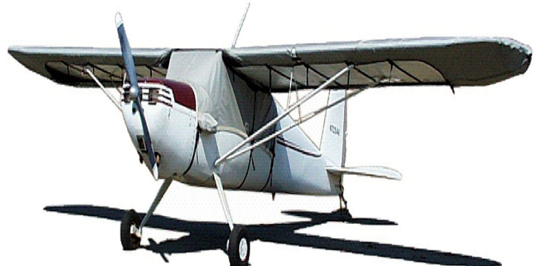
Cessna 120 Canopy Cover & Wing Covers