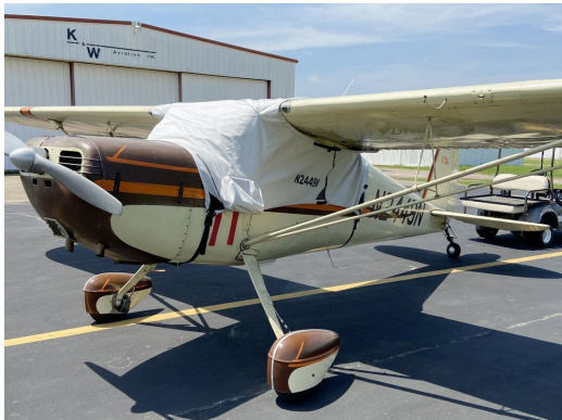
Cessna 140 Over-Top Canopy Cover

This cover type is made from Silver Acrylic Sunbrella canvas and is 100% lined with a soft and smooth microfiber. Bruce's Custom Covers developed this material combination especially for aircraft protection. The outer material is medium weight and treated for water resistance, UV resistance and anti-static buildup. The inner lining is a very soft and smooth microfiber to prevent scratching. The material is very reflective, and tests show that the cabin interior temperature can be reduced to near-ambient temperature on the hottest of days. It is water, ice and snow repellent, yet breathable to allow moisture to escape from between the cover and the aircraft surface.