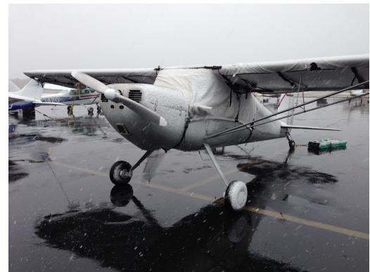
Cessna 120/140 Canopy and Wing Covers