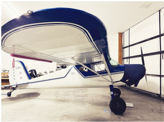
Cessna 140 Insulated Engine Cover

This cover type is made from Silver Acrylic Sunbrella canvas and is 100% lined with a soft and smooth microfiber. Bruce's Custom Covers developed this material combination especially for aircraft protection. The outer material is medium weight and treated for water resistance, UV resistance and anti-static buildup. The inner lining is a very soft and smooth microfiber to prevent scratching. The material is very reflective, and tests show that the cabin interior temperature can be reduced to near-ambient temperature on the hottest of days. It is water, ice and snow repellent, yet breathable to allow moisture to escape from between the cover and the aircraft surface.