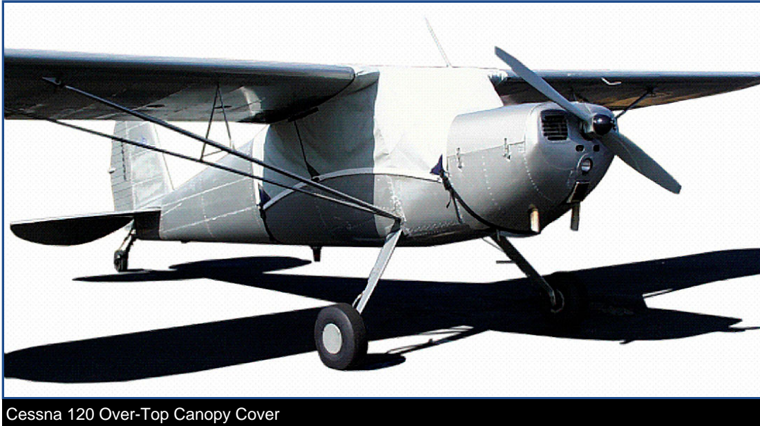
Cessna 120 Over-Top Canopy Cover