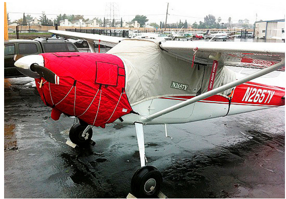
Cessna 180 Insulated Engine Cover