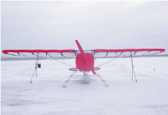
Cessna 120 Insulated Engine & Prop Covers, Wing & Tail Covers

WINTER USE MATERIAL - Made with Solution-Dyed Polyester fabric, this option is intended for seasonal use to aid in deicing, rain mitigation, or for occasional travel. The material is lighter and more compact, but more susceptible to UV damage and may have a shorter useful life if used continuously outside than the all-year use material.