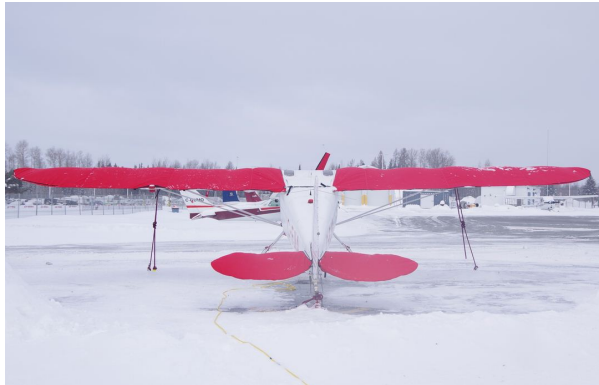
Cessna 120 Insulated Engine & Prop Covers, Wing & Tail Covers

WINTER USE MATERIAL - Made with Solution-Dyed Polyester fabric, this option is intended for seasonal use to aid in deicing, rain mitigation, or for occasional travel. The material is lighter and more compact, but more susceptible to UV damage and may have a shorter useful life if used continuously outside than the all-year use material.