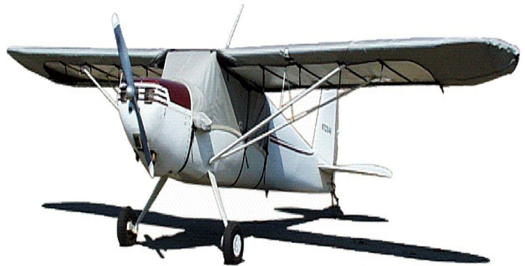
Cessna 120 Canopy Cover & Wing Covers