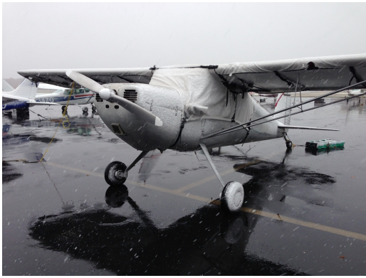
Cessna 120/140 Canopy and Wing Covers