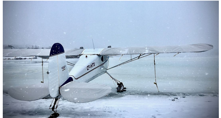
Cessna 140 Wing & Tail Covers