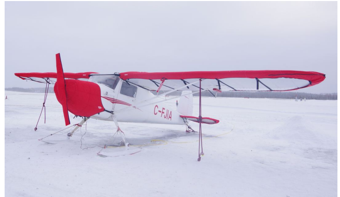
Cessna 120 Insulated Engine & Prop Covers, Wing & Tail Covers