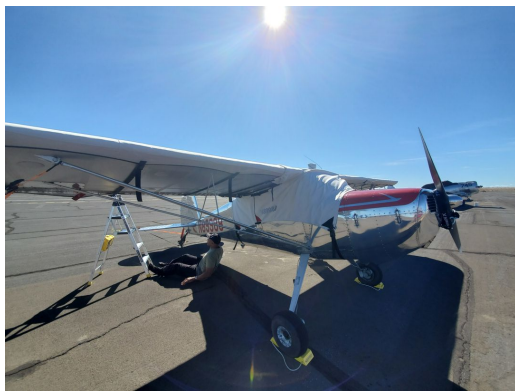
Cessna 140 Over The Top Style Canopy Cover