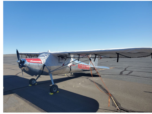
Cessna 140 Canopy, Engine, Wing & Empennage Covers