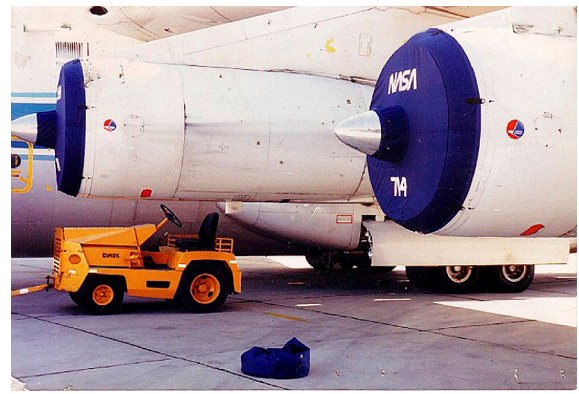
Intake Covers for Lockheed C-141