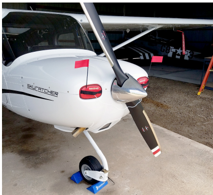
Cessna Skycatcher 162 Engine Inlet Plugs

Engine Inlet Plugs are custom fit for your Cessna Skycatcher 162 intakes, made with heavy-duty vinyl material, and stuffed with a single block of sculpted urethane foam. Each plug has a zipper that allows the foam to be removed and dried if necessary. Engine plugs have warning flags that are visible from the cockpit or 'remove before flight' streamers sewn onto the face of the plugs. Most plugs are imprinted with the aircraft registration number in black for an extra charge. Storage bag NOT included. Engine plugs may be inserted after flight when the engine is still warm. Engine Inlet Plugs are commonly referred to as Cowl Plugs, Intake Plugs, Cowl Blocks, Engine Blocks, and Engine Bungs.