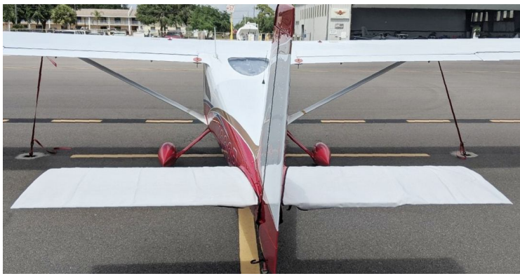
Cessna 162 Skycatcher Horizontal Stabilizer Covers