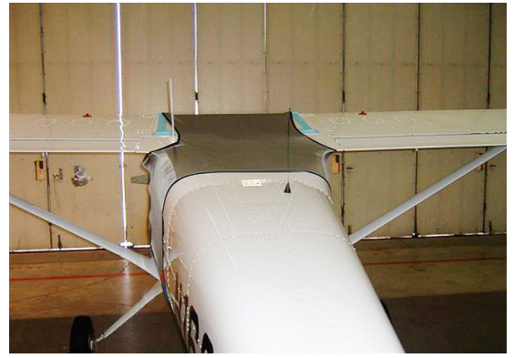
Cessna Skycatcher Canopy Cover