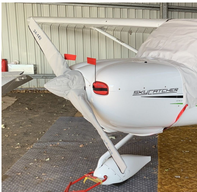
Cessna Skycatcher Prop/Spinner Cover, Engine Plugs