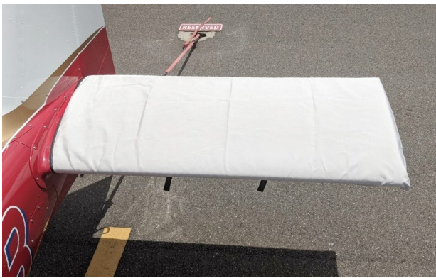
Cessna 162 Skycatcher Horizontal Stabilizer Covers