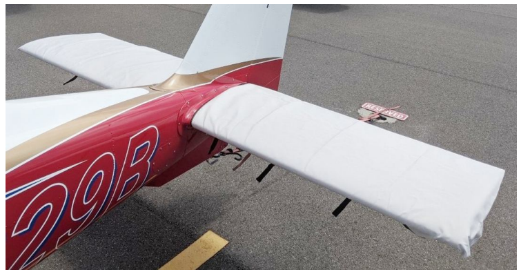
Cessna 162 Skycatcher Horizontal Stabilizer Covers