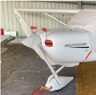
Cessna Skycatcher Prop/Spinner Cover, Engine Plugs