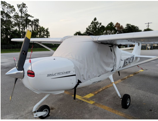
Cessna Skycatcher 162 Canopy Cover and Engine Inlet Plugs