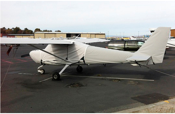
Cessna Skycatcher Full Cover Set