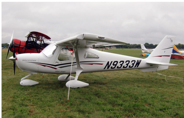
Cessna Skycatcher 162 Heatshield Set