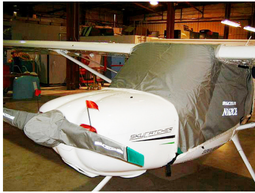
Cessna Skycatcher Standard Canopy Cover, Propellor Cover & Engine Inlet Plugs