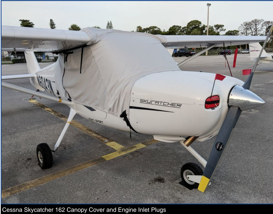
Cessna Skycatcher 162 Canopy Cover and Engine Inlet Plugs