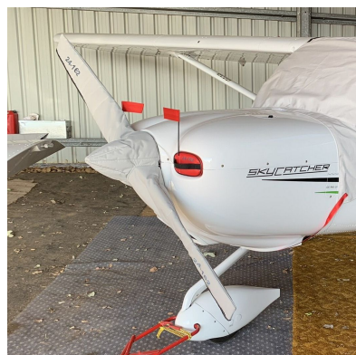
Cessna Skycatcher Prop/Spinner Cover, Engine Plugs