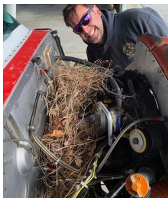
Cessna 172 Bird Nest Problem

Engine Inlet Plugs are custom fit for your Cessna Skycatcher 162 intakes, made with heavy-duty vinyl material, and stuffed with a single block of sculpted urethane foam. Each plug has a zipper that allows the foam to be removed and dried if necessary. Engine plugs have warning flags that are visible from the cockpit or 'remove before flight' streamers sewn onto the face of the plugs. Most plugs are imprinted with the aircraft registration number in black for an extra charge. Storage bag NOT included. Engine plugs may be inserted after flight when the engine is still warm. Engine Inlet Plugs are commonly referred to as Cowl Plugs, Intake Plugs, Cowl Blocks, Engine Blocks, and Engine Bunges.