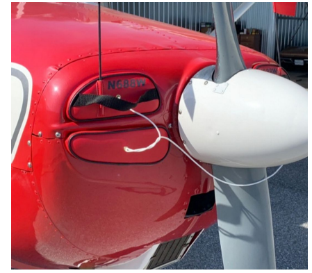
Cessna 170 Engine Plugs