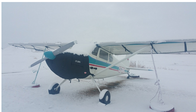
Cessna 170 Insulated Engine Cover, Wing Covers