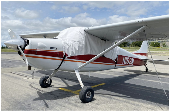
Cessna 170B Canopy Cover, Wrap-Around, Metal Wing Models