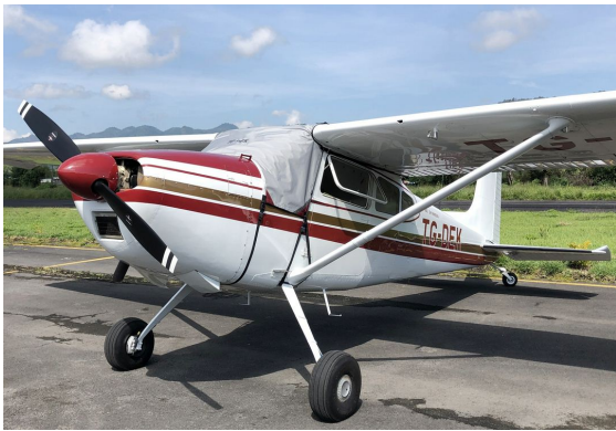
Cessna 180 Windshield Cover

This cover type is made from Silver Acrylic Sunbrella canvas and is 100% lined with a soft and smooth microfiber. Bruce's Custom Covers developed this material combination especially for aircraft protection. The outer material is medium weight and treated for water resistance, UV resistance and anti-static buildup. The inner lining is a very soft and smooth microfiber to prevent scratching. The material is very reflective, and tests show that the cabin interior temperature can be reduced to near-ambient temperature on the hottest of days. It is water, ice and snow repellent, yet breathable to allow moisture to escape from between the cover and the aircraft surface.