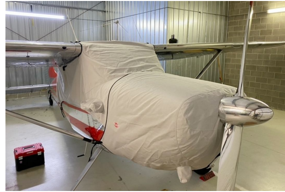
Cessna 170 Engine & Canopy Covers