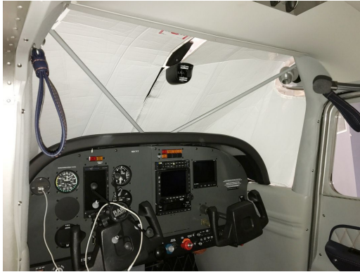
Cessna 180 Skywagon Windshield Heatshield, (W/ Compass)

Windshield Heatshields are interior sunshades for an aircraft's front windshield. The product is a unique composite of closed-cell foam with a silver mylar finish. The semi-rigid design is stiff enough to stand along the inside of the windshield using sun visors or window framing. It folds up flat and easily stores in the included storage sleeve. Some designs may require velcro and suction cups or split right and left sides. A Heatshield is an excellent short-term remedy for cockpit overheating. An external fabric cover is far more effective and practical for long-term protection.