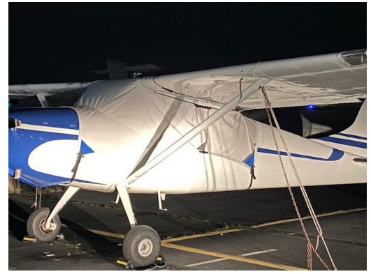
Cessna 170 Over-Top Canopy Cover