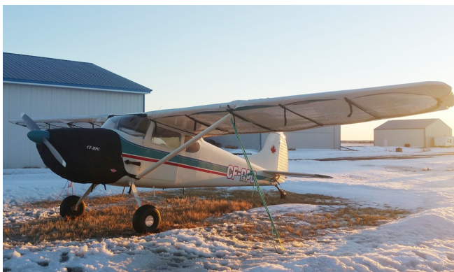
Cessna 170 Insulated Engine Cover, Wing Covers

WINTER USE MATERIAL - Made with Solution-Dyed Polyester fabric, this option is intended for seasonal use to aid in deicing, rain mitigation, or for occasional travel. The material is lighter and more compact, but more susceptible to UV damage and may have a shorter useful life if used continuously outside than the all-year use material.