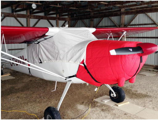
Cessna 170 Insulated Engine Cover

This cover type is made from Silver Acrylic Sunbrella canvas and is 100% lined with a soft and smooth microfiber. Bruce's Custom Covers developed this material combination especially for aircraft protection. The outer material is medium weight and treated for water resistance, UV resistance and anti-static buildup. The inner lining is a very soft and smooth microfiber to prevent scratching. The material is very reflective, and tests show that the cabin interior temperature can be reduced to near-ambient temperature on the hottest of days. It is water, ice and snow repellent, yet breathable to allow moisture to escape from between the cover and the aircraft surface.