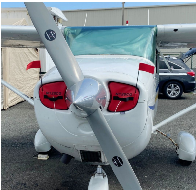
Cessna 172 Engine Inlet Plugs

Engine Inlet Plugs are custom fit for your Cessna 172 & 175 (T-41) intakes, made with heavy-duty vinyl material, and stuffed with a single block of sculpted urethane foam. Each plug has a zipper that allows the foam to be removed and dried if necessary. Engine plugs have warning flags that are visible from the cockpit or 'remove before flight' streamers sewn onto the face of the plugs. Most plugs are imprinted with the aircraft registration number in black for an extra charge. Storage bag NOT included. Engine plugs may be inserted after flight when the engine is still warm. Engine Inlet Plugs are commonly referred to as Cowl Plugs, Intake Plugs, Cowl Blocks, Engine Blocks, and Engine Bungs.