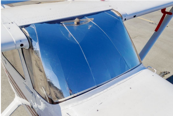
Cessna 172 Windshield HeatShield

Windshield Heatshields are interior sunshades for an aircraft's front windshield. The product is a unique composite of closed-cell foam with a silver mylar finish. The semi-rigid design is stiff enough to stand along the inside of the windshield using sun visors or window framing. It folds up flat and easily stores in the included storage sleeve. Some designs may require velcro and suction cups or split right and left sides. A Heatshield is an excellent short-term remedy for cockpit overheating. An external fabric cover is far more effective and practical for long-term protection.