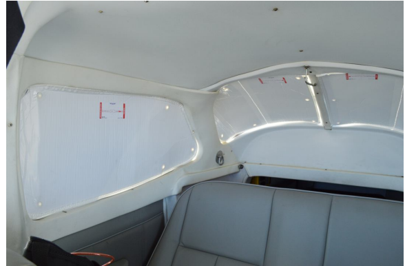
Cessna 172 Cockpit HeatShields