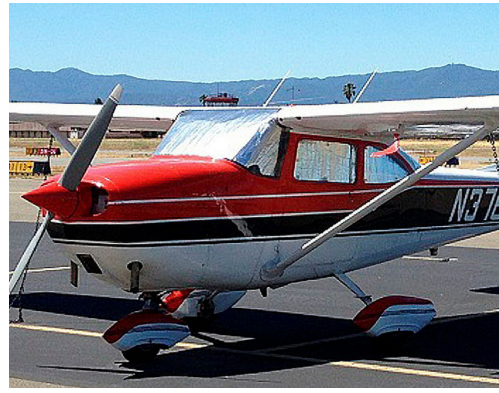
Cessna 172 Cabin HeatShields