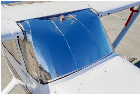
Cessna 172 Windshield HeatShield