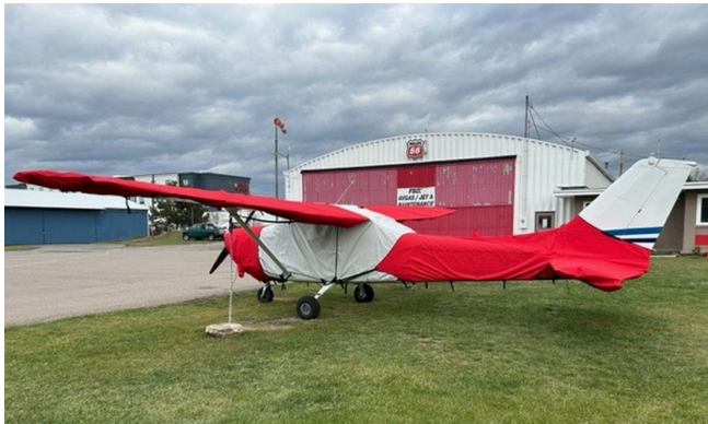
Cessna 172 Cold Weather Cover Set

This cover type is made from Silver Acrylic Sunbrella canvas and is 100% lined with a soft and smooth microfiber. Bruce's Custom Covers developed this material combination especially for aircraft protection. The outer material is medium weight and treated for water resistance, UV resistance and anti-static buildup. The inner lining is a very soft and smooth microfiber to prevent scratching. The material is very reflective, and tests show that the cabin interior temperature can be reduced to near-ambient temperature on the hottest of days. It is water, ice and snow repellent, yet breathable to allow moisture to escape from between the cover and the aircraft surface.