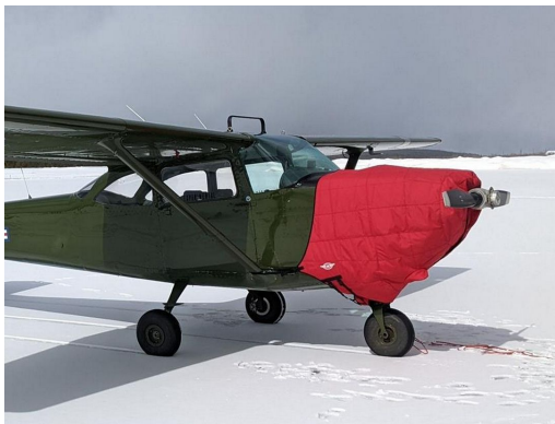
Cessna T-41 Insulated Engine Cover

This cover type is made from Silver Acrylic Sunbrella canvas and is 100% lined with a soft and smooth microfiber. Bruce's Custom Covers developed this material combination especially for aircraft protection. The outer material is medium weight and treated for water resistance, UV resistance and anti-static buildup. The inner lining is a very soft and smooth microfiber to prevent scratching. The material is very reflective, and tests show that the cabin interior temperature can be reduced to near-ambient temperature on the hottest of days. It is water, ice and snow repellent, yet breathable to allow moisture to escape from between the cover and the aircraft surface.