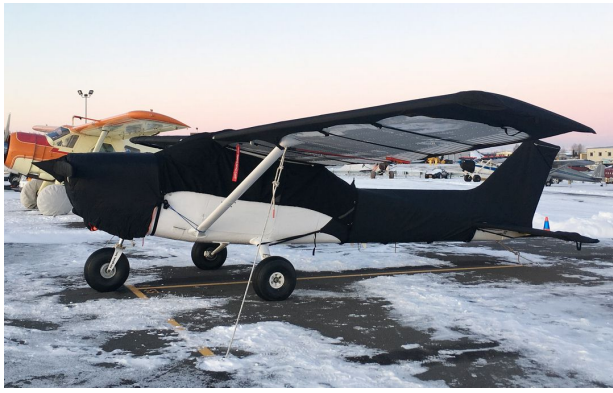
Cessna 172 Canopy, Engine, Prop, Wing & Empennage Covers