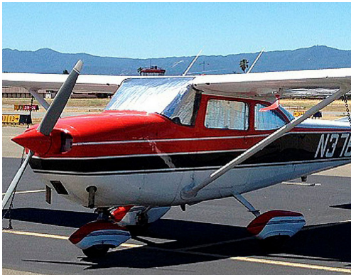
Cessna 172 Cabin HeatShields

Windshield Heatshields are interior sunshades for an aircraft's front windshield. The product is a unique composite of closed-cell foam with a silver mylar finish. The semi-rigid design is stiff enough to stand along the inside of the windshield using sun visors or window framing. It folds up flat and easily stores in the included storage sleeve. Some designs may require velcro and suction cups or split right and left sides. A Heatshield is an excellent short-term remedy for cockpit overheating. An external fabric cover is far more effective and practical for long-term protection.