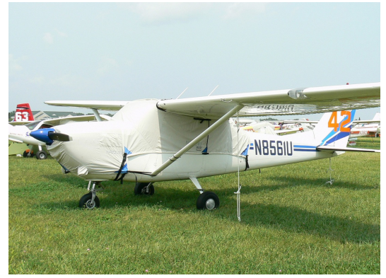
Cessna 172 Canopy Cover & Engine Cover