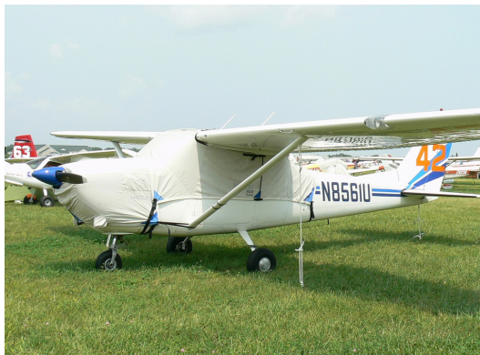
Cessna 172 Canopy Cover & Engine Cover

This cover type is made from Silver Acrylic Sunbrella canvas and is 100% lined with a soft and smooth microfiber. Bruce's Custom Covers developed this material combination especially for aircraft protection. The outer material is medium weight and treated for water resistance, UV resistance and anti-static buildup. The inner lining is a very soft and smooth microfiber to prevent scratching. The material is very reflective, and tests show that the cabin interior temperature can be reduced to near-ambient temperature on the hottest of days. It is water, ice and snow repellent, yet breathable to allow moisture to escape from between the cover and the aircraft surface.