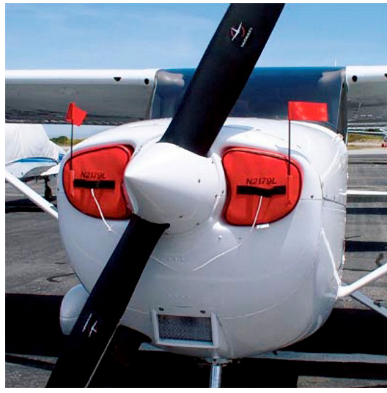
Cessna 172 Engine Plugs