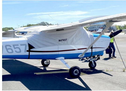
Cessna 172N Wrap Around Canopy Cover