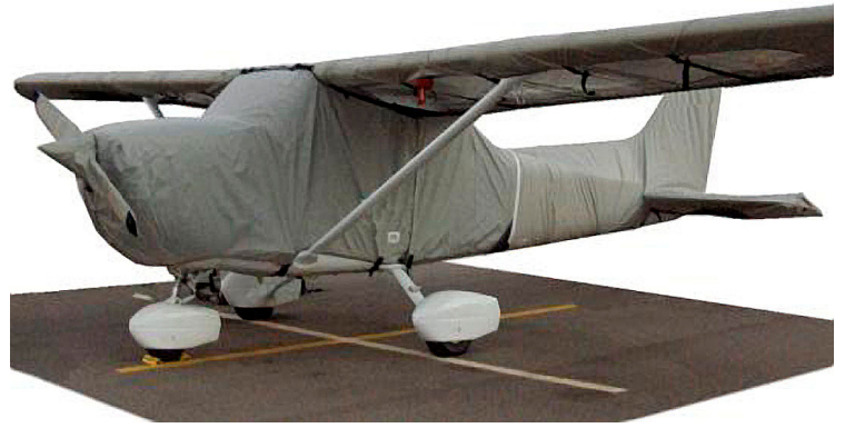
Cessna 172 Propellor Cover, 2 Blade