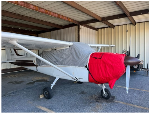
Cessna 172K Insulated Engine Cover, Travel Weight Canopy Cover