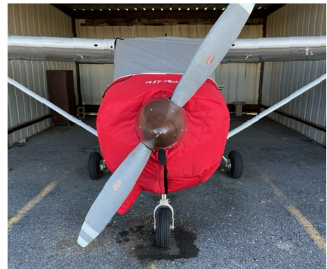
Cessna 172K Insulated Engine Cover