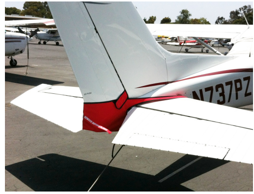
Cessna 172 Tailcone Cover