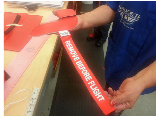
Cessna 150 Pitot Cover