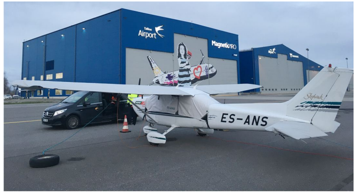
Cessna 172R Wing Covers