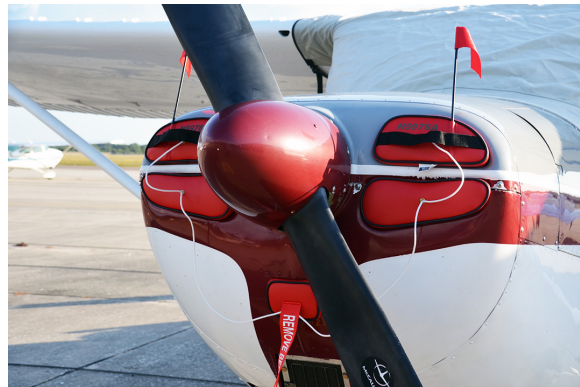
Cessna 172 & 175 (T-41, T-41A/C) Engine Inlet Plugs (Specify Model And Year)