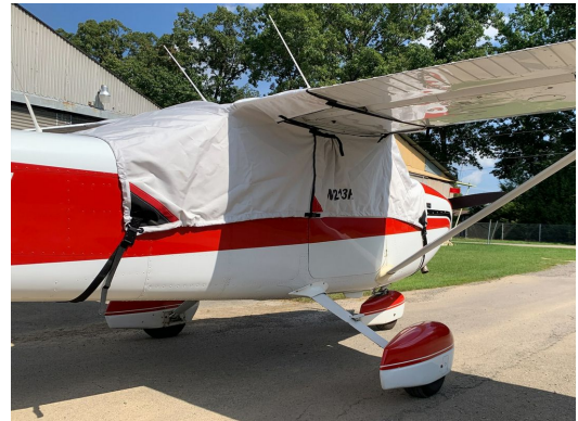
Cessna 172M Over The Top Style Canopy Cover