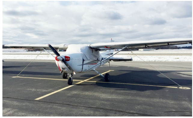
Cessna 172 Engine Plugs and Canopy, Wing, Horizontal Stabilizer Covers