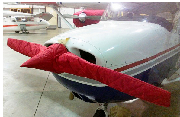
Cessna 172 2-blade Insulated Propellor/Spinner Cover