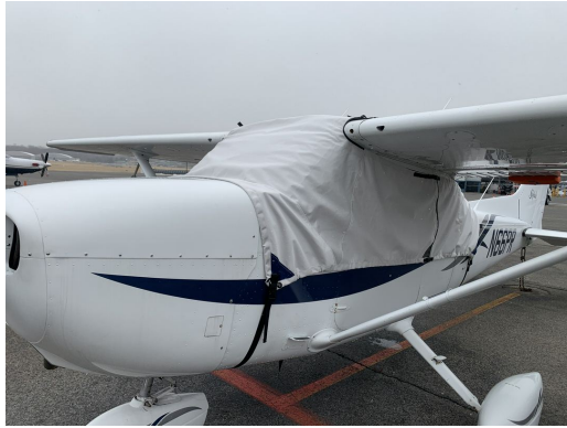
Cessna 172N Wrap Around Canopy Cover

This cover type is made from Silver Acrylic Sunbrella canvas and is 100% lined with a soft and smooth microfiber. Bruce's Custom Covers developed this material combination especially for aircraft protection. The outer material is medium weight and treated for water resistance, UV resistance and anti-static buildup. The inner lining is a very soft and smooth microfiber to prevent scratching. The material is very reflective, and tests show that the cabin interior temperature can be reduced to near-ambient temperature on the hottest of days. It is water, ice and snow repellent, yet breathable to allow moisture to escape from between the cover and the aircraft surface.