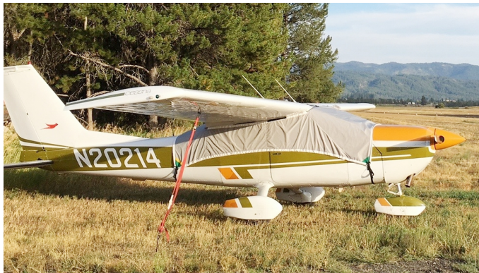
Cessna 177 Cardinal Lightweight Travel Canopy Cover