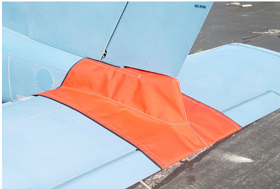
Cessna 177 Cardinal Tailcone Cover

shorter useful life if used continuously outside than the all-year use material.