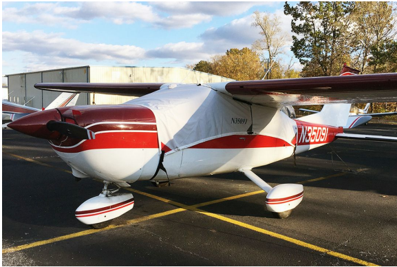
Cessna 177 Cardinal Canopy Cover, Wrap-Around

This cover type is made from Silver Acrylic Sunbrella canvas and is 100% lined with a soft and smooth microfiber. Bruce's Custom Covers developed this material combination especially for aircraft protection. The outer material is medium weight and treated for water resistance, UV resistance and anti-static buildup. The inner lining is a very soft and smooth microfiber to prevent scratching. The material is very reflective, and tests show that the cabin interior temperature can be reduced to near-ambient temperature on the hottest of days. It is water, ice and snow repellent, yet breathable to allow moisture to escape from between the cover and the aircraft surface.