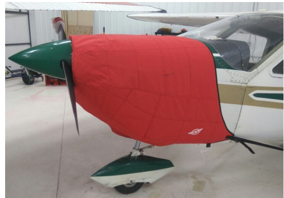
Cessna 177 Cardinal Insulated Engine Cover, Powerflow Exhaust