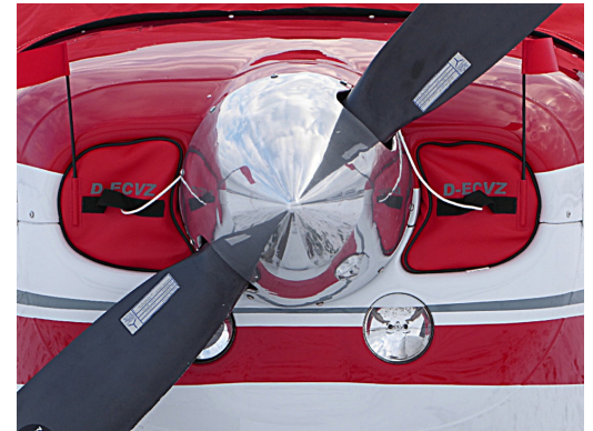
Cessna Cardinal 177B Engine Plugs