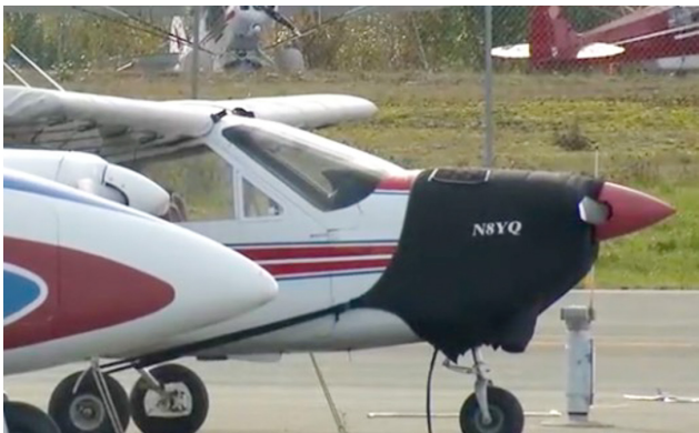
Cessna 177 Cardinal Insulated Engine Cover

This cover type is made from Silver Acrylic Sunbrella canvas and is 100% lined with a soft and smooth microfiber. Bruce's Custom Covers developed this material combination especially for aircraft protection. The outer material is medium weight and treated for water resistance, UV resistance and anti-static buildup. The inner lining is a very soft and smooth microfiber to prevent scratching. The material is very reflective, and tests show that the cabin interior temperature can be reduced to near-ambient temperature on the hottest of days. It is water, ice and snow repellent, yet breathable to allow moisture to escape from between the cover and the aircraft surface.