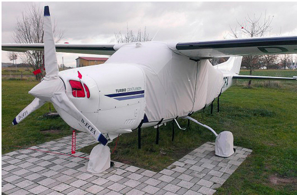
Cessna 210 Extended Canopy Cover, Engine Plugs, Prop and Tire Covers

Engine Inlet Plugs are custom fit for your Cessna 177 Cardinal intakes, made with heavy-duty vinyl material, and stuffed with a single block of sculpted urethane foam. Each plug has a zipper that allows the foam to be removed and dried if necessary. Engine plugs have warning flags that are visible from the cockpit or 'remove before flight' streamers sewn onto the face of the plugs. Most plugs are imprinted with the aircraft registration number in black for an extra charge. Storage bag NOT included. Engine plugs may be inserted after flight when the engine is still warm. Engine Inlet Plugs are commonly referred to as Cowl Plugs, Intake Plugs, Cowl Blocks, Engine Blocks, and Engine Bungs.