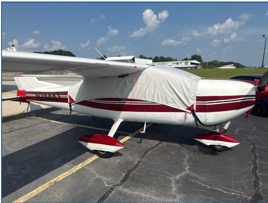
Cessna 177 Canopy Cover, Wrap-Around