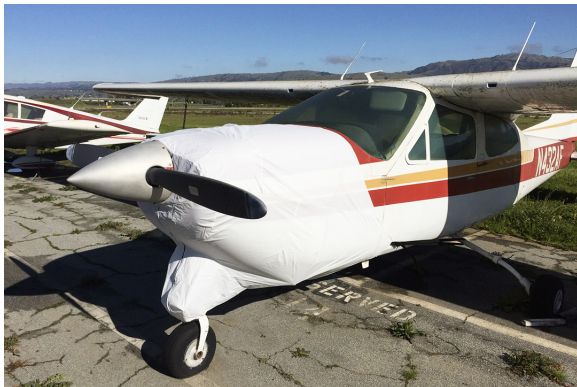
Cessna Cardinal RG Insulated Engine Cover, fully enclosed (test fit)

This cover type is made from Silver Acrylic Sunbrella canvas and is 100% lined with a soft and smooth microfiber. Bruce's Custom Covers developed this material combination especially for aircraft protection. The outer material is medium weight and treated for water resistance, UV resistance and anti-static buildup. The inner lining is a very soft and smooth microfiber to prevent scratching. The material is very reflective, and tests show that the cabin interior temperature can be reduced to near-ambient temperature on the hottest of days. It is water, ice and snow repellent, yet breathable to allow moisture to escape from between the cover and the aircraft surface.