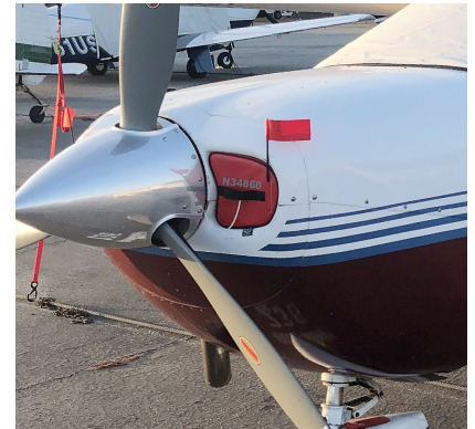
Cessna Cardinal Engine Plugs