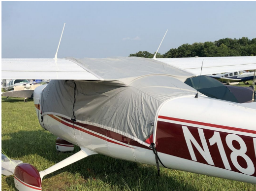
Cessna 177 Cardinal Lightweight Travel Canopy Cover