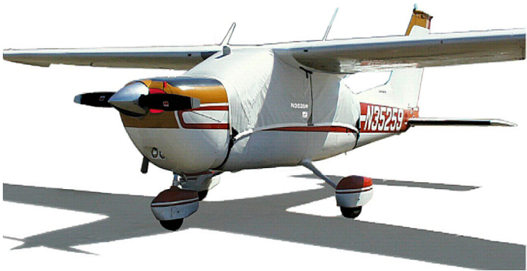
Canopy Cover & Intake Plugs for the Cessna Cardinal

This cover type is made from Silver Acrylic Sunbrella canvas and is 100% lined with a soft and smooth microfiber. Bruce's Custom Covers developed this material combination especially for aircraft protection. The outer material is medium weight and treated for water resistance, UV resistance and anti-static buildup. The inner lining is a very soft and smooth microfiber to prevent scratching. The material is very reflective, and tests show that the cabin interior temperature can be reduced to near-ambient temperature on the hottest of days. It is water, ice and snow repellent, yet breathable to allow moisture to escape from between the cover and the aircraft surface.