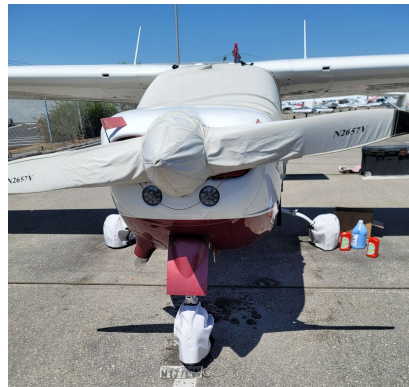
Cessna 177RG Tire & Prop Covers

ALL-YEAR USE MATERIAL - Made with Silver Acrylic Sunbrella canvas, the all-year use material is the best option for sun protection and cover longevity. This heavier more durable material is intended for all weather conditions, such as rain and snow or lots of sun.