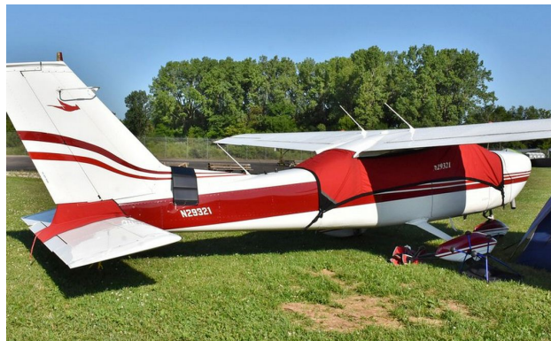
Cessna Cardinal C-177 Tailcone Cover custom color in Red