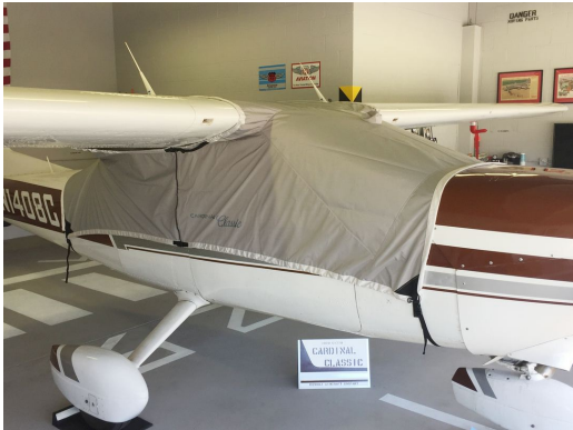
Cessna 177 Cardinal Travel Cover, Light Weight Travel Canopy Cover (Over-The-Top Style), 7 Lbs

Travel Covers are made with Silver Solution-Dyed Polyester fabric and only lined over the windshield to save weight. The material is lightweight and more compact for easy stowage in the aircraft. The polyester material is water resistant, but only intended for occasional use outside. We also have an ultra lightweight material available for fitted hangar dust covers. For daily outdoor use, the non-travel Sunbrella Cover is the best choice.