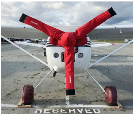
Cessna Skywagon Propellor/Spinner Cover, 3-blade type