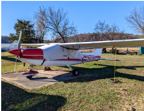
Cessna 177 Cardinal Engine Inlet Plugs, Fixed Gear Models (1968-72)

Engine Inlet Plugs are custom fit for your Cessna 177 Cardinal intakes, made with heavy-duty vinyl material, and stuffed with a single block of sculpted urethane foam. Each plug has a zipper that allows the foam to be removed and dried if necessary. Engine plugs have warning flags that are visible from the cockpit or 'remove before flight' streamers sewn onto the face of the plugs. Most plugs are imprinted with the aircraft registration number in black for an extra charge. Storage bag NOT included. Engine plugs may be inserted after flight when the engine is still warm. Engine Inlet Plugs are commonly referred to as Cowl Plugs, Intake Plugs, Cowl Blocks, Engine Blocks, and Engine Bungs.