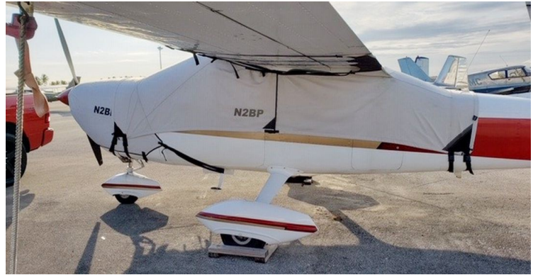
Cessna Cardinal 177 Engine Cover & Over-Top Canopy Cover with Wing Extensions