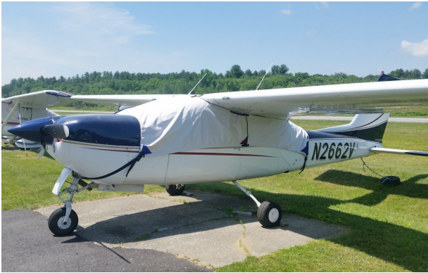
Cessna 177RG Wrap Around Canopy Cover