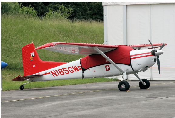
Cessna 185 Canopy Cover

This cover type is made from Silver Acrylic Sunbrella canvas and is 100% lined with a soft and smooth microfiber. Bruce's Custom Covers developed this material combination especially for aircraft protection. The outer material is medium weight and treated for water resistance, UV resistance and anti-static buildup. The inner lining is a very soft and smooth microfiber to prevent scratching. The material is very reflective, and tests show that the cabin interior temperature can be reduced to near-ambient temperature on the hottest of days. It is water, ice and snow repellent, yet breathable to allow moisture to escape from between the cover and the aircraft surface.