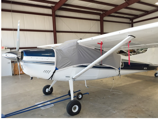
Cessna 180 Light Weight Travel Cover

The material is very reflective, and tests show that the cabin interior temperature can be reduced to near-ambient temperature on the hottest of days. It is water, ice and snow repellent, yet breathable to allow moisture to escape from between the cover and the aircraft surface.