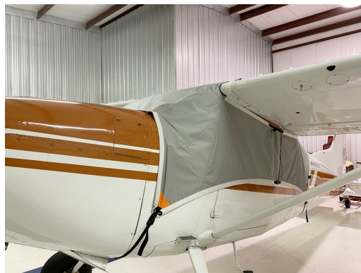
Cessna 180 Travel Weight Canopy Cover