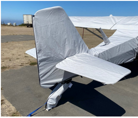
Kitfox Full Cover Set