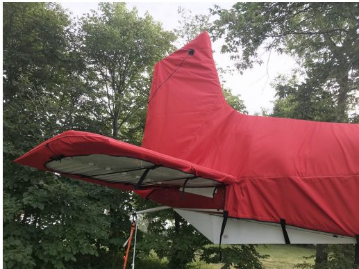
Cessna 185 Empennage Cover