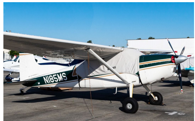
Cessna A185F Canopy Cover, Engine Plugs