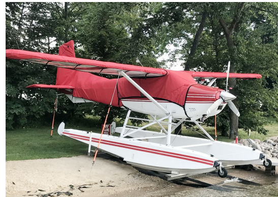
Cessna 180A Canopy, Engine, Wing & Empennage Covers Cessna 185 Canopy, Wings & Empennage Covers, and Engine Plugs