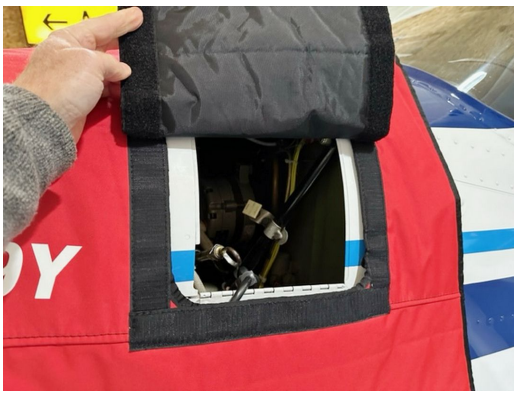
Cessna 180H Insulated Engine Cover