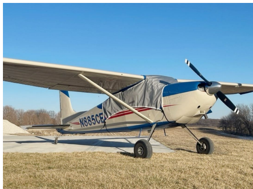
Cessna 180 Travel Weight Canopy Cover

This cover type is made from Silver Acrylic Sunbrella canvas and is 100% lined with a soft and smooth microfiber. Bruce's Custom Covers developed this material combination especially for aircraft protection. The outer material is medium weight and treated for water resistance, UV resistance and anti-static buildup. The inner lining is a very soft and smooth microfiber to prevent scratching. The material is very reflective, and tests show that the cabin interior temperature can be reduced to near-ambient temperature on the hottest of days. It is water, ice and snow repellent, yet breathable to allow moisture to escape from between the cover and the aircraft surface.