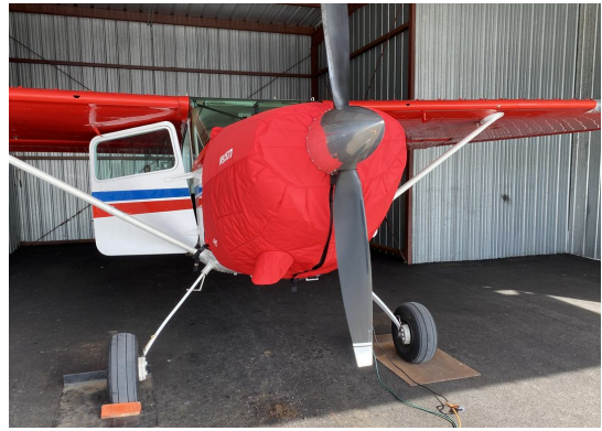
Cessna 180C Insulated Engine Cover