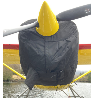
Cessna 180H Insulated Engine Cover