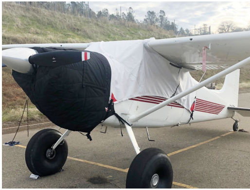
Insulated Engine Cover, Canopy Cover