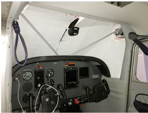
Cessna 180 Skywagon Windshield Heatshield, (W/ Compass)

Windshield Heatshields are interior sunshades for an aircraft's front windshield. The product is a unique composite of closed-cell foam with a silver mylar finish. The semi-rigid design is stiff enough to stand along the inside of the windshield using sun visors or window framing. It folds up flat and easily stores in the included storage sleeve. Some designs may require velcro and suction cups or split right and left sides. A Heatshield is an excellent short-term remedy for cockpit overheating. An external fabric cover is far more effective and practical for long-term protection.