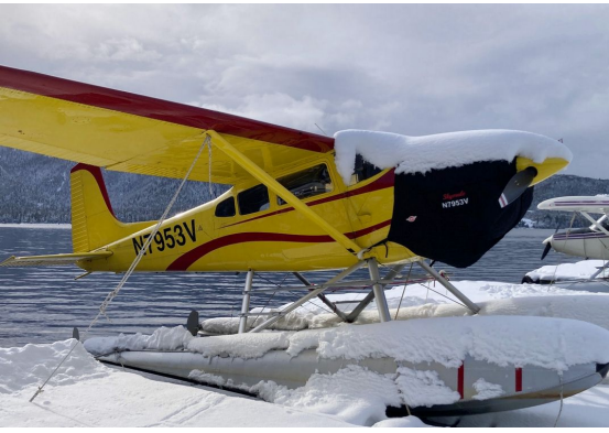
Cessna 185 Insulated Engine Cover