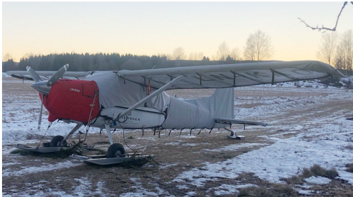
Cessna A185E Winter Cover Set

WINTER USE MATERIAL - Made with Solution-Dyed Polyester fabric, this option is intended for seasonal use to aid in deicing, rain mitigation, or for occasional travel. The material is lighter and more compact, but more susceptible to UV damage and may have a shorter useful life if used continuously outside than the all-year use material.