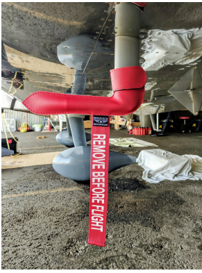
Van's RV-14 Pitot Cover