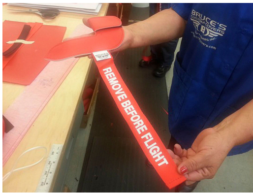
Cessna 150 Pitot Cover