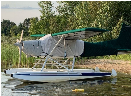
Cessna A185F Complete Cover Set

WINTER USE MATERIAL - Made with Solution-Dyed Polyester fabric, this option is intended for seasonal use to aid in deicing, rain mitigation, or for occasional travel. The material is lighter and more compact, but more susceptible to UV damage and may have a shorter useful life if used continuously outside than the all-year use material.