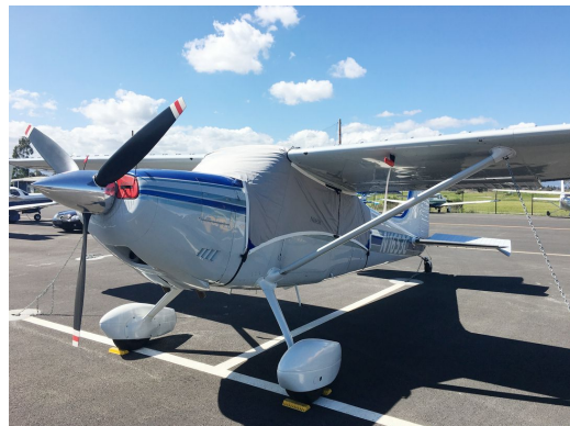
Cessna 180 Travel Weight Canopy Cover, Engine Plugs