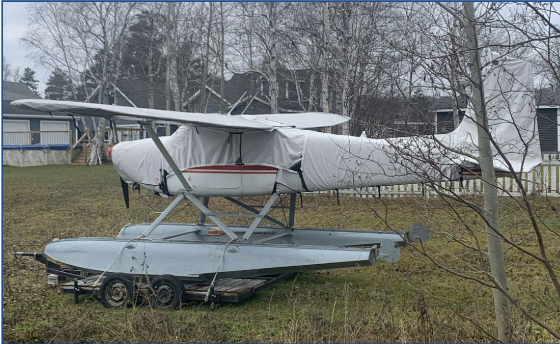
Cessna 180A Canopy, Engine, Wing &amp; Empennage Covers