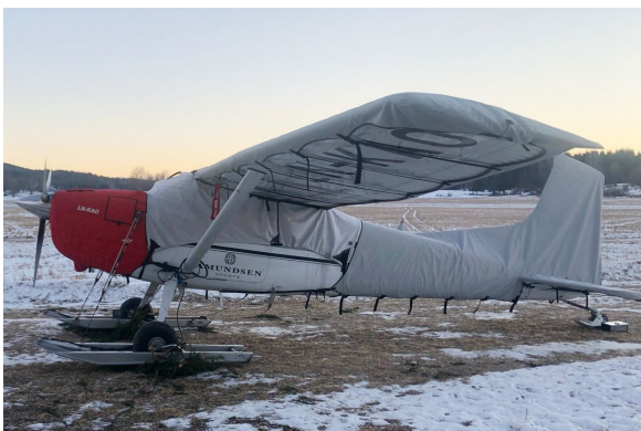
Cessna A185E Winter Cover Set

This cover type is made from Silver Acrylic Sunbrella canvas and is 100% lined with a soft and smooth microfiber. Bruce's Custom Covers developed this material combination especially for aircraft protection. The outer material is medium weight and treated for water resistance, UV resistance and anti-static buildup. The inner lining is a very soft and smooth microfiber to prevent scratching. The material is very reflective, and tests show that the cabin interior temperature can be reduced to near-ambient temperature on the hottest of days. It is water, ice and snow repellent, yet breathable to allow moisture to escape from between the cover and the aircraft surface.