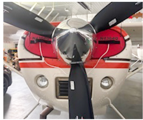
Cessna A185F Engine Inlet Plugs (set of 2)