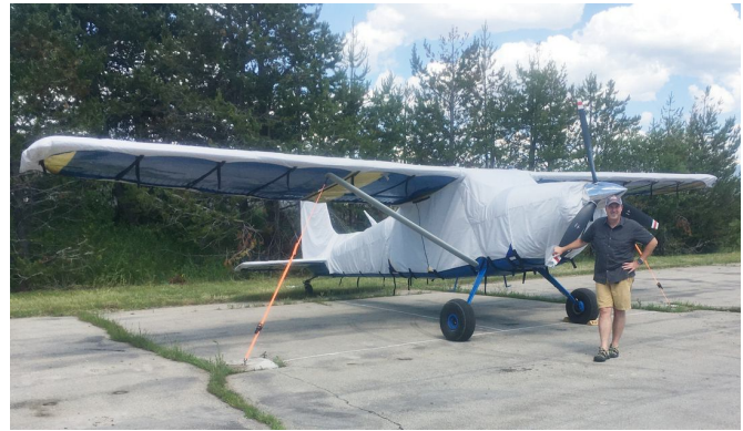
Cessna 180 Complete Hail Protection Cover Set