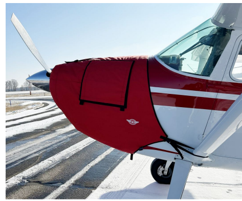
Cessna 180 Insulated Engine Cover, fully enclosed