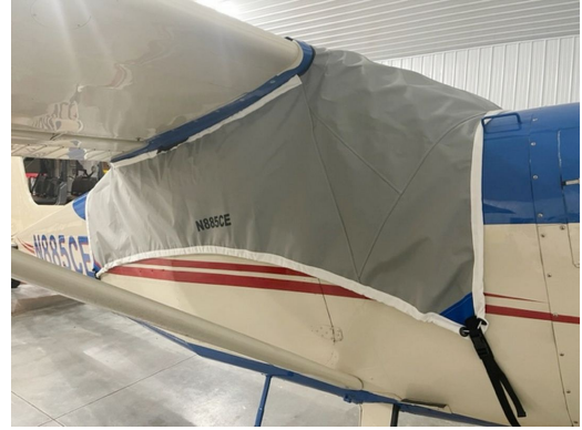
Cessna 180 Travel Weight Canopy Cover