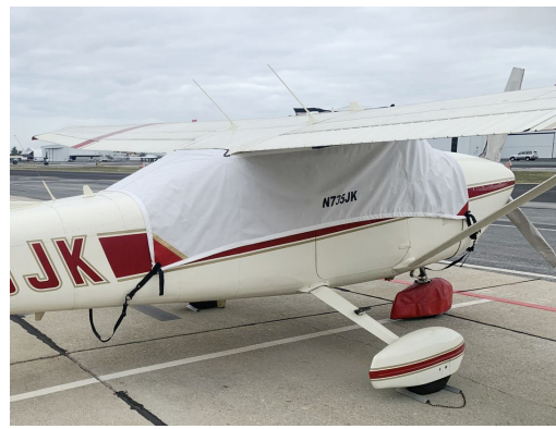
Cessna 182 Skylane Canopy, Prop & Nose Wheelpant Covers