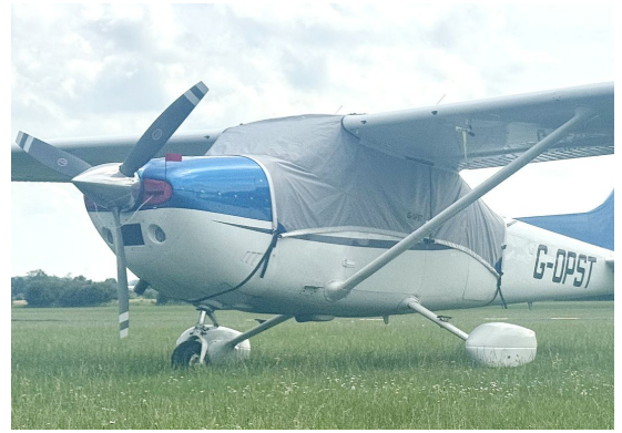
Cessna 182 Travel Weight Canopy Cover