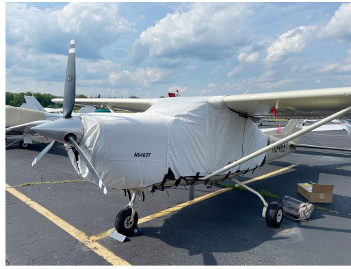
Cessna 182 Skylane Extended Canopy Cover, Over-Top Type, & Engine Cover