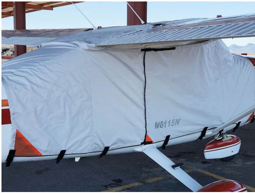
Cessna 182 (T182) Over-Top Extended Canopy Cover

Engine Inlet Plugs are custom fit for your Cessna 182 Skylane intakes, made with heavy-duty vinyl material, and stuffed with a single block of sculpted urethane foam. Each plug has a zipper that allows the foam to be removed and dried if necessary. Engine plugs have warning flags that are visible from the cockpit or 'remove before flight' streamers sewn onto the face of the plugs. Most plugs are imprinted with the aircraft registration number in black for an extra charge. Storage bag NOT included. Engine plugs may be inserted after flight when the engine is still warm. Engine Inlet Plugs are commonly referred to as Cowl Plugs, Intake Plugs, Cowl Blocks, Engine Blocks, and Engine Bungs.