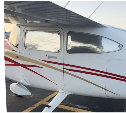
Cessna 182 Cabin HeatShields