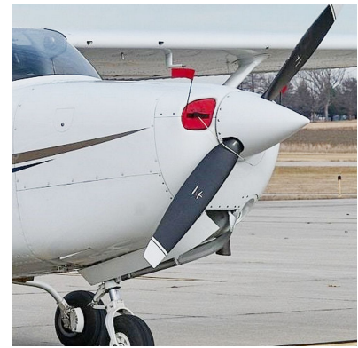
Cessna TR182 Engine Plugs