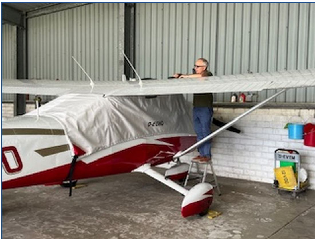
182 Skylane Canopy Cover, Wrap-Around (1964 &amp; up)