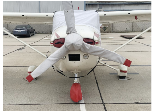
Cessna 182 Skylane Canopy, Prop & Nose Wheelpant Covers Cessna 182 Skylane Canopy, Prop & Nose Wheelpant Covers