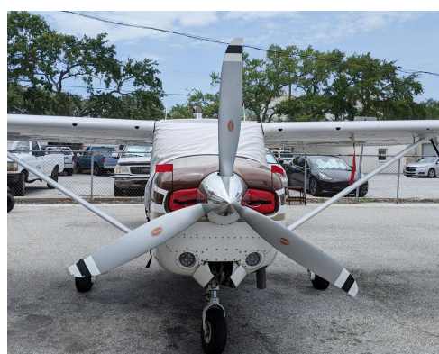
Cessna TR182 Engine Inlet Plugs