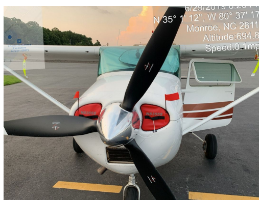
Cessna 182 Engine Inlet Plugs

Engine Inlet Plugs are custom fit for your Cessna 182 Skylane intakes, made with heavy-duty vinyl material, and stuffed with a single block of sculpted urethane foam. Each plug has a zipper that allows the foam to be removed and dried if necessary. Engine plugs have warning flags that are visible from the cockpit or 'remove before flight' streamers sewn onto the face of the plugs. Most plugs are imprinted with the aircraft registration number in black for an extra charge. Storage bag NOT included. Engine plugs may be inserted after flight when the engine is still warm. Engine Inlet Plugs are commonly referred to as Cowl Plugs, Intake Plugs, Cowl Blocks, Engine Blocks, and Engine Bungs.