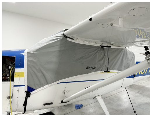
Cessna 182 Light Weight Wrap Around Canopy Cover