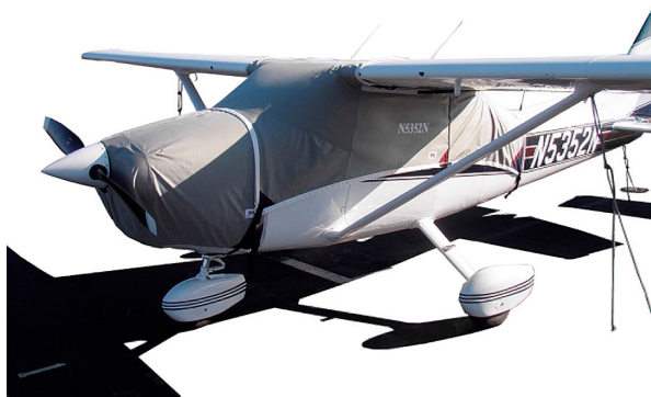
Cessna 182 Over-the-Top Canopy Cover and Engine Cover