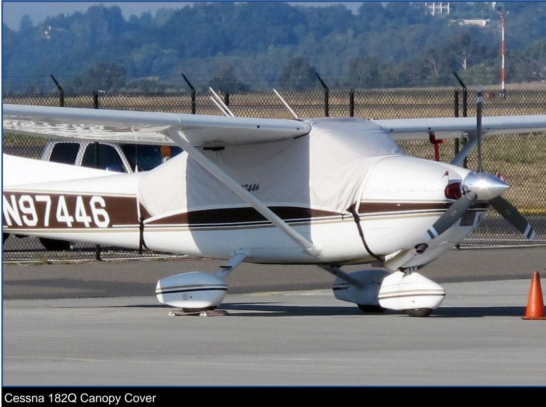
Cessna 182Q Canopy Cover