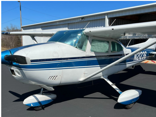
Cessna 182 Cockpit HeatShield Set

Windshield Heatshields are interior sunshades for an aircraft's front windshield. The product is a unique composite of closed-cell foam with a silver mylar finish. The semi-rigid design is stiff enough to stand along the inside of the windshield using sun visors or window framing. It folds up flat and easily stores in the included storage sleeve. Some designs may require velcro and suction cups or split right and left sides. A Heatshield is an excellent short-term remedy for cockpit overheating. An external fabric cover is far more effective and practical for long-term protection.