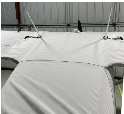
Cessna 182T Canopy Cover, Over Top Type