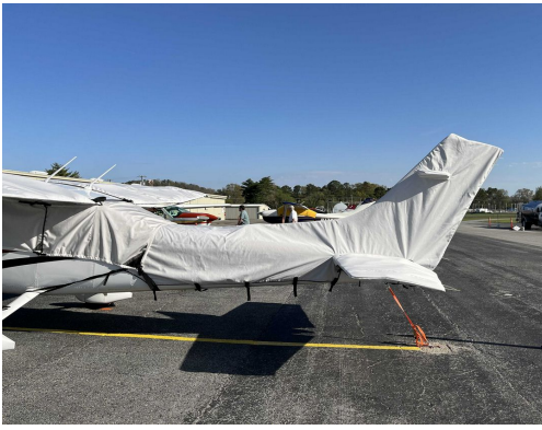
Cessna T182T Hail Protection Covers