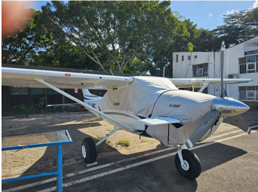
Cessna 0182P Canopy & Engine Covers

This cover type is made from Silver Acrylic Sunbrella canvas and is 100% lined with a soft and smooth microfiber. Bruce's Custom Covers developed this material combination especially for aircraft protection. The outer material is medium weight and treated for water resistance, UV resistance and anti-static buildup. The inner lining is a very soft and smooth microfiber to prevent scratching. The material is very reflective, and tests show that the cabin interior temperature can be reduced to near-ambient temperature on the hottest of days. It is water, ice and snow repellent, yet breathable to allow moisture to escape from between the cover and the aircraft surface.