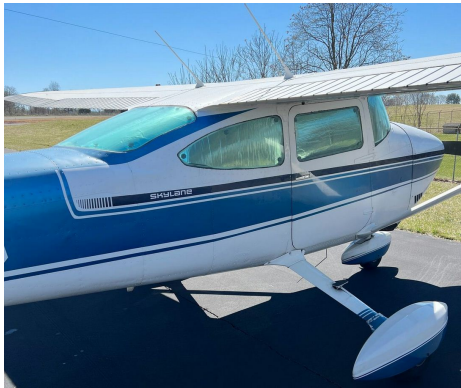
Cessna 182 Cockpit HeatShield Set