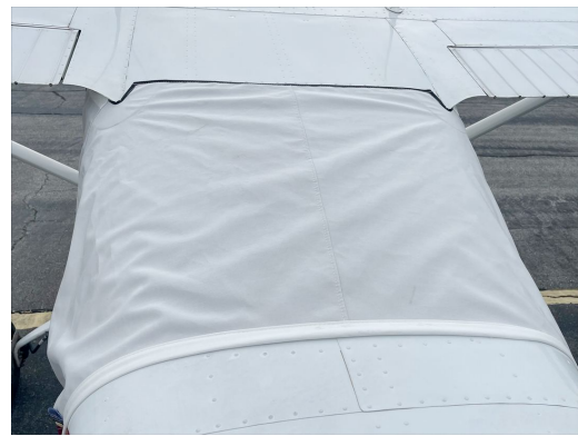
Cessna 182L Wrap Around Canopy Cover