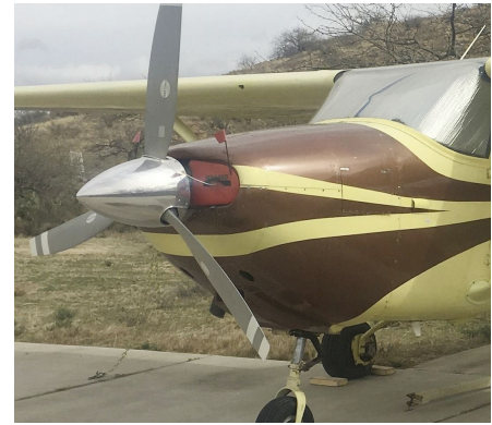
Cessna 182A Engine Inlet Plugs