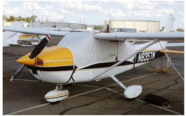
Cessna 182 Over-Top Canopy Cover, Fully Enclosed Engine Cover