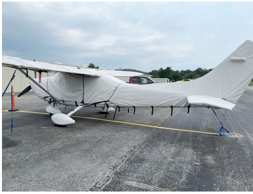
Cessna 182 Hail Protection Cover Set