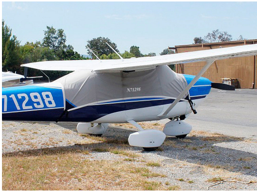
Cessna 182 Canopy Cover (This is Bruce's plane!)