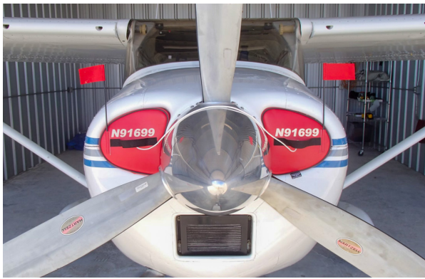
Cessna 182M Engine Inlet Plugs

Engine Inlet Plugs are custom fit for your Cessna 182 Skylane intakes, made with heavy-duty vinyl material, and stuffed with a single block of sculpted urethane foam. Each plug has a zipper that allows the foam to be removed and dried if necessary. Engine plugs have warning flags that are visible from the cockpit or 'remove before flight' streamers sewn onto the face of the plugs. Most plugs are imprinted with the aircraft registration number in black for an extra charge. Storage bag NOT included. Engine plugs may be inserted after flight when the engine is still warm. Engine Inlet Plugs are commonly referred to as Cowl Plugs, Intake Plugs, Cowl Blocks, Engine Blocks, and Engine Bungs.