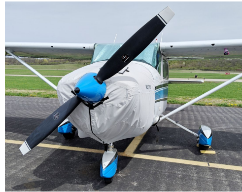
Cessna 182P Engine Cover (fully enclosed)