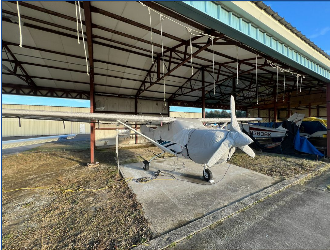
Cessna R182 Canopy, Engine, Wings, Empennage Covers