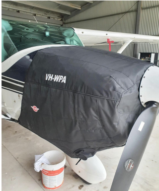
Cessna 182 Insulated Engine Cover, fully enclosed