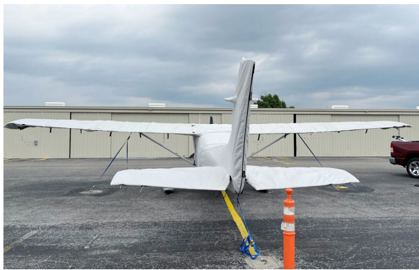
Cessna 182 Hail Protection Cover Set