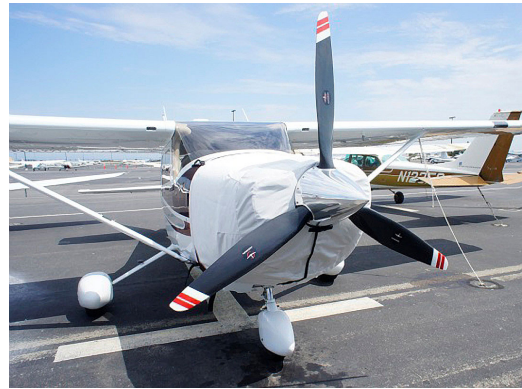
Cessna 182 Engine Cover