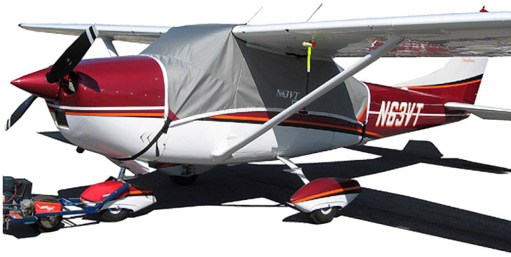
Cessna 182 Skylane Canopy Cover (P/N: 182-000)