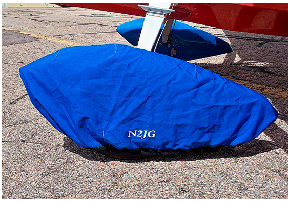
Bellanca Citabria Wheelpant Cover