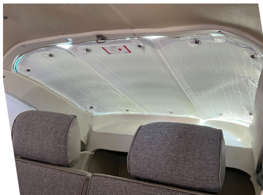
Cessna 182 Cockpit HeatShield Set

Windshield Heatshields are interior sunshades for an aircraft's front windshield. The product is a unique composite of closed-cell foam with a silver mylar finish. The semi-rigid design is stiff enough to stand along the inside of the windshield using sun visors or window framing. It folds up flat and easily stores in the included storage sleeve. Some designs may require velcro and suction cups or split right and left sides. A Heatshield is an excellent short-term remedy for cockpit overheating. An external fabric cover is far more effective and practical for long-term protection.