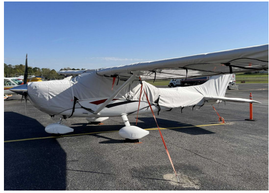
Cessna T182T Hail Protection Covers