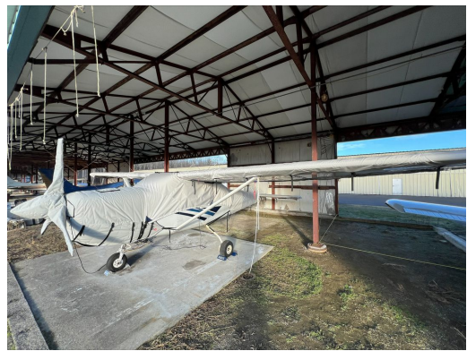
Cessna R182 Canopy, Engine, Wings, Empennage Covers