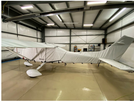
182 Skylane T182T Extended Canopy Cover

This cover type is made from Silver Acrylic Sunbrella canvas and is 100% lined with a soft and smooth microfiber. Bruce's Custom Covers developed this material combination especially for aircraft protection. The outer material is medium weight and treated for water resistance, UV resistance and anti-static buildup. The inner lining is a very soft and smooth microfiber to prevent scratching. The material is very reflective, and tests show that the cabin interior temperature can be reduced to near-ambient temperature on the hottest of days. It is water, ice and snow repellent, yet breathable to allow moisture to escape from between the cover and the aircraft surface.