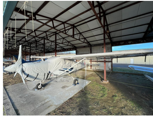
Cessna R182 Canopy, Engine, Wings, Empennage Covers