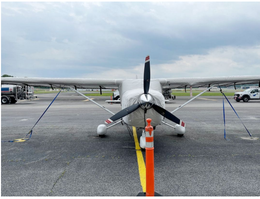
Cessna 182 Hail Protection Cover Set