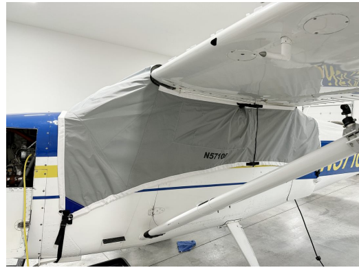
Cessna 182 Light Weight Wrap Around Canopy Cover