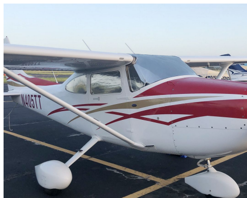
Cessna 182 Cabin HeatShields