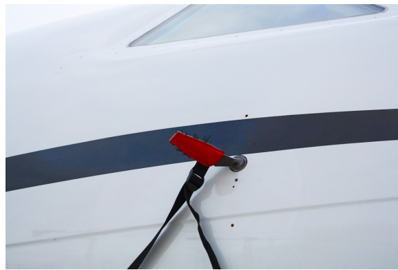
Falcon Jet 2000 Pitot Covers, Aoa's, Tat Cover Set, Heat Resistant Type