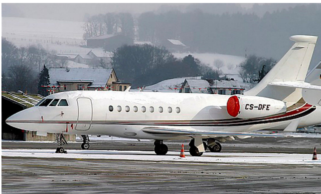
Engine Intake Cover Set, Pitot Cover Set

The Falcon Jet 2000 Intake Covers are designed to install easily yet be completely storable. A spring steel hoop is sewn into the hem of each cover, allowing them to be installed without climbing onto the wing or using a stepladder. To store the covers the spring steel hoop folds like a band-saw blade into three nesting rings. Each cover folds into a compact circular bundle which is stored in the included duffle bag, yet they unfold quickly for use. The Tri-Fold Ring cover is made of medium weight nylon which is available in a variety of colors to match the paint trim. Each cover set comes complete with installation and folding instructions. The aircraft's registration number can be silkscreened onto the cover for an extra charge.