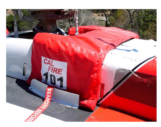
Bell 204 Intake Cover