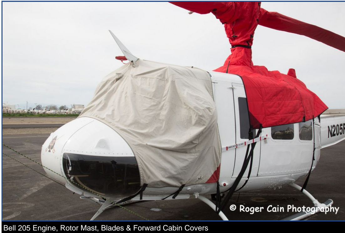
Bell 205 Engine, Rotor Mast, Blades & Forward Cabin Covers