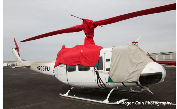
Bell 205 Engine, Rotor Mast, Blades & Forward Cabin Covers