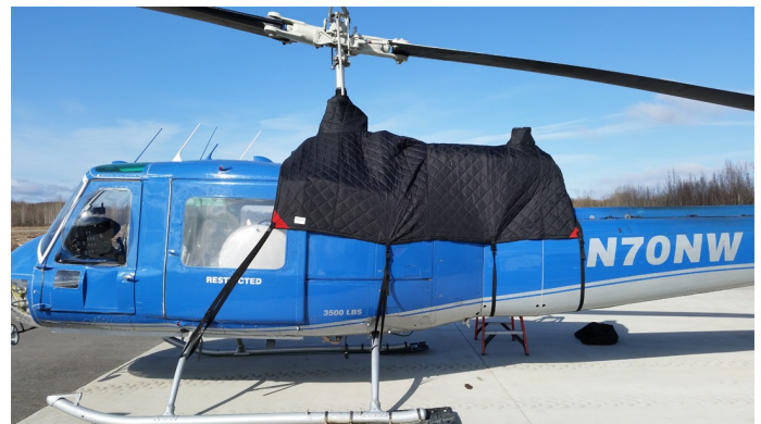
Bell 204 Insulated Engine Area Cover