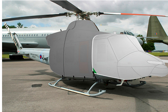
Forward Cabin Nose & Mid-Cabin/Engine Cover (extended to cross tubes)

This cover type is made from Silver Acrylic Sunbrella canvas and is 100% lined with a soft and smooth microfiber. Bruce's Custom Covers developed this material combination especially for aircraft protection. The outer material is medium weight and treated for water resistance, UV resistance and anti-static buildup. The inner lining is a very soft and smooth microfiber to prevent scratching. The material is very reflective, and tests show that the cabin interior temperature can be reduced to near-ambient temperature on the hottest of days. It is water, ice and snow repellent, yet breathable to allow moisture to escape from between the cover and the aircraft surface.