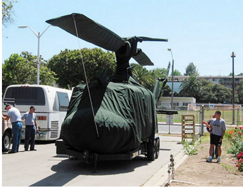
Bell 204/205 Full Body Cover Set

This cover type is made from Silver Acrylic Sunbrella canvas and is 100% lined with a soft and smooth microfiber. Bruce's Custom Covers developed this material combination especially for aircraft protection. The outer material is medium weight and treated for water resistance, UV resistance and anti-static buildup. The inner lining is a very soft and smooth microfiber to prevent scratching. The material is very reflective, and tests show that the cabin interior temperature can be reduced to near-ambient temperature on the hottest of days. It is water, ice and snow repellent, yet breathable to allow moisture to escape from between the cover and the aircraft surface.