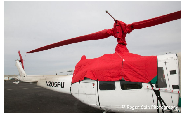
Bell 205 Engine, Rotor Mast & Blades Covers