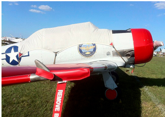
T6 Pitot, Canopy & Prop Covers

The Engine Inlet Plugs are custom fit for your Bell 205 intakes, made with heavy-duty vinyl material, and stuffed with a single block of sculpted urethane foam. Each plug has a zipper that allows the foam to be removed and dried if necessary. Engine plugs have 'Remove Before Flight' streamers sewn onto the face of the plugs. Most plugs are imprinted with the aircraft registration number in black for an extra charge. Storage bag NOT included. Engine plugs may be inserted after flight when the engine is still warm. Engine Inlet Plugs are commonly referred to as Cowl Plugs, Intake Plugs, Cowl Blocks, Engine Blocks, and Engine Bungs.