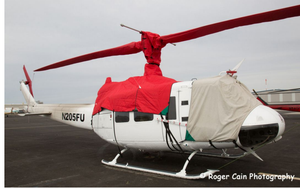
Bell 205 Engine, Rotor Mast, Blades & Forward Cabin Covers