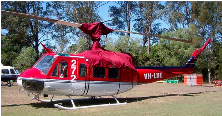
Bell 204/205 Engine/Mid-Cabin Cover, Main & Tail Rotor Covers

WINTER USE MATERIAL - Made with Solution-Dyed Polyester fabric, this option is intended for seasonal use to aid in deicing, rain mitigation, or for occasional travel. The material is lighter and more compact, but more susceptible to UV damage and may have a shorter useful life if used continuously outside than the all-year use material.