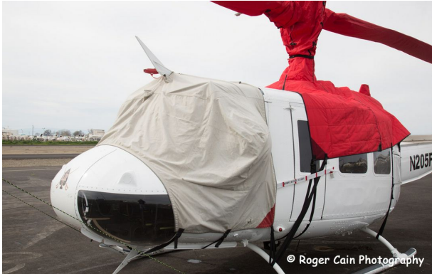
Bell 205 Engine, Rotor Mast, Blades & Forward Cabin Covers

This cover type is made from Silver Acrylic Sunbrella canvas and is 100% lined with a soft and smooth microfiber. Bruce's Custom Covers developed this material combination especially for aircraft protection. The outer material is medium weight and treated for water resistance, UV resistance and anti-static buildup. The inner lining is a very soft and smooth microfiber to prevent scratching. The material is very reflective, and tests show that the cabin interior temperature can be reduced to near-ambient temperature on the hottest of days. It is water, ice and snow repellent, yet breathable to allow moisture to escape from between the cover and the aircraft surface.