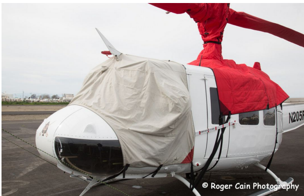
Bell 205 Engine, Rotor Mast, Blades & Forward Cabin Covers

WINTER USE MATERIAL - Made with Solution-Dyed Polyester fabric, this option is intended for seasonal use to aid in deicing, rain mitigation, or for occasional travel. The material is lighter and more compact, but more susceptible to UV damage and may have a shorter useful life if used continuously outside than the all-year use material.