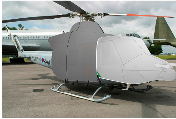
Forward Cabin Nose & Mid-Cabin/Engine Cover (extended to cross tubes)

the hottest of days. It is water, ice and snow repellent, yet breathable to allow moisture to escape from between the cover and the aircraft surface.