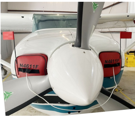
Cessna P206A Engine Plugs