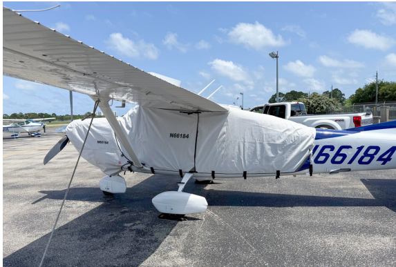
Cessna T206H Extended Canopy Cover, Over Top Type

This cover type is made from Silver Acrylic Sunbrella canvas and is 100% lined with a soft and smooth microfiber. Bruce's Custom Covers developed this material combination especially for aircraft protection. The outer material is medium weight and treated for water resistance, UV resistance and anti-static buildup. The inner lining is a very soft and smooth microfiber to prevent scratching. The material is very reflective, and tests show that the cabin interior temperature can be reduced to near-ambient temperature on the hottest of days. It is water, ice and snow repellent, yet breathable to allow moisture to escape from between the cover and the aircraft surface.