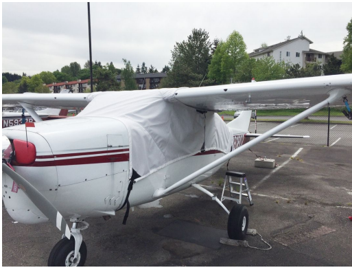
Cessna 205 Over-Top Canopy Cover