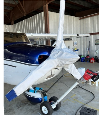
Cessna 182 Skylane 3-Blade Prop Cover