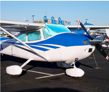
Cessna 182 HeatShield Set

Windshield Heatshields are interior sunshades for an aircraft's front windshield. The product is a unique composite of closed-cell foam with a silver mylar finish. The semi-rigid design is stiff enough to stand along the inside of the windshield using sun visors or window framing. It folds up flat and easily stores in the included storage sleeve. Some designs may require velcro and suction cups or split right and left sides. A Heatshield is an excellent short-term remedy for cockpit overheating. An external fabric cover is far more effective and practical for long-term protection.