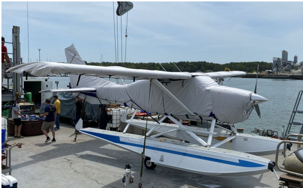
Cessna U206F Amphib Cover Set

WINTER USE MATERIAL - Made with Solution-Dyed Polyester fabric, this option is intended for seasonal use to aid in deicing, rain mitigation, or for occasional travel. The material is lighter and more compact, but more susceptible to UV damage and may have a shorter useful life if used continuously outside than the all-year use material.