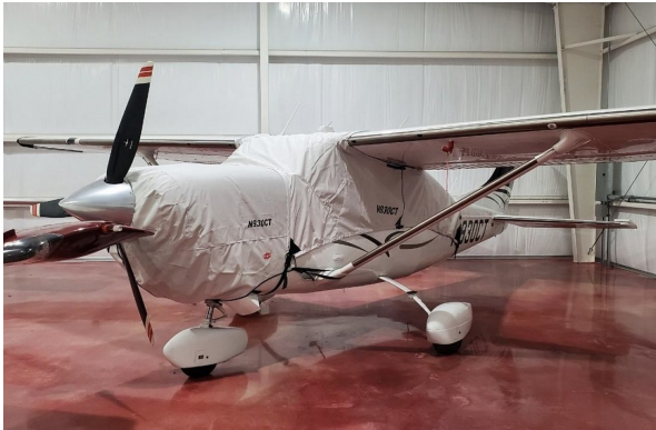
Textron Aviation Inc T206H Canopy cover over the top