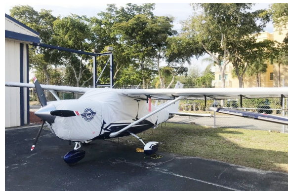
Cessna T206H Canopy, Engine, Wing & Empennage Covers