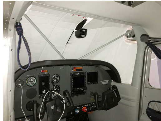
Cessna 180 Skywagon Windshield Heatshield, (W/ Compass)