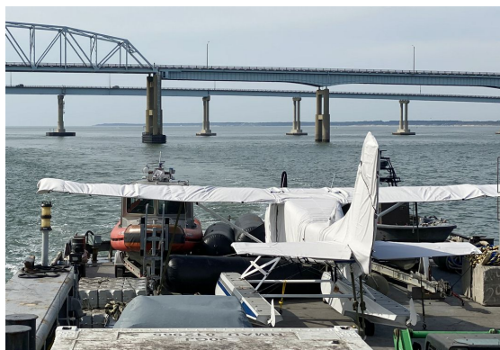
Cessna U206F Amphib Cover Set