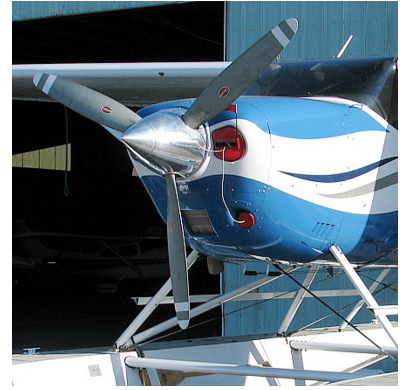
Cessna T206H Engine Inlet Plugs