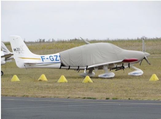
Cirrus SR-22 Extended Canopy/Engine Cover, Prop Cover, Wingtip Pads

Designed to prevent damage to the aircraft extremities in crowded hangars, these products are made of bright red Naugahyde and thickly padded with a sandwich of closed cell foam.