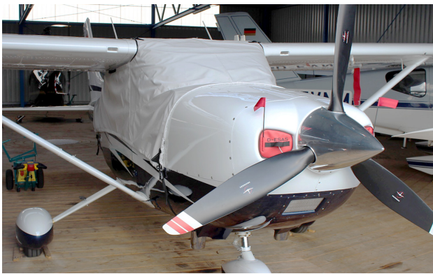
Cessna 206 Stationair Engine Inlet Plugs (206h - '98 & Up, W/Oil Cooler Inlet Plug)

be inserted after flight when the engine is still warm. Engine Inlet Plugs are commonly referred to as Cowl Plugs , Intake Plugs , Cowl Blocks , Engine Blocks , and Engine Bungs .