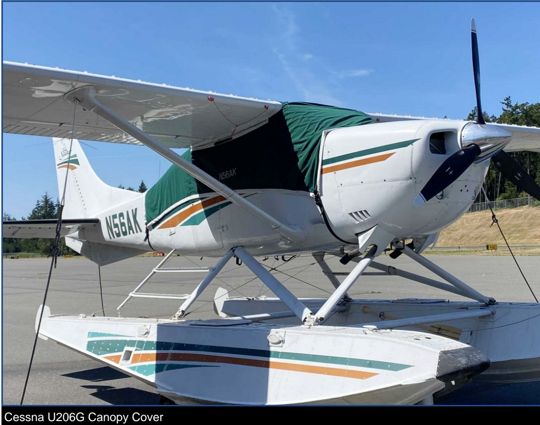
Cessna U206G Canopy Cover