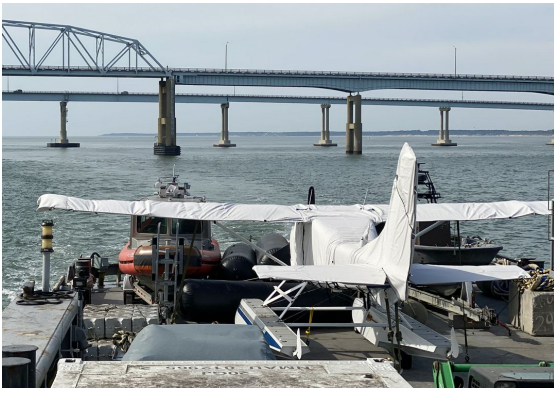
Cessna U206F Amphib Cover Set