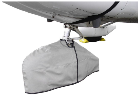
Cessna 172 Nose Gear Fairing Cover