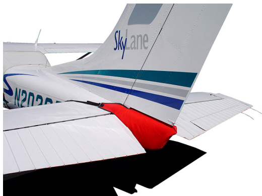
Cessna 182 Tailcone Cover

WINTER USE MATERIAL - Made with Solution-Dyed Polyester fabric, this option is intended for seasonal use to aid in deicing, rain mitigation, or for occasional travel. The material is lighter and more compact, but more susceptible to UV damage and may have a shorter useful life if used continuously outside than the all-year use material.