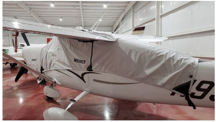
Cessna T206H Over-Top Canopy Cover, Engine Cover