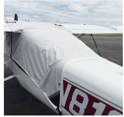
Cessna 205 Over-Top Canopy Cover