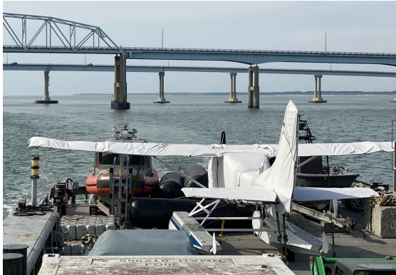
Cessna U206F Amphib Cover Set

This cover type is made from Silver Acrylic Sunbrella canvas and is 100% lined with a soft and smooth microfiber. Bruce's Custom Covers developed this material combination especially for aircraft protection. The outer material is medium weight and treated for water resistance, UV resistance and anti-static buildup. The inner lining is a very soft and smooth microfiber to prevent scratching. The material is very reflective, and tests show that the cabin interior temperature can be reduced to near-ambient temperature on the hottest of days. It is water, ice and snow repellent, yet breathable to allow moisture to escape from between the cover and the aircraft surface.