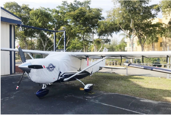
Cessna T206H Canopy, Engine, Wing & Empennage Covers