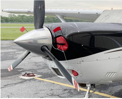
Cessna 206 Engine Inlet Plugs