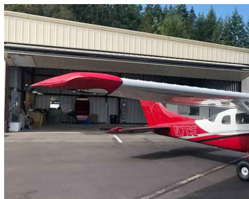
Cessna 206 Wingtip Pads