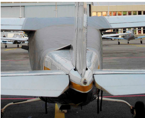
Cessna 210 Over-the-Top Canopy Cover

Travel Covers are made with Silver Solution-Dyed Polyester fabric and only lined over the windshield to save weight. The material is lightweight and more compact for easy stowage in the aircraft. The polyester material is water resistant, but only intended for occasional use outside. We also have an ultra lightweight material available for fitted hangar dust covers. For daily outdoor use, the non-travel Sunbrella Cover is the best choice.