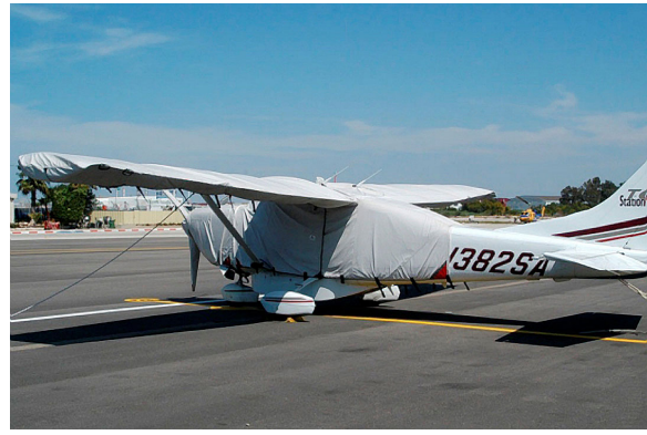
Cessna 206 Extended Canopy, Engine, Wing & Prop Covers