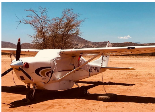
Cessna 206 Canopy Cover

This cover type is made from Silver Acrylic Sunbrella canvas and is 100% lined with a soft and smooth microfiber. Bruce's Custom Covers developed this material combination especially for aircraft protection. The outer material is medium weight and treated for water resistance, UV resistance and anti-static buildup. The inner lining is a very soft and smooth microfiber to prevent scratching. The material is very reflective, and tests show that the cabin interior temperature can be reduced to near-ambient temperature on the hottest of days. It is water, ice and snow repellent, yet breathable to allow moisture to escape from between the cover and the aircraft surface.