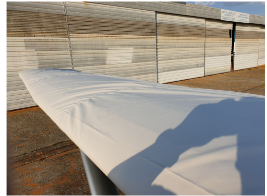
Cessna 207 Wing Covers