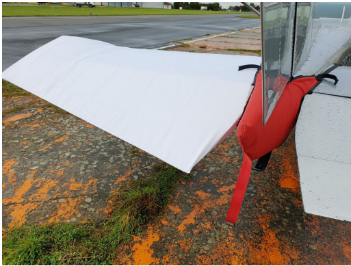
Cessna 207 Tailcone Cover, Horizontal Stab. Cover (test fit)

WINTER USE MATERIAL - Made with Solution-Dyed Polyester fabric, this option is intended for seasonal use to aid in deicing, rain mitigation, or for occasional travel. The material is lighter and more compact, but more susceptible to UV damage and may have a shorter useful life if used continuously outside than the all-year use material.