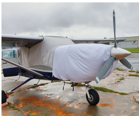
Cessna 207 Engine Cover (test fit)

This cover type is made from Silver Acrylic Sunbrella canvas and is 100% lined with a soft and smooth microfiber. Bruce's Custom Covers developed this material combination especially for aircraft protection. The outer material is medium weight and treated for water resistance, UV resistance and anti-static buildup. The inner lining is a very soft and smooth microfiber to prevent scratching. The material is very reflective, and tests show that the cabin interior temperature can be reduced to near-ambient temperature on the hottest of days. It is water, ice and snow repellent, yet breathable to allow moisture to escape from between the cover and the aircraft surface.