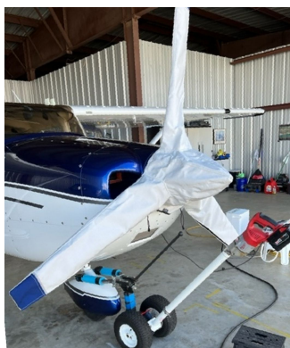
Cessna 182 Skylane 3-Blade Prop Cover