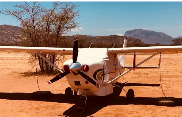
Cessna 206 Canopy Cover

This cover type is made from Silver Acrylic Sunbrella canvas and is 100% lined with a soft and smooth microfiber. Bruce's Custom Covers developed this material combination especially for aircraft protection. The outer material is medium weight and treated for water resistance, UV resistance and anti-static buildup. The inner lining is a very soft and smooth microfiber to prevent scratching. The material is very reflective, and tests show that the cabin interior temperature can be reduced to near-ambient temperature on the hottest of days. It is water, ice and snow repellent, yet breathable to allow moisture to escape from between the cover and the aircraft surface.