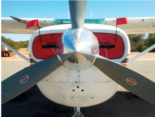
Cessna 207 Engine Inlet Plugs

Engine Inlet Plugs are custom fit for your Cessna 207/208 Stationair 7, 8 intakes, made with heavy-duty vinyl material, and stuffed with a single block of sculpted urethane foam. Each plug has a zipper that allows the foam to be removed and dried if necessary. Engine plugs have warning flags that are visible from the cockpit or 'remove before flight' streamers sewn onto the face of the plugs. Most plugs are imprinted with the aircraft registration number in black for an extra charge. Storage bag NOT included. Engine plugs may be inserted after flight when the engine is still warm. Engine Inlet Plugs are commonly referred to as Cowl Plugs, Intake Plugs, Cowl Blocks, Engine Blocks, and Engine Bung.