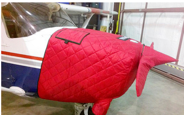
Cessna 172 Insulated Engine Cover w/ Oil Filler Door flap and Insulated Prop/Spinner Cover

This cover type is made from Silver Acrylic Sunbrella canvas and is 100% lined with a soft and smooth microfiber. Bruce's Custom Covers developed this material combination especially for aircraft protection. The outer material is medium weight and treated for water resistance, UV resistance and anti-static buildup. The inner lining is a very soft and smooth microfiber to prevent scratching. The material is very reflective, and tests show that the cabin interior temperature can be reduced to near-ambient temperature on the hottest of days. It is water, ice and snow repellent, yet breathable to allow moisture to escape from between the cover and the aircraft surface.