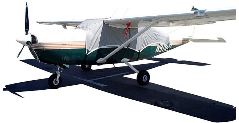
Cessna 207 Canopy Cover