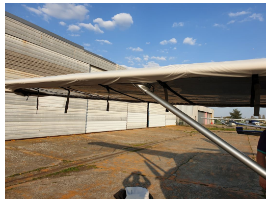
Cessna 207 Wing Covers