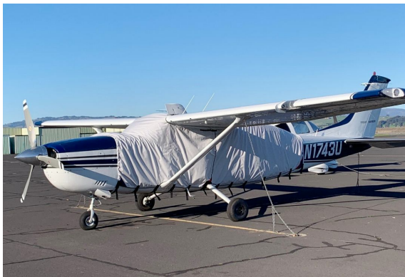
Cessna T207 Extended Canopy Cover

This cover type is made from Silver Acrylic Sunbrella canvas and is 100% lined with a soft and smooth microfiber. Bruce's Custom Covers developed this material combination especially for aircraft protection. The outer material is medium weight and treated for water resistance, UV resistance and anti-static buildup. The inner lining is a very soft and smooth microfiber to prevent scratching. The material is very reflective, and tests show that the cabin interior temperature can be reduced to near-ambient temperature on the hottest of days. It is water, ice and snow repellent, yet breathable to allow moisture to escape from between the cover and the aircraft surface.