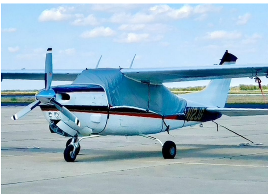
Cessna 210 Canopy Cover, Extends to Cover Baggage Door

Travel Covers are made with Silver Solution-Dyed Polyester fabric and only lined over the windshield to save weight. The material is lightweight and more compact for easy stowage in the aircraft. The polyester material is water resistant, but only intended for occasional use outside. We also have an ultra lightweight material available for fitted hangar dust covers. For daily outdoor use, the non-travel Sunbrella Cover is the best choice.