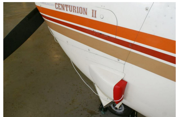
Cessna 210 Engine Plugs