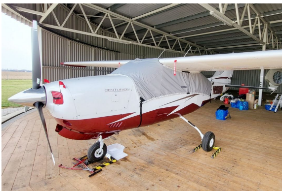
Cessna 210K Travel Cover, Light Weight Canopy Cover Wrap-Around Type

Travel Covers are made with Silver Solution-Dyed Polyester fabric and only lined over the windshield to save weight. The material is lightweight and more compact for easy stowage in the aircraft. The polyester material is water resistant, but only intended for occasional use outside. We also have an ultra lightweight material available for fitted hangar dust covers. For daily outdoor use, the non-travel Sunbrella Cover is the best choice.