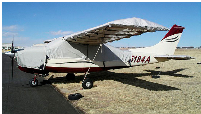
Cessna 210 Engine, Canopy Cover w/ Baggage Door ext. & Wing Covers