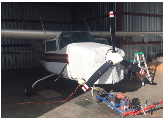
Insulated Hangar Blanket on Cessna 210

This cover type is made from Silver Acrylic Sunbrella canvas and is 100% lined with a soft and smooth microfiber. Bruce's Custom Covers developed this material combination especially for aircraft protection. The outer material is medium weight and treated for water resistance, UV resistance and anti-static buildup. The inner lining is a very soft and smooth microfiber to prevent scratching. The material is very reflective, and tests show that the cabin interior temperature can be reduced to near-ambient temperature on the hottest of days. It is water, ice and snow repellent, yet breathable to allow moisture to escape from between the cover and the aircraft surface.