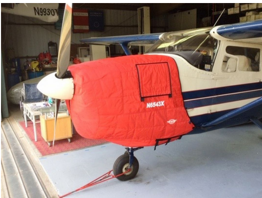
Cessna 210 Insulated Engine Cover

This cover type is made from Silver Acrylic Sunbrella canvas and is 100% lined with a soft and smooth microfiber. Bruce's Custom Covers developed this material combination especially for aircraft protection. The outer material is medium weight and treated for water resistance, UV resistance and anti-static buildup. The inner lining is a very soft and smooth microfiber to prevent scratching. The material is very reflective, and tests show that the cabin interior temperature can be reduced to near-ambient temperature on the hottest of days. It is water, ice and snow repellent, yet breathable to allow moisture to escape from between the cover and the aircraft surface.