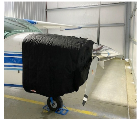
FOR INTERIOR USE. Cessna 210 Insulated Hangar Blanket, available in Red or Silver Cessna T210L Insulated Engine Cover