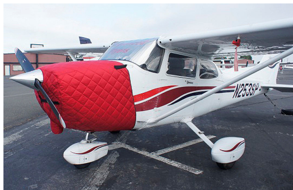
Cessna 172 Insulated Engine Cover, fully enclosed