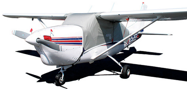
Cessna 210 Over-Top Canopy Cover