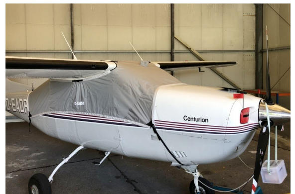
Cessna 210 Travel Weight Canopy Cover