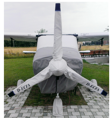
Cessna 210 Prop Cover