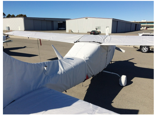
Cessna 210 Full Cover Set