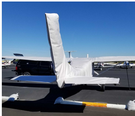
Cessna 210B Empennage Cover

WINTER USE MATERIAL - Made with Solution-Dyed Polyester fabric, this option is intended for seasonal use to aid in deicing, rain mitigation, or for occasional travel. The material is lighter and more compact, but more susceptible to UV damage and may have a shorter useful life if used continuously outside than the all-year use material.