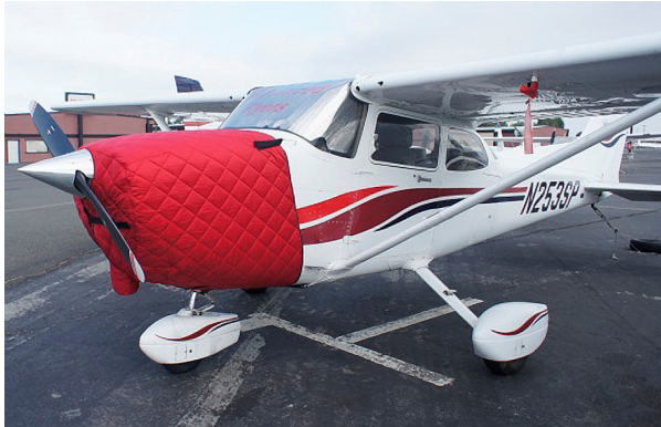
Cessna 172 Insulated Engine Cover, fully enclosed

Windshield Heatshields are interior sunshades for an aircraft's front windshield. The product is a unique composite of closed-cell foam with a silver mylar finish. The semi-rigid design is stiff enough to stand along the inside of the windshield using sun visors or window framing. It folds up flat and easily stores in the included storage sleeve. Some designs may require velcro and suction cups or split right and left sides. A Heatshield is an excellent short-term remedy for cockpit overheating. An external fabric cover is far more effective and practical for long-term protection.