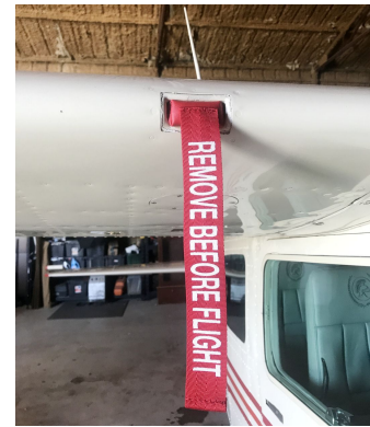
Cessna 210 Centurion Wing Root Vent Plugs