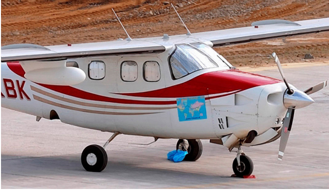
Cessna P210 HeatShield Set

Windshield Heatshields are interior sunshades for an aircraft's front windshield. The product is a unique composite of closed-cell foam with a silver mylar finish. The semi-rigid design is stiff enough to stand along the inside of the windshield using sun visors or window framing. It folds up flat and easily stores in the included storage sleeve. Some designs may require velcro and suction cups or split right and left sides. A Heatshield is an excellent short-term remedy for cockpit overheating. An external fabric cover is far more effective and practical for long-term protection.