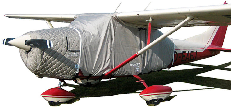
Cessna 206 Wrap-Around Canopy Cover Cessna 182 Insulated Engine Cover ext. to l.e of nose gear, Extended Canopy Cover