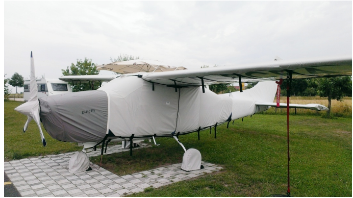
Cessna 210 Complete Cover Set