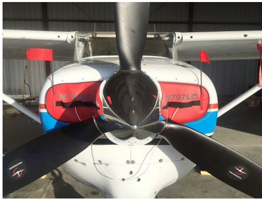
Cessna 210 Inlet Plugs, early model

Engine Inlet Plugs are custom fit for your Cessna 210 Centurion intakes, made with heavy-duty vinyl material, and stuffed with a single block of sculpted urethane foam. Each plug has a zipper that allows the foam to be removed and dried if necessary. Engine plugs have warning flags that are visible from the cockpit or 'remove before flight' streamers sewn onto the face of the plugs. Most plugs are imprinted with the aircraft registration number in black for an extra charge. Storage bag NOT included. Engine plugs may be inserted after flight when the engine is still warm. Engine Inlet Plugs are commonly referred to as Cowl Plugs, Intake Plugs, Cowl Blocks, Engine Blocks, and Engine Bungs.