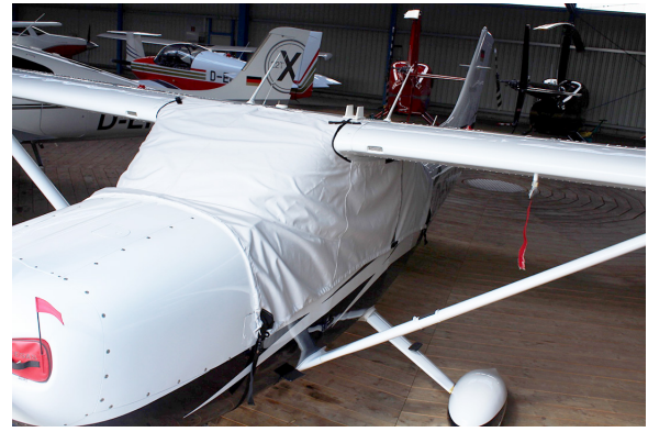
Cessna 206 Stationair Canopy Cover, Wrap-Around