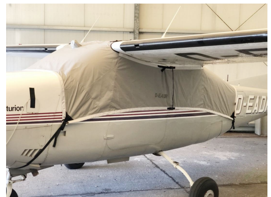
Cessna 210 Travel Weight Canopy Cover