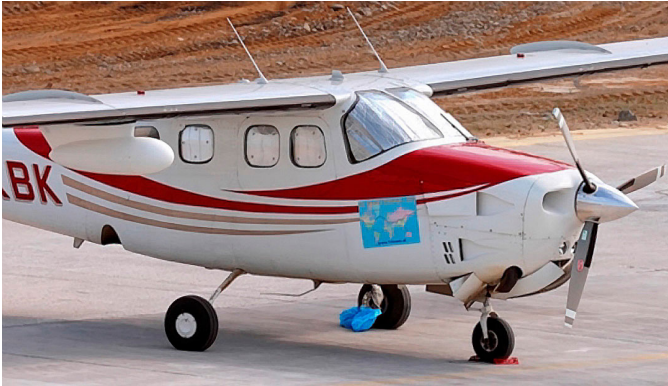
Cessna P210 HeatShield Set

Windshield Heatshields are interior sunshades for an aircraft's front windshield. The product is a unique composite of closed-cell foam with a silver mylar finish. The semi-rigid design is stiff enough to stand along the inside of the windshield using sun visors or window framing. It folds up flat and easily stores in the included storage sleeve. Some designs may require velcro and suction cups or split right and left sides. A Heatshield is an excellent short-term remedy for cockpit overheating. An external fabric cover is far more effective and practical for long-term protection.