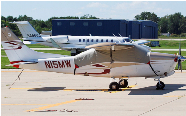
Cessna 210 Canopy Cover, Engine Plugs, Tailcone Cover

Engine Inlet Plugs are custom fit for your Cessna 210 Centurion intakes, made with heavy-duty vinyl material, and stuffed with a single block of sculpted urethane foam. Each plug has a zipper that allows the foam to be removed and dried if necessary. Engine plugs have warning flags that are visible from the cockpit or 'remove before flight' streamers sewn onto the face of the plugs. Most plugs are imprinted with the aircraft registration number in black for an extra charge. Storage bag NOT included. Engine plugs may be inserted after flight when the engine is still warm. Engine Inlet Plugs are commonly referred to as Cowl Plugs, Intake Plugs, Cowl Blocks, Engine Blocks, and Engine Bungs.