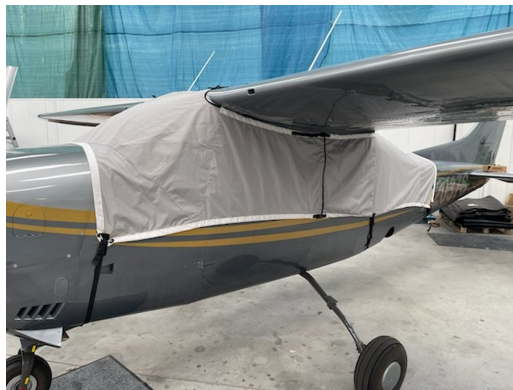
Cessna 210 Travel Cover Canopy Cover, Wrap-Around, Ext. To Cover Baggage Door

Travel Covers are made with Silver Solution-Dyed Polyester fabric and only lined over the windshield to save weight. The material is lightweight and more compact for easy stowage in the aircraft. The polyester material is water resistant, but only intended for occasional use outside. We also have an ultra lightweight material available for fitted hangar dust covers. For daily outdoor use, the non-travel Sunbrella Cover is the best choice.