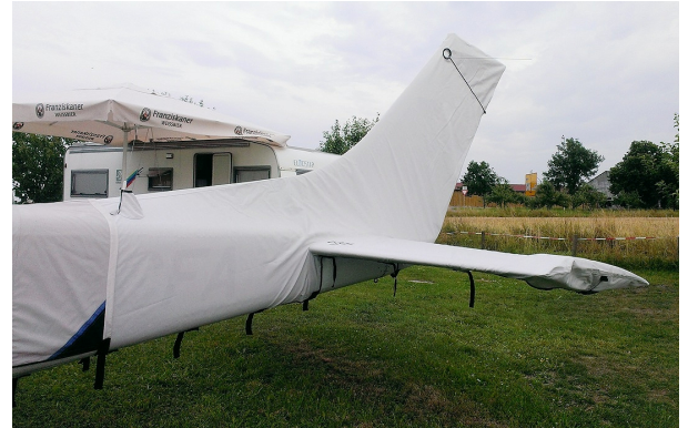
Cessna 210 Empennage Cover