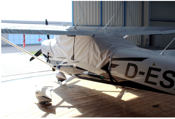
Cessna 206 Stationair Canopy Cover, Wrap-Around