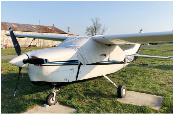
Cessna 210 Over-Top Canopy Cover