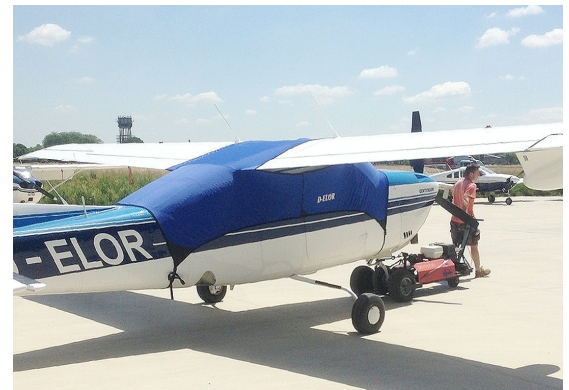
Cessna 210 Over-Top Canopy Cover