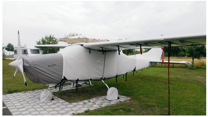
Cessna 210 Complete Cover Set