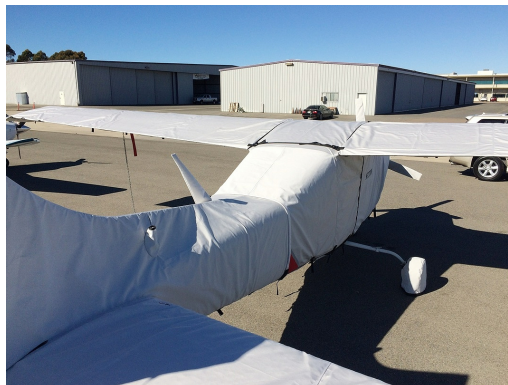
Cessna 210 Full Cover Set