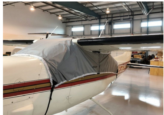
Cessna P210N Wrap Around Travel Cover