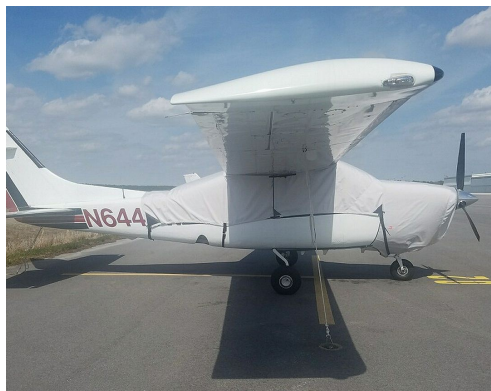
Cessna 210 Over-Top Canopy Cover, Fully Enclosed Engine Cover

This cover type is made from Silver Acrylic Sunbrella canvas and is 100% lined with a soft and smooth microfiber. Bruce's Custom Covers developed this material combination especially for aircraft protection. The outer material is medium weight and treated for water resistance, UV resistance and anti-static buildup. The inner lining is a very soft and smooth microfiber to prevent scratching. The material is very reflective, and tests show that the cabin interior temperature can be reduced to near-ambient temperature on the hottest of days. It is water, ice and snow repellent, yet breathable to allow moisture to escape from between the cover and the aircraft surface.