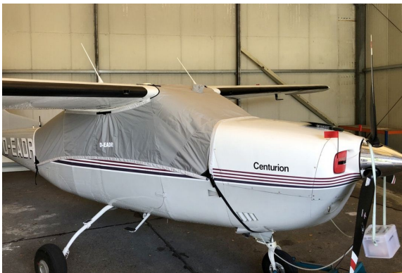
Cessna 210 Travel Weight Canopy Cover

Travel Covers are made with Silver Solution-Dyed Polyester fabric and only lined over the windshield to save weight. The material is lightweight and more compact for easy stowage in the aircraft. The polyester material is water resistant, but only intended for occasional use outside. We also have an ultra lightweight material available for fitted hangar dust covers. For daily outdoor use, the non-travel Sunbrella Cover is the best choice.