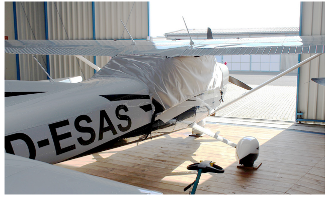
Cessna 206 Stationair Canopy Cover, Wrap-Around