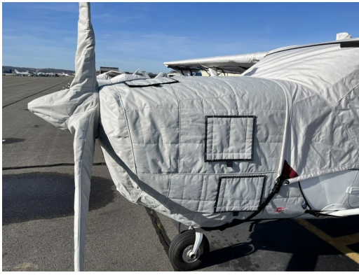
Cessna 210 Winter Cover Set