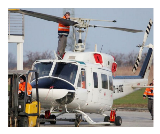
Bell 212 Main and Oil Cooler Intake Plugs

The Engine Inlet Plugs are custom fit for your Bell 214ST intakes, made with heavy-duty vinyl material, and stuffed with a single block of sculpted urethane foam. Each plug has a zipper that allows the foam to be removed and dried if necessary. Engine plugs have 'Remove Before Flight' streamers sewn onto the face of the plugs. Most plugs are imprinted with the aircraft registration number in black for an extra charge. Storage bag NOT included. Engine plugs may be inserted after flight when the engine is still warm. Engine Inlet Plugs are commonly referred to as Cowl Plugs, Intake Plugs, Cowl Blocks, Engine Blocks, and Engine Bungs.