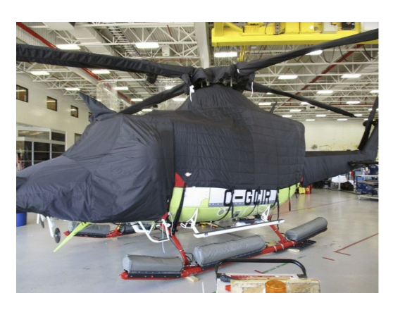
Bell 412 Cockpit/Canopy/Nose, Insulated Engine Area, Rotor Hub, Blade, Tailboom and Tail Rotor Coversroto