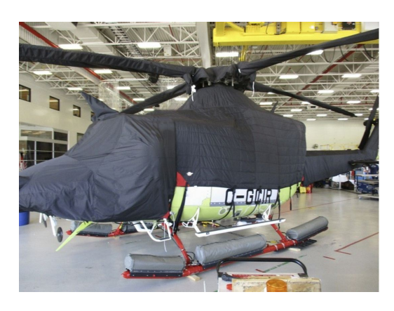
Bell 412 Cockpit/Canopy/Nose, Insulated Engine Area, Rotor Hub, Blade, Tailboom and Tail Rotor Coversroto