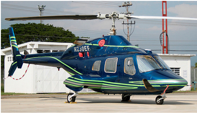
Bell 230 Engine Plugs, HeatShields