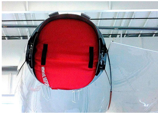
Falcon 2000EX Exhaust Plug

The Engine Inlet Plugs are custom fit for your Falcon Jet 2000EX, 2000LXS intakes, made with heavy-duty vinyl material, and stuffed with a single block of sculpted urethane foam. Each plug has a zipper that allows the foam to be removed and dried if necessary. Engine plugs have 'remove before flight' streamers sewn onto the face of the plugs. Most plugs are imprinted with the aircraft registration number in black for an extra charge. Storage bag NOT included. Engine plugs may be inserted after flight when the engine is still warm. Engine Inlet Plugs are commonly referred to as Cowl Plugs, Intake Plugs, Cowl Blocks, Engine Blocks, and Engine Bungs.