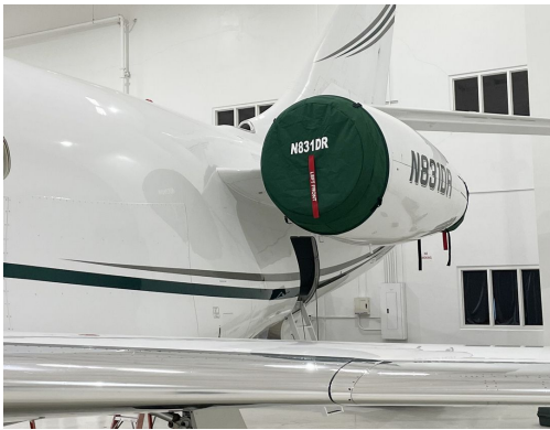
Falcon 200EX Engine Covers

The Falcon Jet 2000EX, 2000LXS Intake Covers are designed to install easily yet be completely storable. A spring steel hoop is sewn into the hem of each cover, allowing them to be installed without climbing onto the wing or using a stepladder. To store the covers the spring steel hoop folds like a band-saw blade into three nesting rings. Each cover folds into a compact circular bundle which is stored in the included duffle bag, yet they unfold quickly for use. The Tri-Fold Ring cover is made of medium weight nylon which is available in a variety of colors to match the paint trim. Each cover set comes complete with installation and folding instructions. The aircraft's registration number can be silkscreened onto the cover for an extra charge.