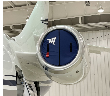
Falcon Jet Engine Inlet Plugs Folding Type