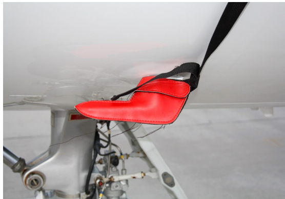
Falcon Jet 2000EX, 2000LXS Pitot Covers, Aoa's, Tat Cover Set, Heat Resistant Type