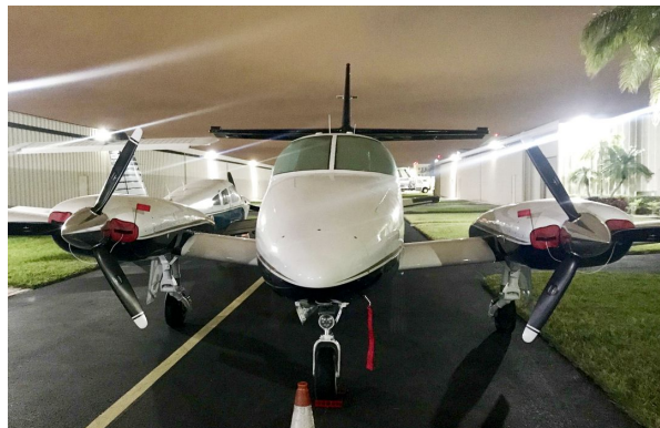
Cessna T303 Crusader Engine Inlet Plugs