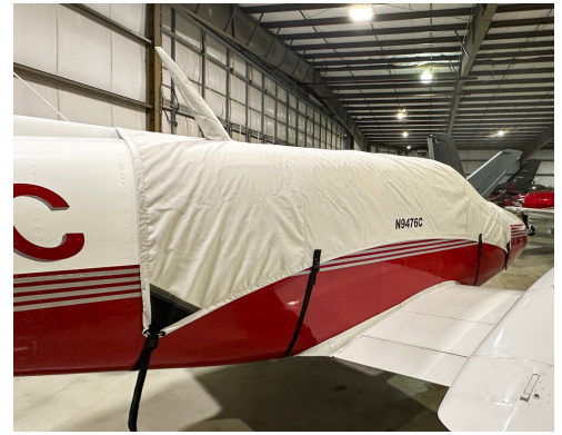
Cessna T303 Canopy Cover