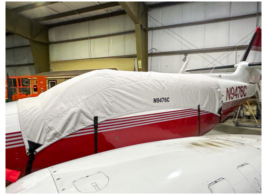
Cessna T303 Canopy Cover