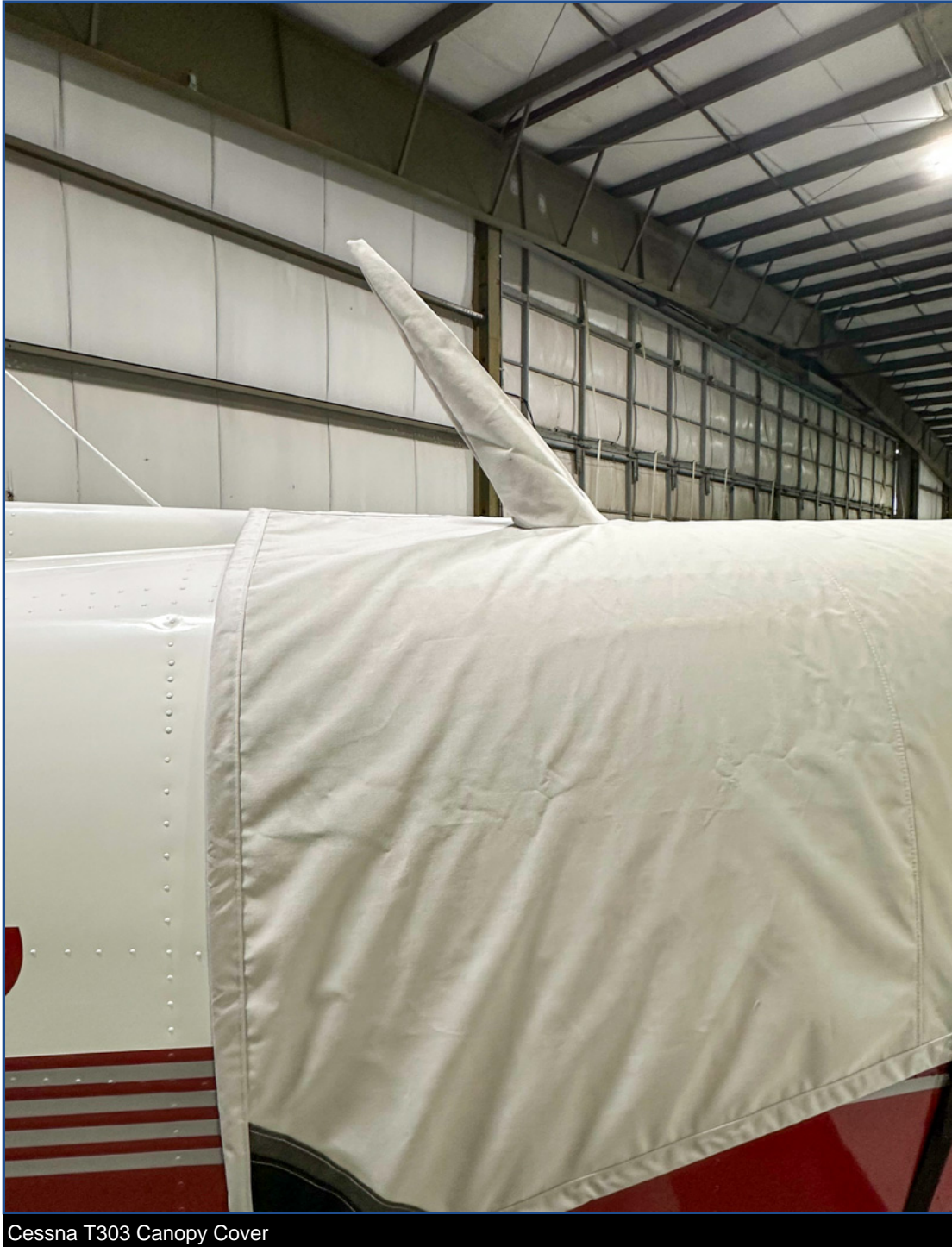
Cessna T303 Canopy Cover