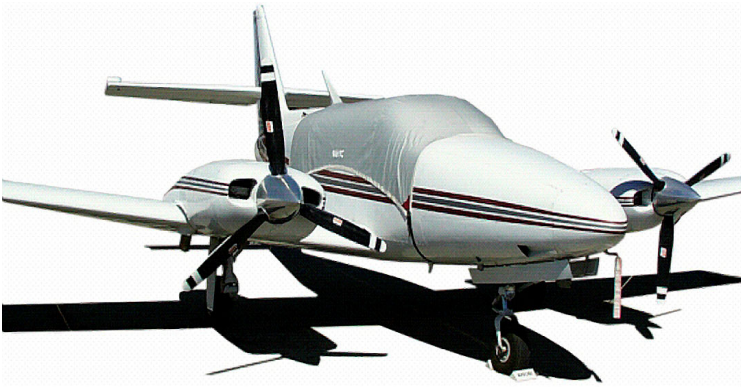
Cessna Crusader Standard Canopy Cover