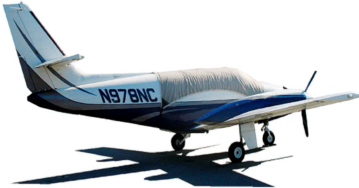
Cessna 303 Crusader Canopy Cover

Travel Covers are made with Silver Solution-Dyed Polyester fabric and only lined over the windshield to save weight. The material is lightweight and more compact for easy stowage in the aircraft. The polyester material is water resistant, but only intended for occasional use outside. We also have an ultra lightweight material available for fitted hangar dust covers. For daily outdoor use, the non-travel Sunbrella Cover is the best choice.