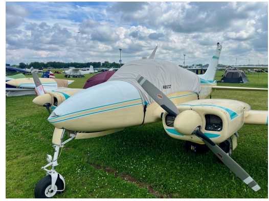
Cessna 310G Canopy Cover