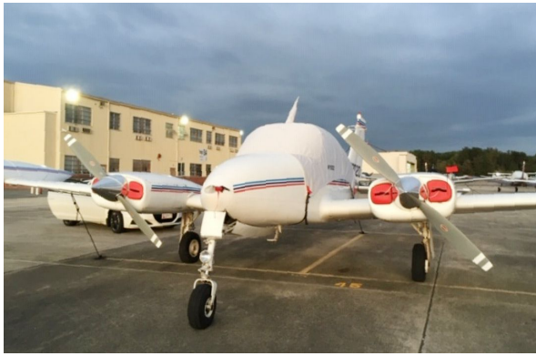
Cessna 310H Canopy Cover