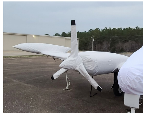
Cessna 310Q Wing/Engine Covers, Prop Covers