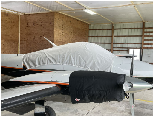
Cessna 310K Canopy & Insulated Engine Covers