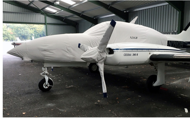
Cessna 310R Extended Canopy/Engine Cover, 3-Blade Prop Covers