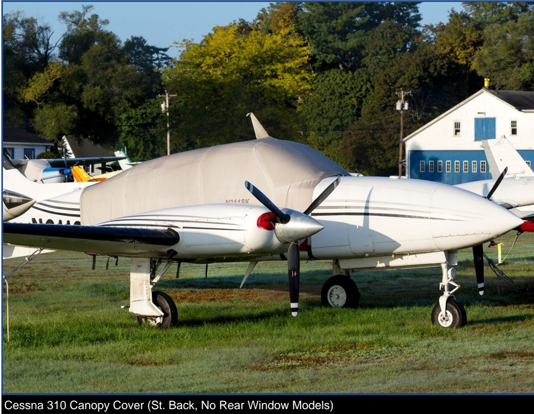
Cessna 310 Canopy Cover (St. Back, No Rear Window Models)