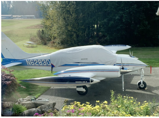
Cessna 310Q Canopy Cover