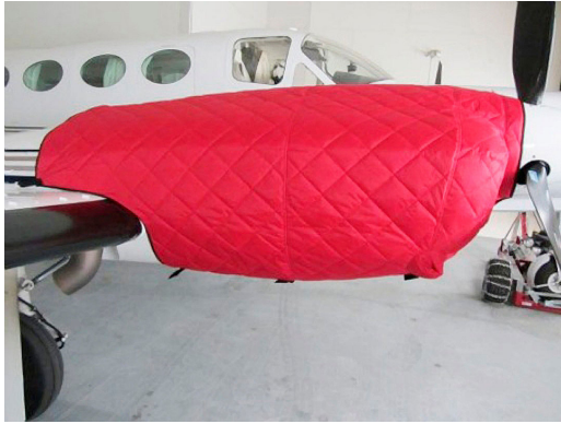
Cessna 421 Insulated Engine Covers

This cover type is made from Silver Acrylic Sunbrella canvas and is 100% lined with a soft and smooth microfiber. Bruce's Custom Covers developed this material combination especially for aircraft protection. The outer material is medium weight and treated for water resistance, UV resistance and anti-static buildup. The inner lining is a very soft and smooth microfiber to prevent scratching. The material is very reflective, and tests show that the cabin interior temperature can be reduced to near-ambient temperature on the hottest of days. It is water, ice and snow repellent, yet breathable to allow moisture to escape from between the cover and the aircraft surface.