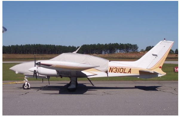
Cessna 310R Canopy/Nose Cover