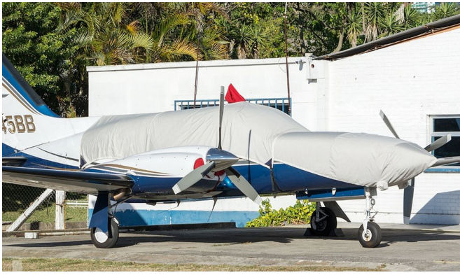
Cessna 421 Canopy Cover & Nose Cover