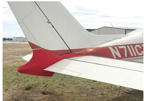
Cessna 310 Tailcone Cover