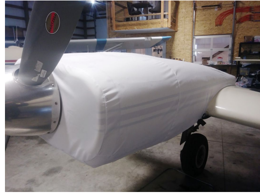
Cessna 310B Engine Covers, test fit cover