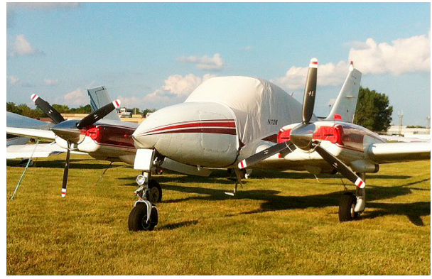
Cessna 310 Standard Canopy Cover and Engine Inlet Plugs