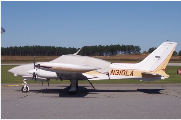
Cessna 310R Canopy/Nose Cover

Travel Covers are made with Silver Solution-Dyed Polyester fabric and only lined over the windshield to save weight. The material is lightweight and more compact for easy stowage in the aircraft. The polyester material is water resistant, but only intended for occasional use outside. We also have an ultra lightweight material available for fitted hangar dust covers. For daily outdoor use, the non-travel Sunbrella Cover is the best choice.