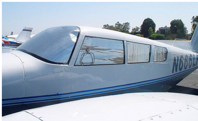
Piper PA-30 Twin Comanche Cockpit HeatShields