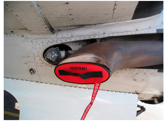
Beech 18 Exhaust Plugs