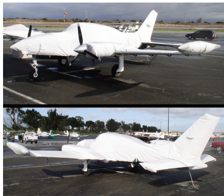
Cessna 310 Complete Cover Set

shorter useful life if used continuously outside than the all-year use material.