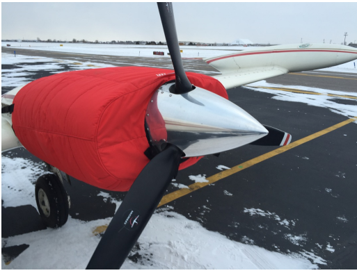
Cessna 310 Insulated Engine Cover