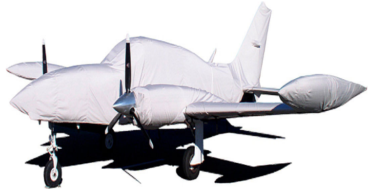
Cessna 310 Complete Cover Set