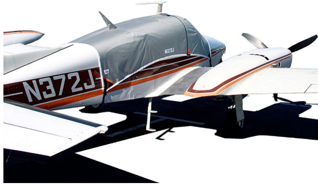
Cessna 320 Canopy Cover

Travel Covers are made with Silver Solution-Dyed Polyester fabric and only lined over the windshield to save weight. The material is lightweight and more compact for easy stowage in the aircraft. The polyester material is water resistant, but only intended for occasional use outside. We also have an ultra lightweight material available for fitted hangar dust covers. For daily outdoor use, the non-travel Sunbrella Cover is the best choice.