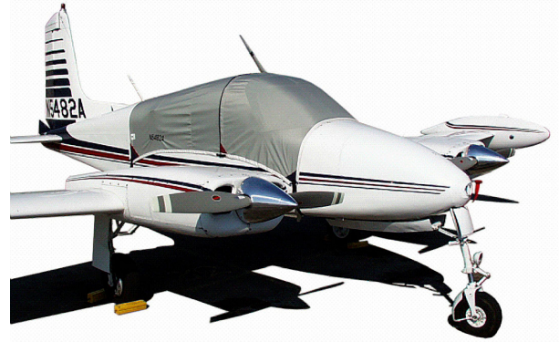
Cessna 310A Canopy Cover