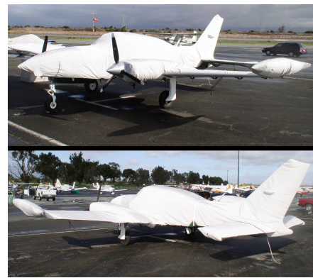
Cessna 310 Complete Cover Set