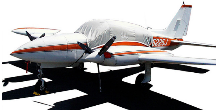
Cessna 310Q Canopy Cover