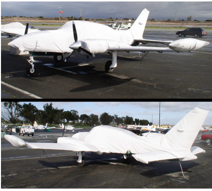
Cessna 310 Complete Cover Set