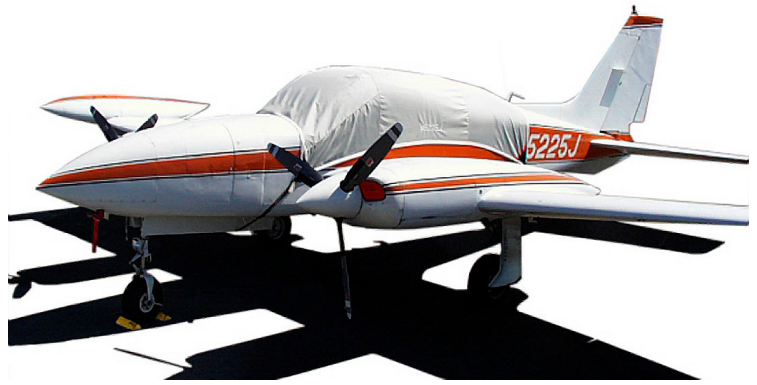
Cessna 310Q Canopy Cover