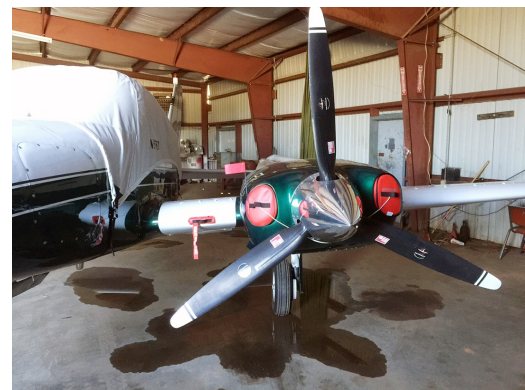
Cessna 310 Engine and Center Section Plugs