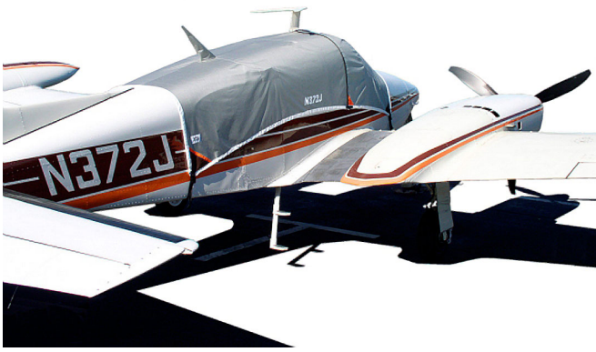
Cessna 320 Canopy Cover