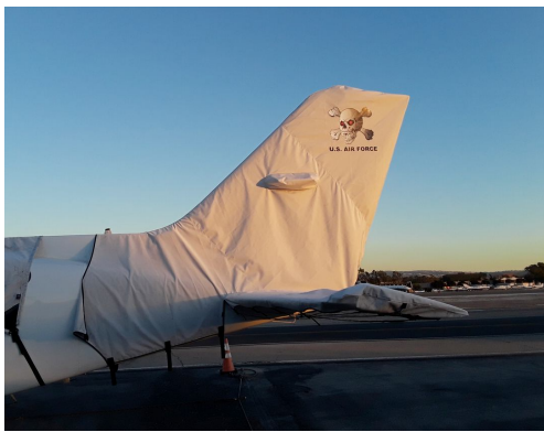
Cessna 421 Empennage Cover