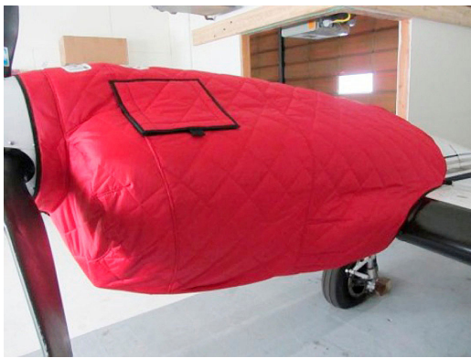
Cessna 421 Insulated Engine Covers