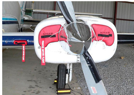
Cessna 310P Engine Inlet and Center Section Inlet Plugs