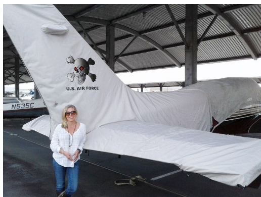
Cessna 310R Empennage Cover