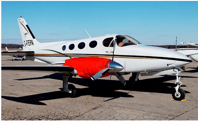
Cessna 340 Insulated Engine Covers