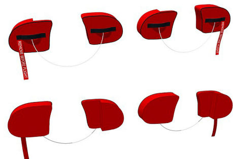
Cessna 414A Engine Plugs