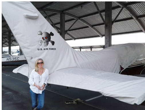
Cessna 310R Empennage Cover