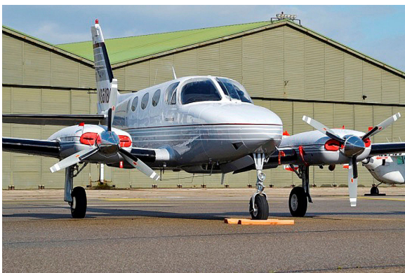
Cessna 340 Engine Plugs

Engine Inlet Plugs are custom fit for your Cessna 320 intakes, made with heavy-duty vinyl material, and stuffed with a single block of sculpted urethane foam. Each plug has a zipper that allows the foam to be removed and dried if necessary. Engine plugs have warning flags that are visible from the cockpit or 'remove before flight' streamers sewn onto the face of the plugs. Most plugs are imprinted with the aircraft registration number in black for an extra charge. Storage bag NOT included. Engine plugs may be inserted after flight when the engine is still warm. Engine Inlet Plugs are commonly referred to as Cowl Plugs, Intake Plugs, Cowl Blocks, Engine Blocks, and Engine Bungs.