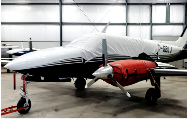
Cessna 340 Canopy Cover

This cover type is made from Silver Acrylic Sunbrella canvas and is 100% lined with a soft and smooth microfiber. Bruce's Custom Covers developed this material combination especially for aircraft protection. The outer material is medium weight and treated for water resistance, UV resistance and anti-static buildup. The inner lining is a very soft and smooth microfiber to prevent scratching. The material is very reflective, and tests show that the cabin interior temperature can be reduced to near-ambient temperature on the hottest of days. It is water, ice and snow repellent, yet breathable to allow moisture to escape from between the cover and the aircraft surface.