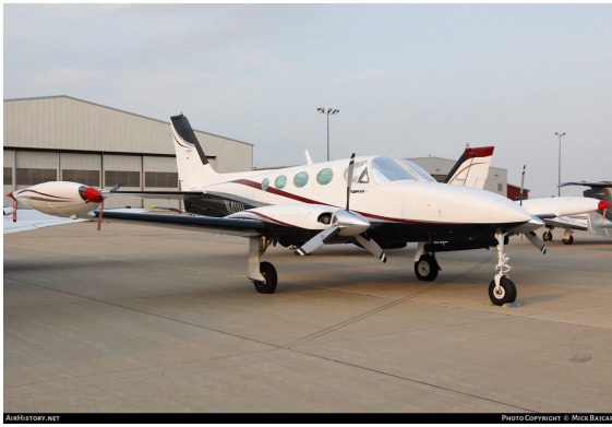
Cessna 340 Wingtip Pads