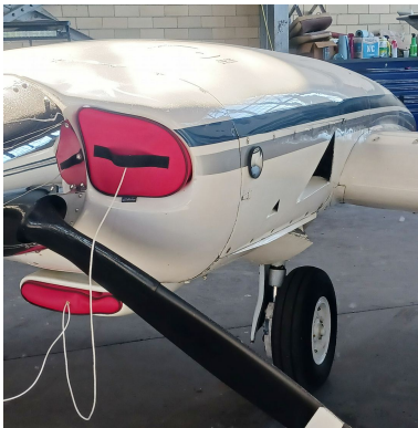
Cessna 340 Engine Inlet Plugs