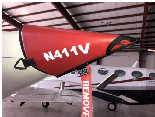
Cessna 335, 340 Wingtip Pads

Designed to prevent damage to the aircraft extremities in crowded hangars, these products are made of bright red Naugahyde and thickly padded with a sandwich of closed cell foam.