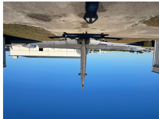
Cessna 340 Empennage Cover, Wing/Engine Covers