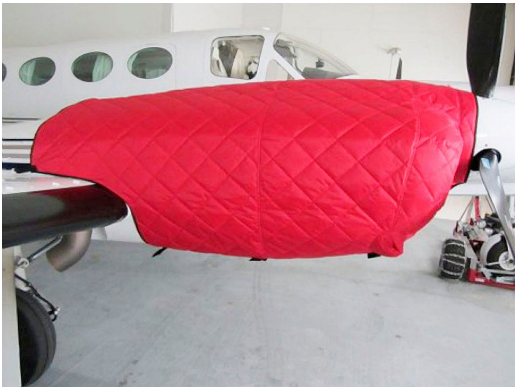
Cessna 421 Insulated Engine Covers

This cover type is made from Silver Acrylic Sunbrella canvas and is 100% lined with a soft and smooth microfiber. Bruce's Custom Covers developed this material combination especially for aircraft protection. The outer material is medium weight and treated for water resistance, UV resistance and anti-static buildup. The inner lining is a very soft and smooth microfiber to prevent scratching. The material is very reflective, and tests show that the cabin interior temperature can be reduced to near-ambient temperature on the hottest of days. It is water, ice and snow repellent, yet breathable to allow moisture to escape from between the cover and the aircraft surface.