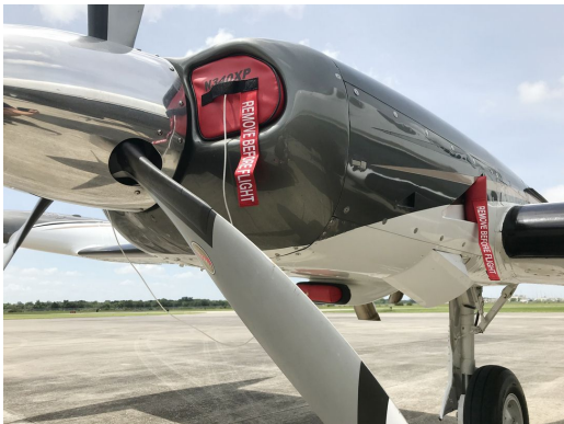
Cessna 340A Engine Plugs

Engine Inlet Plugs are custom fit for your Cessna 335, 340 intakes, made with heavy-duty vinyl material, and stuffed with a single block of sculpted urethane foam. Each plug has a zipper that allows the foam to be removed and dried if necessary. Engine plugs have warning flags that are visible from the cockpit or 'remove before flight' streamers sewn onto the face of the plugs. Most plugs are imprinted with the aircraft registration number in black for an extra charge. Storage bag NOT included. Engine plugs may be inserted after flight when the engine is still warm. Engine Inlet Plugs are commonly referred to as Cowl Plugs, Intake Plugs, Cowl Blocks, Engine Blocks, and Engine Bungs.