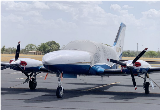
Cessna 414 Travel Weight Canopy Cover, Engine Plugs

Travel Covers are made with Silver Solution-Dyed Polyester fabric and only lined over the windshield to save weight. The material is lightweight and more compact for easy stowage in the aircraft. The polyester material is water resistant, but only intended for occasional use outside. We also have an ultra lightweight material available for fitted hangar dust covers. For daily outdoor use, the non-travel Sunbrella Cover is the best choice.