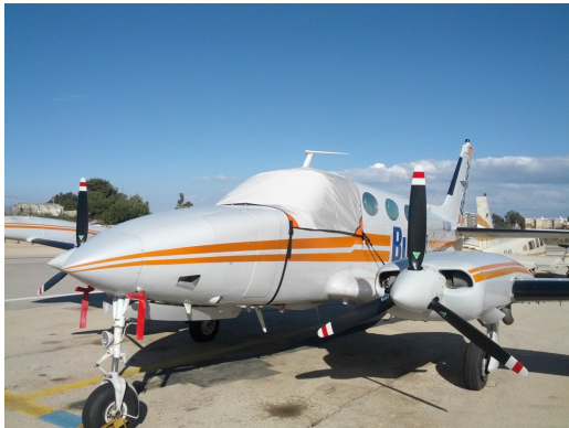
Cessna 340 Cockpit/Windshield Cover