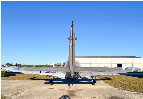
Cessna 335, 340 Empennage Cover (Tailboom, Vertical & Horiz Stabilizers), All Year Use