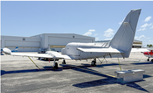
Cessna 340 Complete Cover Set