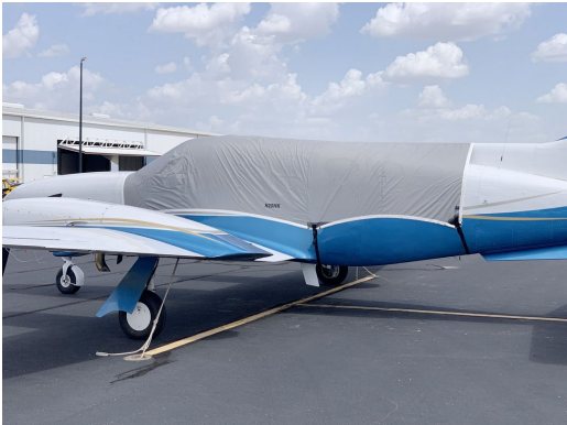
Cessna 414 Travel Weight Canopy Cover