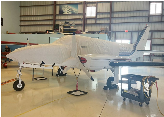
Cessna 340 Extended Canopy/Nose Cover

This cover type is made from Silver Acrylic Sunbrella canvas and is 100% lined with a soft and smooth microfiber. Bruce's Custom Covers developed this material combination especially for aircraft protection. The outer material is medium weight and treated for water resistance, UV resistance and anti-static buildup. The inner lining is a very soft and smooth microfiber to prevent scratching. The material is very reflective, and tests show that the cabin interior temperature can be reduced to near-ambient temperature on the hottest of days. It is water, ice and snow repellent, yet breathable to allow moisture to escape from between the cover and the aircraft surface.