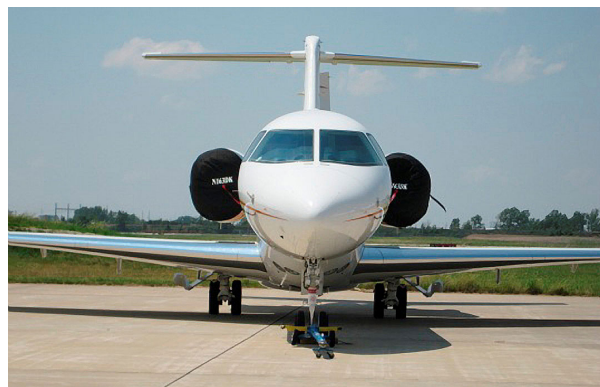
Hawker 4000 Intake Covers