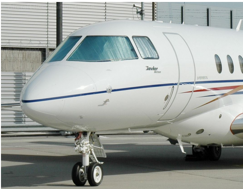
Hawker Beechcraft 4000 Horizon Cockpit Heatshields

Cockpit Heatshields are interior sunshades for the aircraft's cockpit. The product is a unique composite of closed-cell foam with a silver mylar finish. The semi-rigid design is stiff enough to stand inside the window framing. The set folds up flat and is easily stored in the included storage sleeve. Some designs may require velcro and suction cups. Our Heatshields for jets are offered white side out because some aircraft manufacturers have issued advisories against reflective window inserts due to potential heat damage. A Heatshield is an excellent short-term remedy for cockpit overheating, but an external fabric cover is more effective for long-term protection.