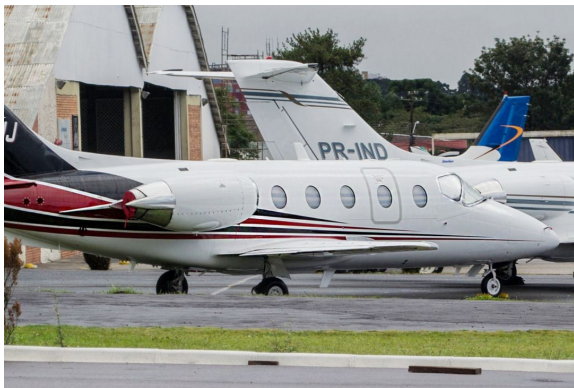
Beechjet Engine Plugs and Cockpit Heatshields

Cockpit Heatshields are interior sunshades for the aircraft's cockpit. The product is a unique composite of closed-cell foam with a silver mylar finish. The semi-rigid design is stiff enough to stand inside the window framing. The set folds up flat and is easily stored in the included storage sleeve. Some designs may require velcro and suction cups. Our Heatshields for jets are offered white side out because some aircraft manufacturers have issued advisories against reflective window inserts due to potential heat damage. A Heatshield is an excellent short-term remedy for cockpit overheating, but an external fabric cover is more effective for long-term protection.