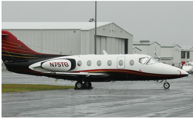
Nextant 400XTi Cockpit HeatShields, Bikini Type Engine Covers