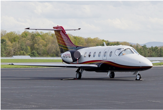
Nextant 400XTi Cockpit HeatShields, Bikini Type Engine Covers

This cover type is made from Silver Acrylic Sunbrella canvas and is 100% lined with a soft and smooth microfiber. Bruce's Custom Covers developed this material combination especially for aircraft protection. The outer material is medium weight and treated for water resistance, UV resistance and anti-static buildup. The inner lining is a very soft and smooth microfiber to prevent scratching. The material is very reflective, and tests show that the cabin interior temperature can be reduced to near-ambient temperature on the hottest of days. It is water, ice and snow repellent, yet breathable to allow moisture to escape from between the cover and the aircraft surface.