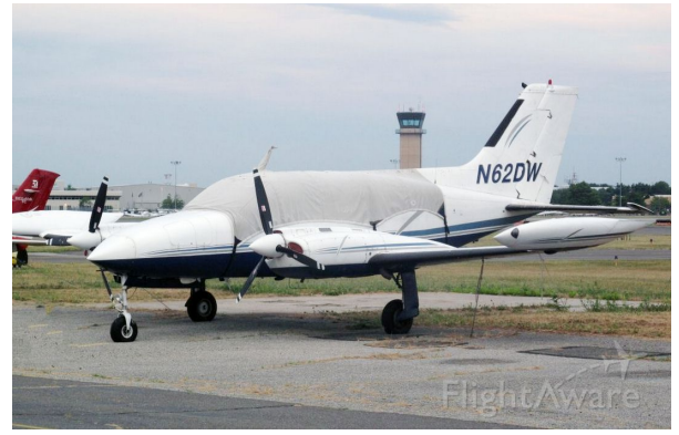
Cessna 421 Canopy Cover