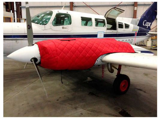
Cessna 402 Insulated Engine Cover