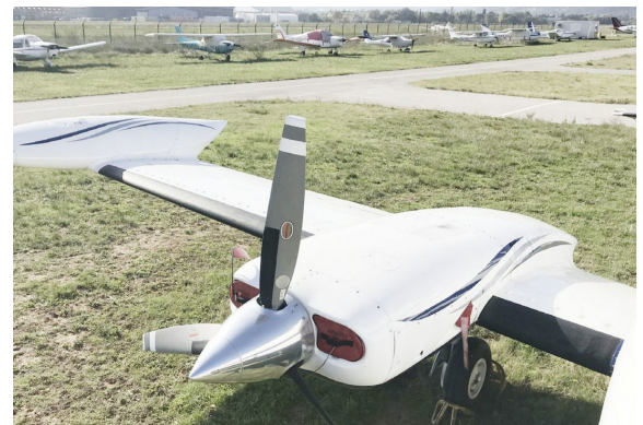
Cessna 340 Engine Inlet Plugs