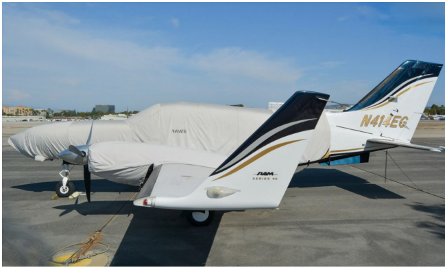
Cessna 414A Extended Canopy/Nose Cover & Engine Covers