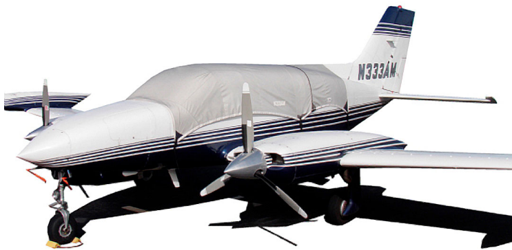
Cessna 414 Canopy Cover & Pitot Covers

Travel Covers are made with Silver Solution-Dyed Polyester fabric and only lined over the windshield to save weight. The material is lightweight and more compact for easy stowage in the aircraft. The polyester material is water resistant, but only intended for occasional use outside. We also have an ultra lightweight material available for fitted hangar dust covers. For daily outdoor use, the non-travel Sunbrella Cover is the best choice.