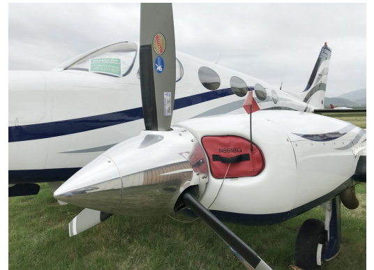
Cessna 340 Engine Inlet Plugs