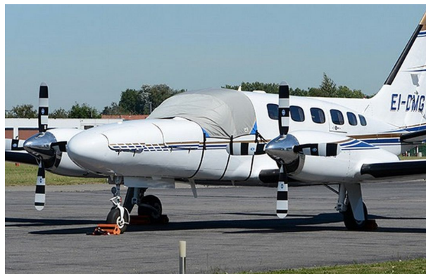
Cessna 441 Cockpit Cover