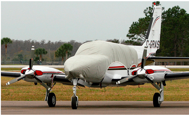
Cessna 340 Canopy/Nose Cover & Engine Inlet Plugs

Travel Covers are made with Silver Solution-Dyed Polyester fabric and only lined over the windshield to save weight. The material is lightweight and more compact for easy stowage in the aircraft. The polyester material is water resistant, but only intended for occasional use outside. We also have an ultra lightweight material available for fitted hangar dust covers. For daily outdoor use, the non-travel Sunbrella Cover is the best choice.