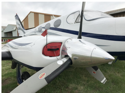
Cessna 340 Engine Inlet Plugs

Engine Inlet Plugs are custom fit for your Cessna 402 intakes, made with heavy-duty vinyl material, and stuffed with a single block of sculpted urethane foam. Each plug has a zipper that allows the foam to be removed and dried if necessary. Engine plugs have warning flags that are visible from the cockpit or 'remove before flight' streamers sewn onto the face of the plugs. Most plugs are imprinted with the aircraft registration number in black for an extra charge. Storage bag NOT included. Engine plugs may be inserted after flight when the engine is still warm. Engine Inlet Plugs are commonly referred to as Cowl Plugs, Intake Plugs, Cowl Blocks, Engine Blocks, and Engine Bungs.