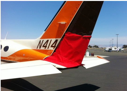
Cessna 414 Rudder Openings Cover (bird barrier)

WINTER USE MATERIAL - Made with Solution-Dyed Polyester fabric, this option is intended for seasonal use to aid in deicing, rain mitigation, or for occasional travel. The material is lighter and more compact, but more susceptible to UV damage and may have a shorter useful life if used continuously outside than the all-year use material.