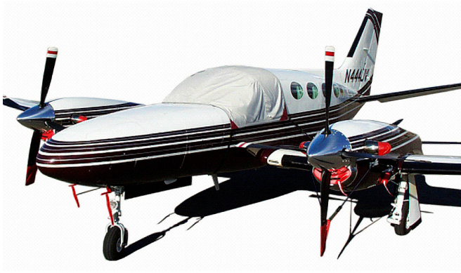
Cessna 425 Cockpit Cover