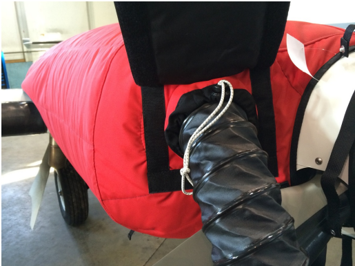
Cessna 402 Insulated Engine Cover with Heater