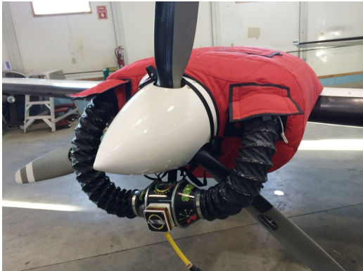
Cessna 402 Insulated Engine Cover with Heater

This cover type is made from Silver Acrylic Sunbrella canvas and is 100% lined with a soft and smooth microfiber. Bruce's Custom Covers developed this material combination especially for aircraft protection. The outer material is medium weight and treated for water resistance, UV resistance and anti-static buildup. The inner lining is a very soft and smooth microfiber to prevent scratching. The material is very reflective, and tests show that the cabin interior temperature can be reduced to near-ambient temperature on the hottest of days. It is water, ice and snow repellent, yet breathable to allow moisture to escape from between the cover and the aircraft surface.