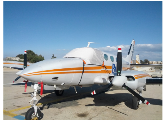
Cessna 340 Cockpit/Windshield Cover