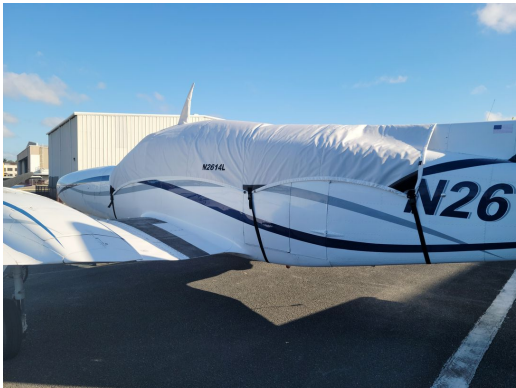
Cessna 402C Canopy Cover

The Cessna 402 Nose Cover is designed to cover the section of the fuselage forward of the windshield to the tip of the nose. It is secured with belly straps. This cover type is made from Silver Acrylic Sunbrella canvas and is 100% lined with a soft and smooth microfiber. Bruce's Custom Covers developed this material combination especially for aircraft protection. The outer material is medium weight and treated for water resistance, UV resistance and anti-static buildup. The inner lining is a very soft and smooth microfiber to prevent scratching. The material is very reflective, and tests show that the cabin interior temperature can be reduced to near-ambient temperature on the hottest of days. It is water, ice and snow repellent, yet breathable to allow moisture to escape from between the cover and the aircraft surface.