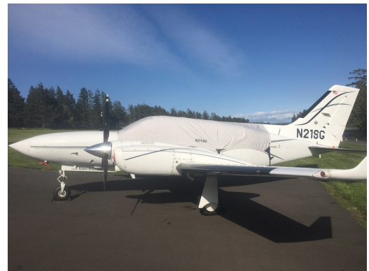
Cessna 421C Canopy Cover