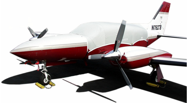
Cessna 421C Canopy Cover & Engine Plugs