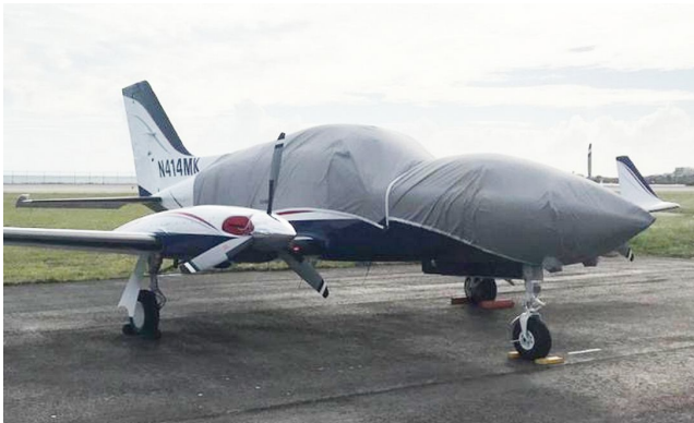
Cessna 414 Travel Cover, Light Weight Canopy Cover