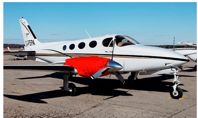
Cessna 340 Insulated Engine Covers