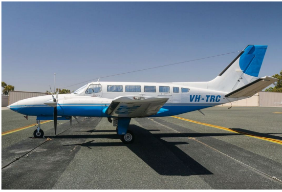
Cessna 404 & F406 HeatShields