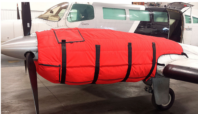
Cessna 404 Insulated Engine Cover

This cover type is made from Silver Acrylic Sunbrella canvas and is 100% lined with a soft and smooth microfiber. Bruce's Custom Covers developed this material combination especially for aircraft protection. The outer material is medium weight and treated for water resistance, UV resistance and anti-static buildup. The inner lining is a very soft and smooth microfiber to prevent scratching. The material is very reflective, and tests show that the cabin interior temperature can be reduced to near-ambient temperature on the hottest of days. It is water, ice and snow repellent, yet breathable to allow moisture to escape from between the cover and the aircraft surface.