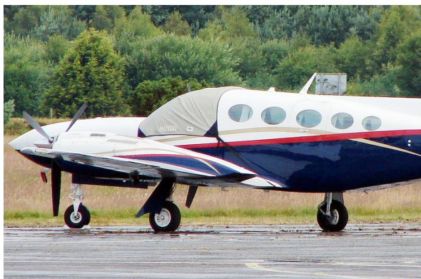
Cessna 421 Cockpit Cover

This cover type is made from Silver Acrylic Sunbrella canvas and is 100% lined with a soft and smooth microfiber. Bruce's Custom Covers developed this material combination especially for aircraft protection. The outer material is medium weight and treated for water resistance, UV resistance and anti-static buildup. The inner lining is a very soft and smooth microfiber to prevent scratching. The material is very reflective, and tests show that the cabin interior temperature can be reduced to near-ambient temperature on the hottest of days. It is water, ice and snow repellent, yet breathable to allow moisture to escape from between the cover and the aircraft surface.