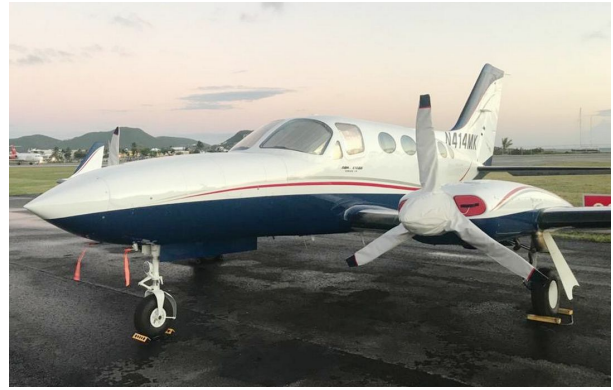
Cessna 414 Propellor/Spinner Covers, 3 Blade