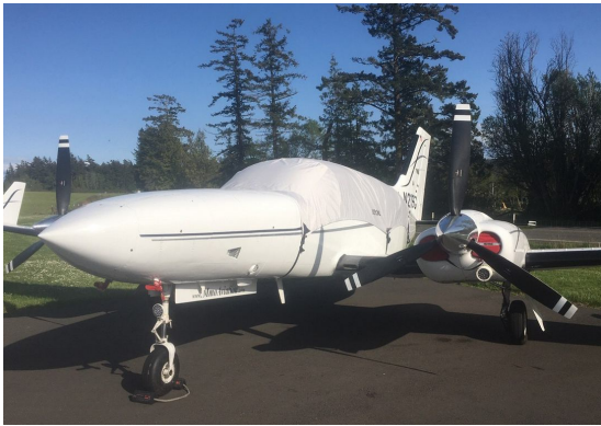
Cessna 421C Canopy Cover