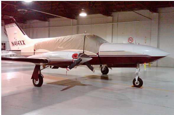
Cessna 414 Canopy Cover and Engine Inlet Plugs

non-travel Sunbrella Cover is the best choice.