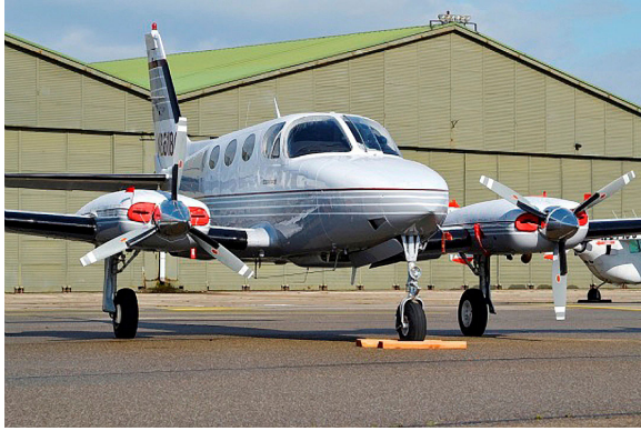
Cessna 340 Engine Plugs

Engine Inlet Plugs are custom fit for your Cessna 404 Titan, F406 Caravan II intakes, made with heavy-duty vinyl material, and stuffed with a single block of sculpted urethane foam. Each plug has a zipper that allows the foam to be removed and dried if necessary. Engine plugs have warning flags that are visible from the cockpit or 'remove before flight' streamers sewn onto the face of the plugs. Most plugs are imprinted with the aircraft registration number in black for an extra charge. Storage bag NOT included. Engine plugs may be inserted after flight when the engine is still warm. Engine Inlet Plugs are commonly referred to as Cowl Plugs, Intake Plugs, Cowl Blocks, Engine Blocks, and Engine Bungs.