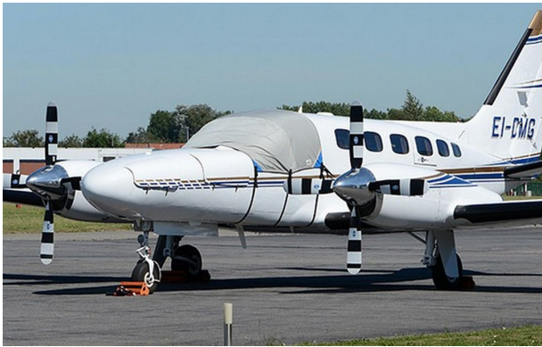
Cessna 441 Cockpit Cover

This cover type is made from Silver Acrylic Sunbrella canvas and is 100% lined with a soft and smooth microfiber. Bruce's Custom Covers developed this material combination especially for aircraft protection. The outer material is medium weight and treated for water resistance, UV resistance and anti-static buildup. The inner lining is a very soft and smooth microfiber to prevent scratching. The material is very reflective, and tests show that the cabin interior temperature can be reduced to near-ambient temperature on the hottest of days. It is water, ice and snow repellent, yet breathable to allow moisture to escape from between the cover and the aircraft surface.