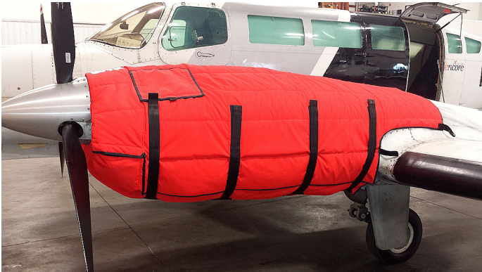
Cessna 404 Insulated Engine Cover