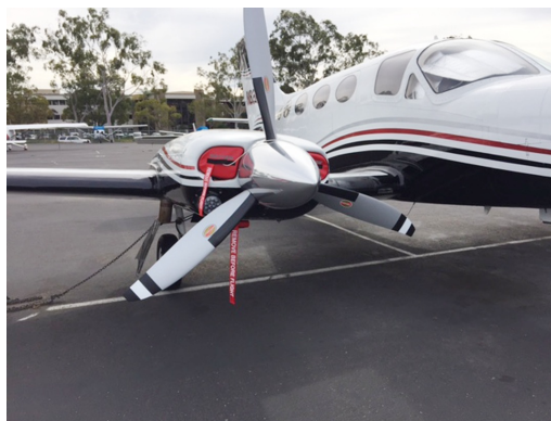
Cessna 414 Engine Inlet Plugs