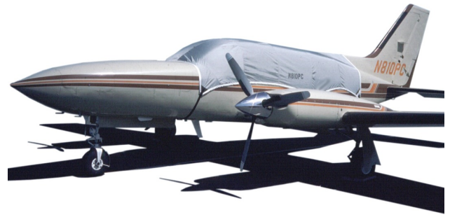
Cessna 421 Cockpit/Windshield Cover