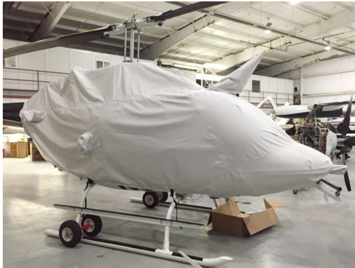
Bell JetRanger 206B Main Body Cover

This cover type is made from Silver Acrylic Sunbrella canvas and is 100% lined with a soft and smooth microfiber. Bruce's Custom Covers developed this material combination especially for aircraft protection. The outer material is medium weight and treated for water resistance, UV resistance and anti-static buildup. The inner lining is a very soft and smooth microfiber to prevent scratching. The material is very reflective, and tests show that the cabin interior temperature can be reduced to near-ambient temperature on the hottest of days. It is water, ice and snow repellent, yet breathable to allow moisture to escape from between the cover and the aircraft surface.