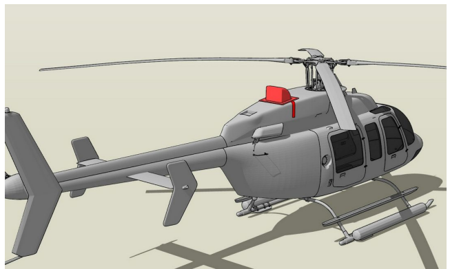
Bell 407 Exhaust/Gap Cover (weighted)