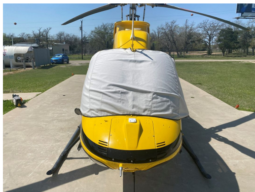
Bell 407 Windshield Cover

Travel Covers are made with Silver Solution-Dyed Polyester fabric and fully lined over the entire cover. The material is lightweight and more compact for easy storage in the aircraft. The polyester material is water resistant, but only intended for occasional use outside. We also have an ultra lightweight material available for fitted hangar dust covers. For daily outdoor use, the non-travel Sunbrella Cover is the best choice.