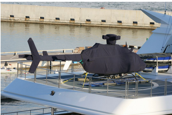
Bell 407 Complete Cover Set

The Tailboom Cover details vary by model, but generally the helicopter tail boom cover encloses the tail boom from the "bottleneck" to the aft end. They usually also cover the horizontal stabilizers, and are custom made to allow for antennae, lights, and other protrusions. They attach with straps underneath the tail boom. Covers for the vertical and horizontal stabilizers are also available separately. Specific information for each model is available on request.