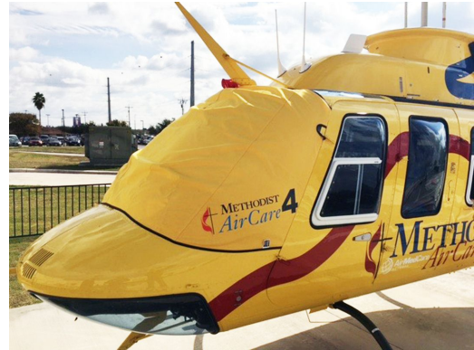
Yellow Windshield Cover with artwork