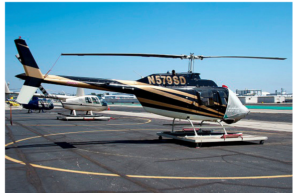
Bell 206B Cockpit/Nose Cover