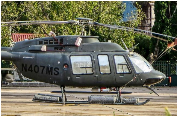
Bell 407 Cockpit & Cabin HeatShields

Heatshields are interior sunshades for an aircraft's windows or canopy glass. The product is a unique composite of closed-cell foam with a silver mylar finish. The semi-rigid design is stiff enough to stand along the inside of the windshield using sun visors or window framing. It folds up flat and easily stores in the included storage sleeve. Some designs may require velcro and suction cups. A Heatshield is an excellent short-term remedy for cockpit overheating.