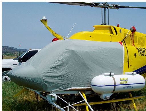
206B Bubble Cover