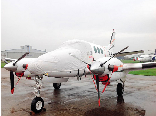
King Air Cockpit/Nose Cover, Plugs, Prop Tie/Exhaust Covers

This cover type is made from Silver Acrylic Sunbrella canvas and is 100% lined with a soft and smooth microfiber. Bruce's Custom Covers developed this material combination especially for aircraft protection. The outer material is medium weight and treated for water resistance, UV resistance and anti-static buildup. The inner lining is a very soft and smooth microfiber to prevent scratching. The material is very reflective, and tests show that the cabin interior temperature can be reduced to near-ambient temperature on the hottest of days. It is water, ice and snow repellent, yet breathable to allow moisture to escape from between the cover and the aircraft surface.