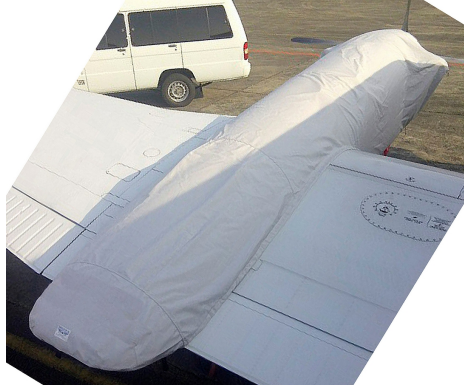
King Air 350 Engine Cover

The material is very reflective, and tests show that the cabin interior temperature can be reduced to near-ambient temperature on the hottest of days. It is water, ice and snow repellent, yet breathable to allow moisture to escape from between the cover and the aircraft surface.