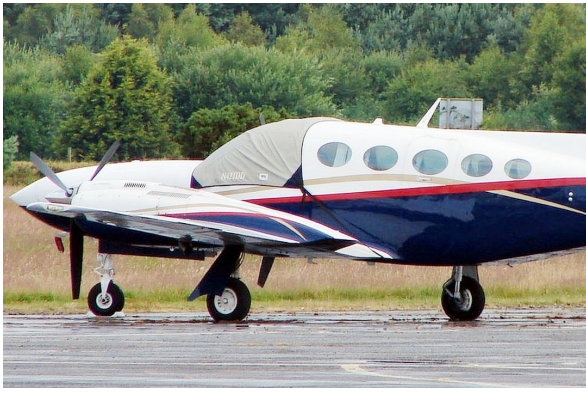
Cessna 421 Cockpit Cover