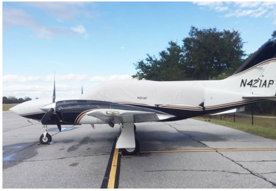
Cessna 421 Canopy Cover