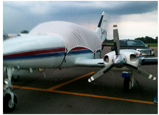
Cessna 401B Canopy Cover