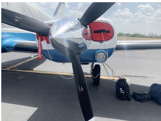
Cessna 414 Engine Plugs

Engine Inlet Plugs are custom fit for your Cessna 414, 414A intakes, made with heavy-duty vinyl material, and stuffed with a single block of sculpted urethane foam. Each plug has a zipper that allows the foam to be removed and dried if necessary. Engine plugs have warning flags that are visible from the cockpit or 'remove before flight' streamers sewn onto the face of the plugs. Most plugs are imprinted with the aircraft registration number in black for an extra charge. Storage bag NOT included. Engine plugs may be inserted after flight when the engine is still warm. Engine Inlet Plugs are commonly referred to as Cowl Plugs, Intake Plugs, Cowl Blocks, Engine Blocks, and Engine Bungs.