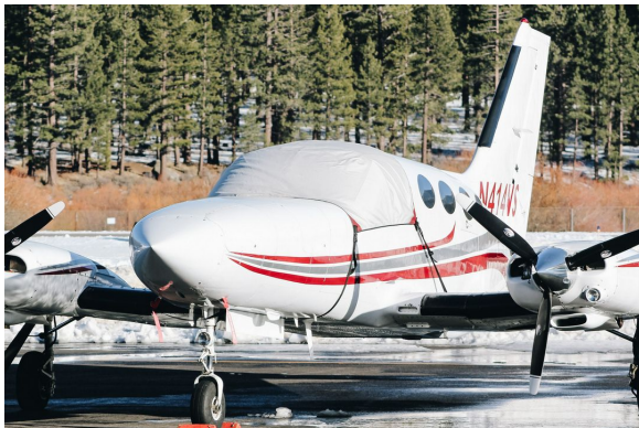
Cessna 414 Cockpit Cover

This cover type is made from Silver Acrylic Sunbrella canvas and is 100% lined with a soft and smooth microfiber. Bruce's Custom Covers developed this material combination especially for aircraft protection. The outer material is medium weight and treated for water resistance, UV resistance and anti-static buildup. The inner lining is a very soft and smooth microfiber to prevent scratching. The material is very reflective, and tests show that the cabin interior temperature can be reduced to near-ambient temperature on the hottest of days. It is water, ice and snow repellent, yet breathable to allow moisture to escape from between the cover and the aircraft surface.