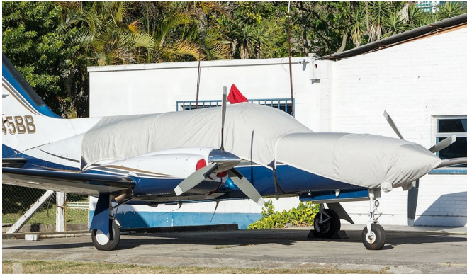
Cessna 421 Canopy Cover & Nose Cover

Travel Covers are made with Silver Solution-Dyed Polyester fabric and only lined over the windshield to save weight. The material is lightweight and more compact for easy stowage in the aircraft. The polyester material is water resistant, but only intended for occasional use outside. We also have an ultra lightweight material available for fitted hangar dust covers. For daily outdoor use, the non-travel Sunbrella Cover is the best choice.