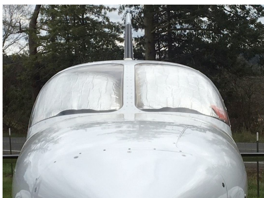
Cessna 421 Windshield HeatShields

Heatshields are interior sunshades for an aircraft's windows or canopy glass. The product is a unique composite of closed-cell foam with a silver mylar finish. The semi-rigid design is stiff enough to stand along the inside of the windshield using sun visors or window framing. It folds up flat and easily stores in the included storage sleeve. Some designs may require velcro and suction cups. A Heatshield is an excellent short-term remedy for cockpit overheating.