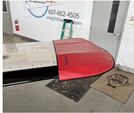
Cessna 421C Wingtip Pads