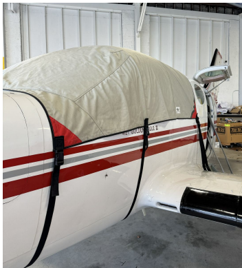
Cessna 421C Extended Cockpit Cover, extends back to 1st cabin window

This cover type is made from Silver Acrylic Sunbrella canvas and is 100% lined with a soft and smooth microfiber. Bruce's Custom Covers developed this material combination especially for aircraft protection. The outer material is medium weight and treated for water resistance, UV resistance and anti-static buildup. The inner lining is a very soft and smooth microfiber to prevent scratching. The material is very reflective, and tests show that the cabin interior temperature can be reduced to near-ambient temperature on the hottest of days. It is water, ice and snow repellent, yet breathable to allow moisture to escape from between the cover and the aircraft surface.