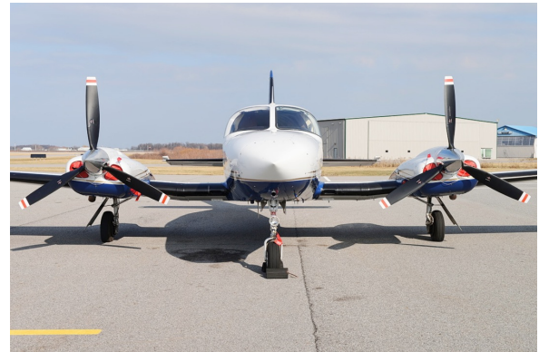
Cessna 421C Engine Inlet Plugs