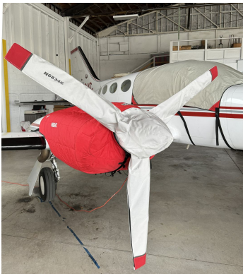
Cessna 421 Propellor/Spinner Covers, 3 Blade

This cover type is made from Silver Acrylic Sunbrella canvas and is 100% lined with a soft and smooth microfiber. Bruce's Custom Covers developed this material combination especially for aircraft protection. The outer material is medium weight and treated for water resistance, UV resistance and anti-static buildup. The inner lining is a very soft and smooth microfiber to prevent scratching. The material is very reflective, and tests show that the cabin interior temperature can be reduced to near-ambient temperature on the hottest of days. It is water, ice and snow repellent, yet breathable to allow moisture to escape from between the cover and the aircraft surface.