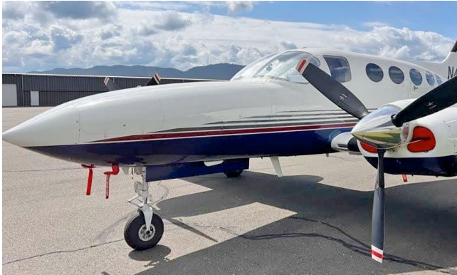
Cessna 421 Engine Plugs

Engine Inlet Plugs are custom fit for your Cessna 421 intakes, made with heavy-duty vinyl material, and stuffed with a single block of sculpted urethane foam. Each plug has a zipper that allows the foam to be removed and dried if necessary. Engine plugs have warning flags that are visible from the cockpit or 'remove before flight' streamers sewn onto the face of the plugs. Most plugs are imprinted with the aircraft registration number in black for an extra charge. Storage bag NOT included. Engine plugs may be inserted after flight when the engine is still warm. Engine Inlet Plugs are commonly referred to as Cowl Plugs, Intake Plugs, Cowl Blocks, Engine Blocks, and Engine Bungs.