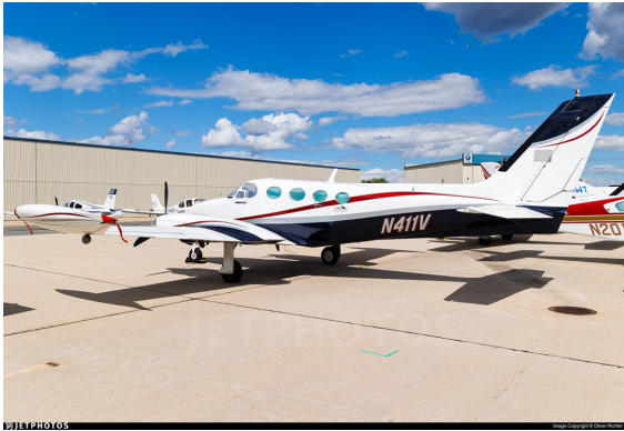
Cessna 340 Wingtip Pads

Designed to prevent damage to the aircraft extremities in crowded hangars, these products are made of bright red Naugahyde and thickly padded with a sandwich of closed cell foam.