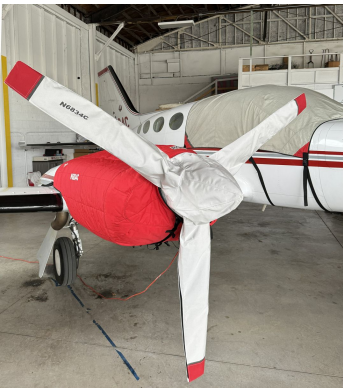
Cessna 421 Propellor/Spinner Covers, 3 Blade