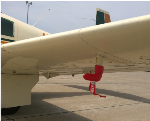
Mooney Pitot Cover