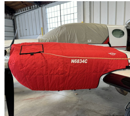
Cessna 421C Insulated Engine Covers