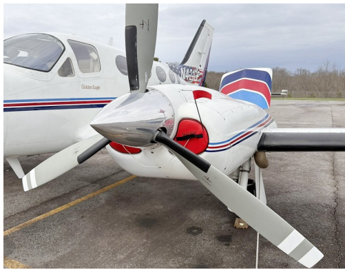
Cessna 421 Engine Inlet Plugs

Engine Inlet Plugs are custom fit for your Cessna 421 intakes, made with heavy-duty vinyl material, and stuffed with a single block of sculpted urethane foam. Each plug has a zipper that allows the foam to be removed and dried if necessary. Engine plugs have warning flags that are visible from the cockpit or 'remove before flight' streamers sewn onto the face of the plugs. Most plugs are imprinted with the aircraft registration number in black for an extra charge. Storage bag NOT included. Engine plugs may be inserted after flight when the engine is still warm. Engine Inlet Plugs are commonly referred to as Cowl Plugs, Intake Plugs, Cowl Blocks, Engine Blocks, and Engine Bungs.