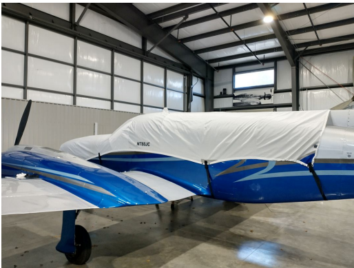
Cessna 421B Canopy/Nose Cover