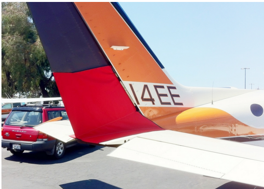
Cessna 414 Rudder Openings Cover (bird barrier)

WINTER USE MATERIAL - Made with Solution-Dyed Polyester fabric, this option is intended for seasonal use to aid in deicing, rain mitigation, or for occasional travel. The material is lighter and more compact, but more susceptible to UV damage and may have a shorter useful life if used continuously outside than the all-year use material.