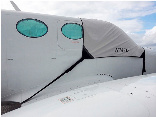
Cessna 340 Cockpit/Windshield Cover