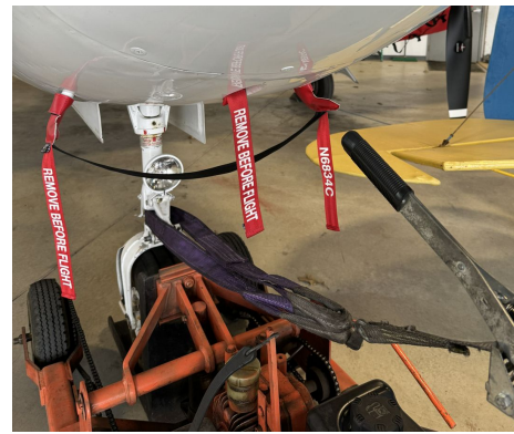
Cessna 421C Pitot Covers, Nose Inlet Plug