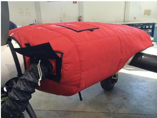
Cessna 402 Insulated Engine Cover with Heater

This cover type is made from Silver Acrylic Sunbrella canvas and is 100% lined with a soft and smooth microfiber. Bruce's Custom Covers developed this material combination especially for aircraft protection. The outer material is medium weight and treated for water resistance, UV resistance and anti-static buildup. The inner lining is a very soft and smooth microfiber to prevent scratching. The material is very reflective, and tests show that the cabin interior temperature can be reduced to near-ambient temperature on the hottest of days. It is water, ice and snow repellent, yet breathable to allow moisture to escape from between the cover and the aircraft surface.