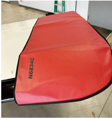
Cessna 421C Wingtip Pads