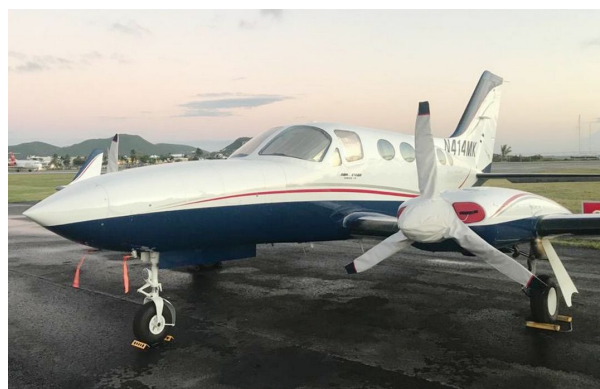
Cessna 414 Propellor/Spinner Covers, 3 Blade