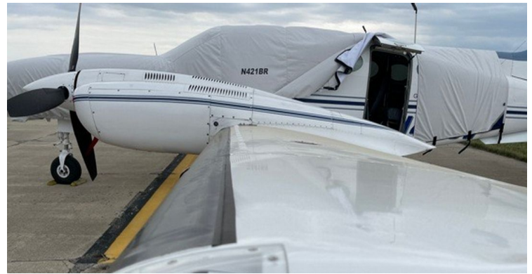
Cessna 421 Extended Canopy/Nose Cover with zipper access