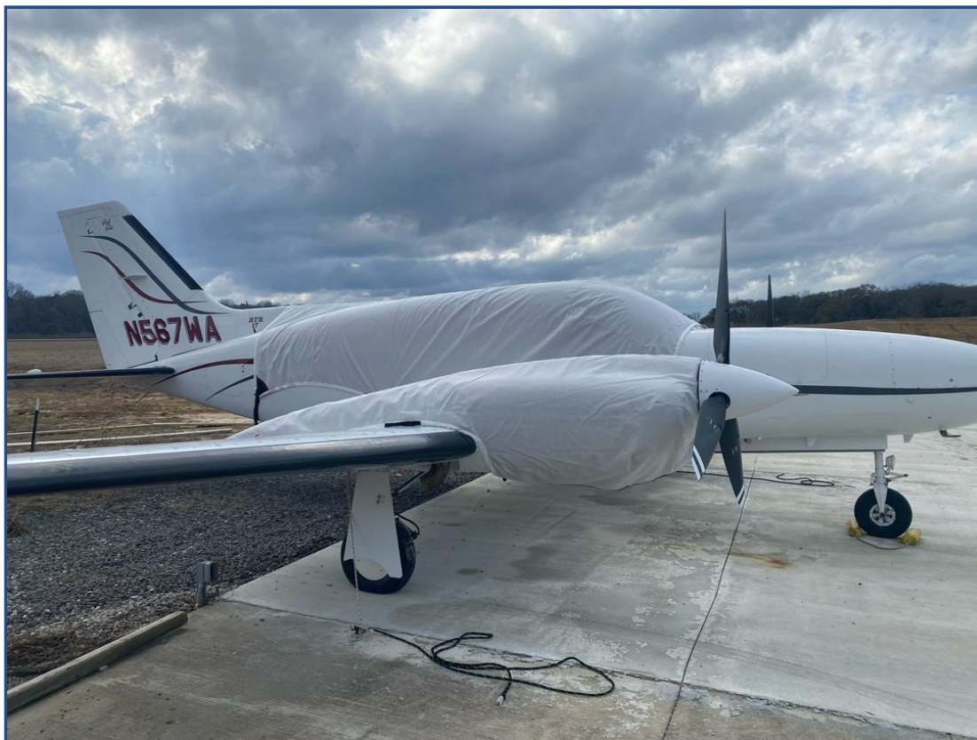
Cessna 421C Canopy &amp; Engine Covers