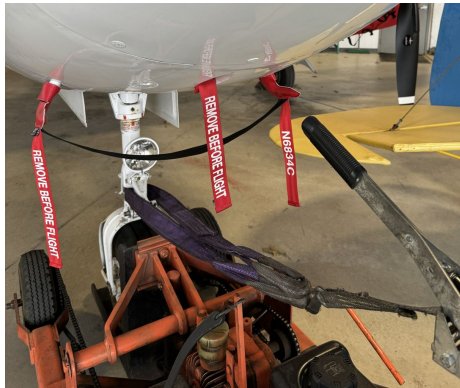
Cessna 421C Pitot Covers, Nose Inlet Plug

Engine Inlet Plugs are custom fit for your Cessna 421 intakes, made with heavy-duty vinyl material, and stuffed with a single block of sculpted urethane foam. Each plug has a zipper that allows the foam to be removed and dried if necessary. Engine plugs have warning flags that are visible from the cockpit or 'remove before flight' streamers sewn onto the face of the plugs. Most plugs are imprinted with the aircraft registration number in black for an extra charge. Storage bag NOT included. Engine plugs may be inserted after flight when the engine is still warm. Engine Inlet Plugs are commonly referred to as Cowl Plugs, Intake Plugs, Cowl Blocks, Engine Blocks, and Engine Bungs.