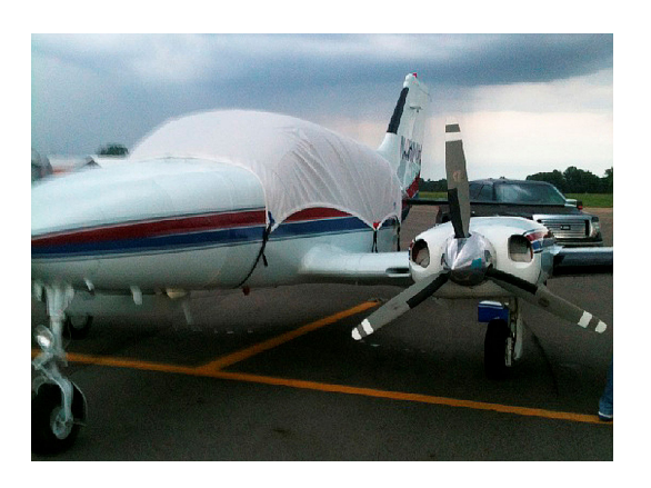
Cessna 401B Canopy Cover