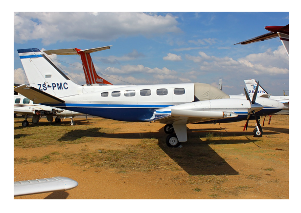
Cessna 441 Conquest II Cockpit Cover

Covers developed this material combination especially for aircraft protection. The outer material is medium weight and treated for water resistance, UV resistance and anti-static buildup. The inner lining is a very soft and smooth microfiber to prevent scratching. The material is very reflective, and tests show that the cabin interior temperature can be reduced to near-ambient temperature on the hottest of days. It is water, ice and snow repellent, yet breathable to allow moisture to escape from between the cover and the aircraft surface.