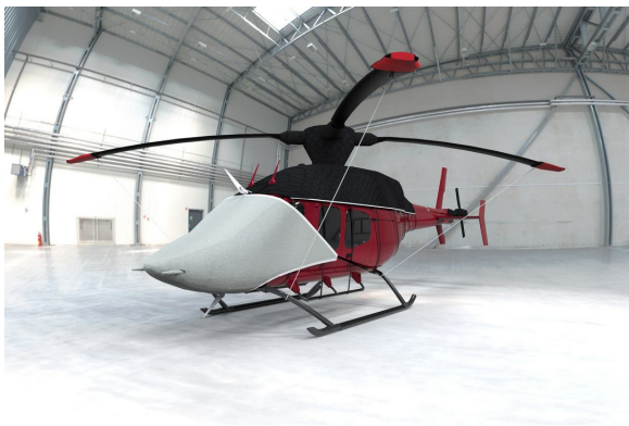
Bell 429 Cockpit/Nose Cover, Engine Cover, etc.