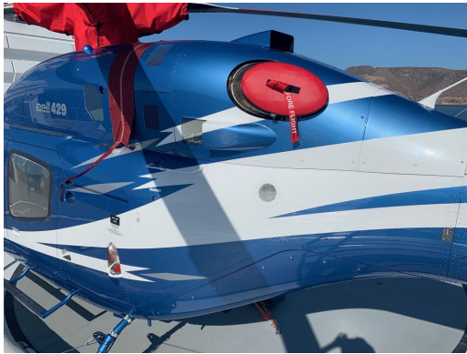
Bell 429 Exhaust Plug

The Engine Exhaust Plugs are custom fit for your Bell 429 exhaust openings, made with heavy-duty vinyl material, and stuffed with a single block of sculpted urethane foam. Exhaust plugs have 'Remove Before Flight' streamers sewn onto the face of the plugs. Exhaust plugs may be inserted soon after flight when the engine is still warm. Engine Inlet Plugs are commonly referred to as Cowl Plugs, Intake Plugs, Cowl Blocks, Engine Blocks, and Engine Bunges.