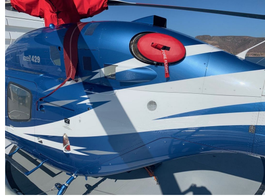
Bell 429 Exhaust Plug