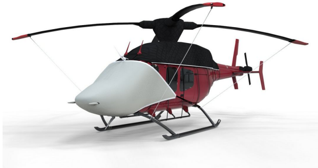
Bell 429 Cockpit/Nose Cover, Engine Cover, etc.

WINTER USE MATERIAL - Made with Solution-Dyed Polyester fabric, this option is intended for seasonal use to aid in deicing, rain mitigation, or for occasional travel. The material is lighter and more compact, but more susceptible to UV damage and may have a shorter useful life if used continuously outside than the all-year use material.