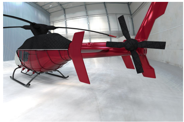
Bell 429 Tail Rotor, Engine, Rotor Hub Covers