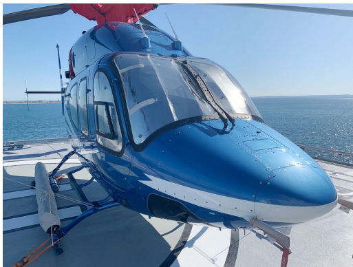
Bell 429 Cockpit HeatShields

Cockpit Heatshields are interior sunshades for the aircraft's cockpit. The product is a unique composite of closed-cell foam with a silver mylar finish. The semi-rigid design is stiff enough to stand inside the window framing. Darts and folds are incorporated into the material so that it conforms to the complex shape of the helicopter windows. The set folds up flat and is easily stored in the included storage sleeve. Some designs may require velcro and suction cups. A Heatshield is an excellent short-term remedy for cockpit overheating, but an external fabric cover is more effective for long-term protection.