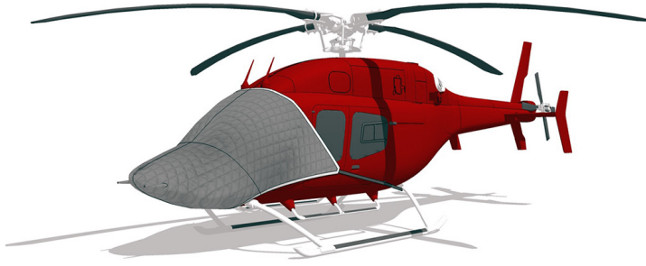
Bell 429 Insulated Cockpit/Nose Cover