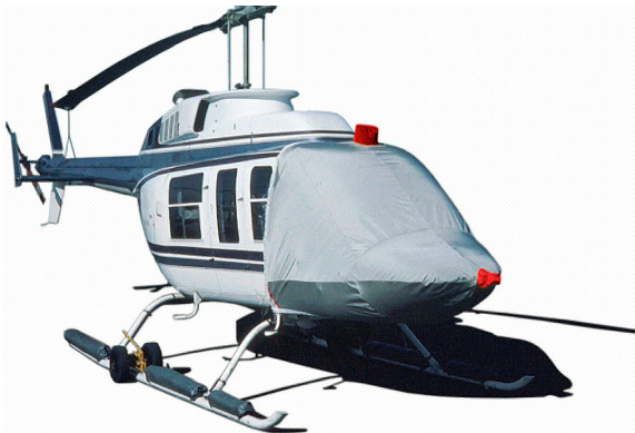
Cockpit Cover on Bell 206L

Travel Covers are made with Silver Solution-Dyed Polyester fabric and fully lined over the entire cover. The material is lightweight and more compact for easy storage in the aircraft. The polyester material is water resistant, but only intended for occasional use outside. We also have an ultra lightweight material available for fitted hangar dust covers. For daily outdoor use, the non-travel Sunbrella Cover is the best choice.