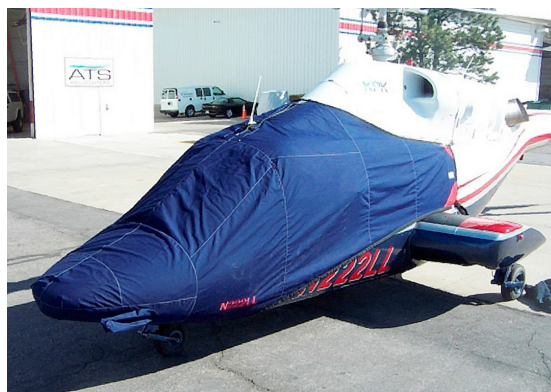
Bell 222 Bubble Cover