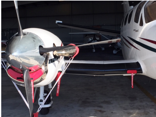
Cessna Conquest I Prop Tie/Exhaust Covers, Engine Plugs

Engine Inlet Plugs are custom fit for your Cessna 441, Conquest II intakes, made with heavy-duty vinyl material, and stuffed with a single block of sculpted urethane foam. Each plug has a zipper that allows the foam to be removed and dried if necessary. Engine plugs have warning flags that are visible from the cockpit or 'remove before flight' streamers sewn onto the face of the plugs. Most plugs are imprinted with the aircraft registration number in black for an extra charge. Storage bag NOT included. Engine plugs may be inserted after flight when the engine is still warm. Engine Inlet Plugs are commonly referred to as Cowl Plugs, Intake Plugs, Cowl Blocks, Engine Blocks, and Engine Bungs.