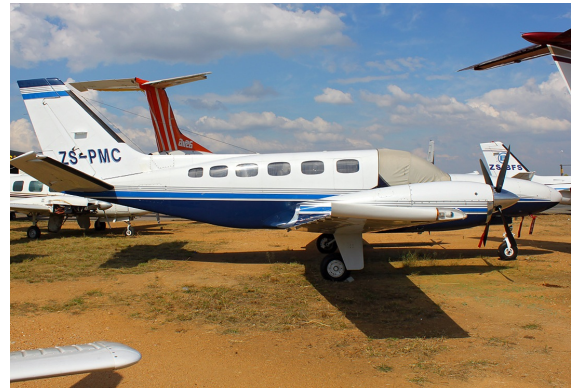
Cessna 441 Conquest II Cockpit Cover