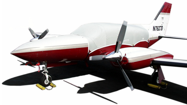
Cessna 421C Canopy Cover & Engine Plugs

Covers developed this material combination especially for aircraft protection. The outer material is medium weight and treated for water resistance, UV resistance and anti-static buildup. The inner lining is a very soft and smooth microfiber to prevent scratching. The material is very reflective, and tests show that the cabin interior temperature can be reduced to near-ambient temperature on the hottest of days. It is water, ice and snow repellent, yet breathable to allow moisture to escape from between the cover and the aircraft surface.