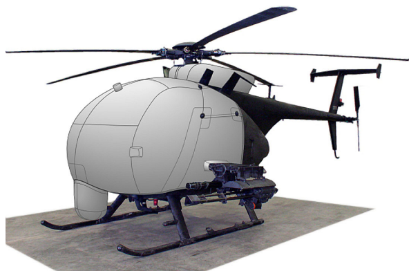
MH-6J Bubble, Flir & Doghouse Covers (illustration)

WINTER USE MATERIAL - Made with Solution-Dyed Polyester fabric, this option is intended for seasonal use to aid in deicing, rain mitigation, or for occasional travel. The material is lighter and more compact, but more susceptible to UV damage and may have a shorter useful life if used continuously outside than the all-year use material.