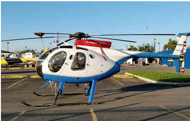
Hughes 500D Blade Tie-Downs, Doghouse Cover