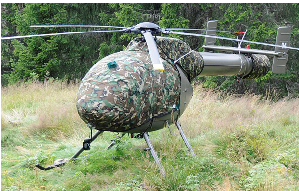
MD520 NOTAR Bubble, Engine, & NOTAR Covers & Blade Tie-downs

Travel Covers are made with Silver Solution-Dyed Polyester fabric and fully lined over the entire cover. The material is lightweight and more compact for easy stowage in the aircraft. The polyester material is water resistant, but only intended for occasional use outside. We also have an ultra lightweight material available for fitted hangar dust covers. For daily outdoor use, the non-travel Sunbrella Cover is the best choice.