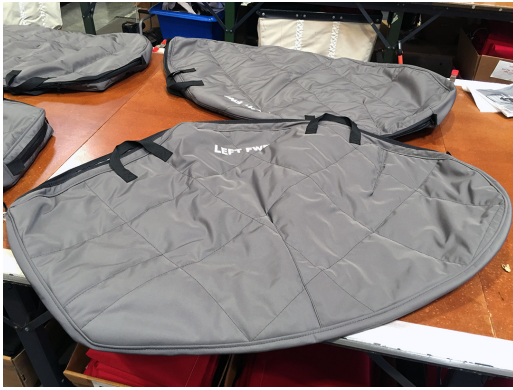
Protective Door Bags

**Padded Door Bags* are designed to provide portable protection of the doors when they are removed from the aircraft. They are padded to moderate thickness, zippered closed, and have sturdy carry handles for easy transport.