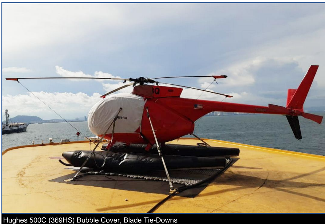
Hughes 500C (369HS) Bubble Cover, Blade Tie-Downs