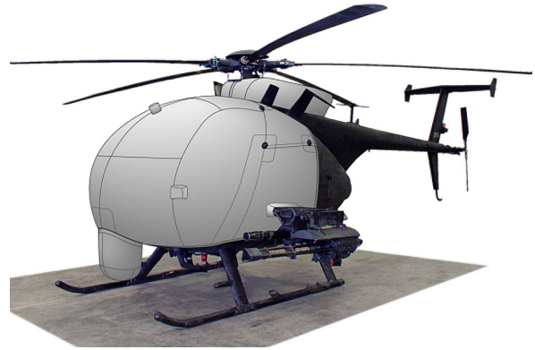
MH-6J Bubble, Flir & Doghouse Covers (illustration)