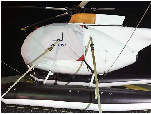
Customized with tie-down access flaps