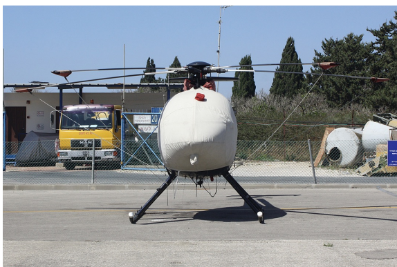
MD-500E Bubble Cover, Blade Tie-Diwns

WINTER USE MATERIAL - Made with Solution-Dyed Polyester fabric, this option is intended for seasonal use to aid in deicing, rain mitigation, or for occasional travel. The material is lighter and more compact, but more susceptible to UV damage and may have a shorter useful life if used continuously outside than the all-year use material.