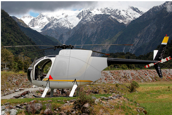
Engine Cover (illustration)

WINTER USE MATERIAL - Made with Solution-Dyed Polyester fabric, this option is intended for seasonal use to aid in deicing, rain mitigation, or for occasional travel. The material is lighter and more compact, but more susceptible to UV damage and may have a shorter useful life if used continuously outside than the all-year use material.