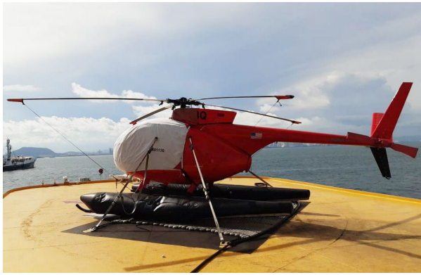
Hughes 500C (369HS) Bubble Cover, Blade Tie-Downs