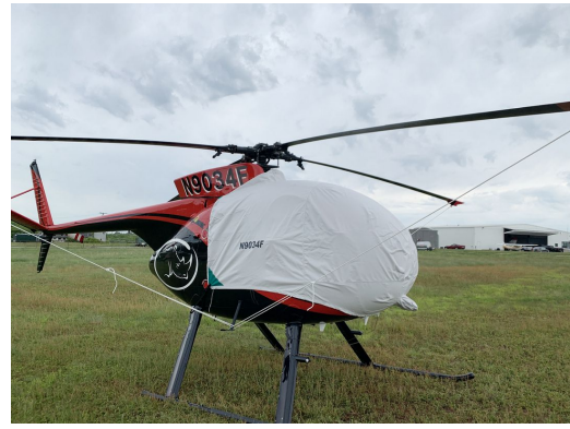
Hughes 500C Bubble Cover with Intake Add-On