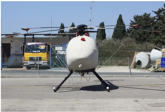
MD-500E Bubble Cover, Blade Tie-Downs