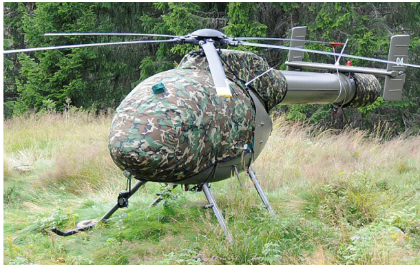
MD520 NOTAR Bubble, Engine, & NOTAR Covers & Blade Tie-downs

Travel Covers are made with Silver Solution-Dyed Polyester fabric and fully lined over the entire cover. The material is lightweight and more compact for easy stowage in the aircraft. The polyester material is water resistant, but only intended for occasional use outside. We also have an ultra lightweight material available for fitted hangar dust covers. For daily outdoor use, the non-travel Sunbrella Cover is the best choice.