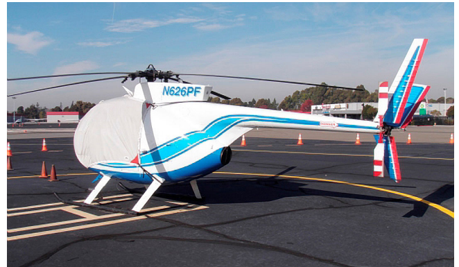
MD500C Bubble Cover with Wire Strike detail