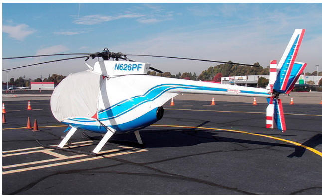
MD500C Bubble Cover with Wire Strike detail