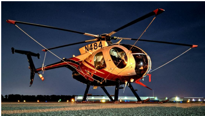
Hughes 500D Blade Tie-Downs

WINTER USE MATERIAL - Made with Solution-Dyed Polyester fabric, this option is intended for seasonal use to aid in deicing, rain mitigation, or for occasional travel. The material is lighter and more compact, but more susceptible to UV damage and may have a shorter useful life if used continuously outside than the all-year use material.