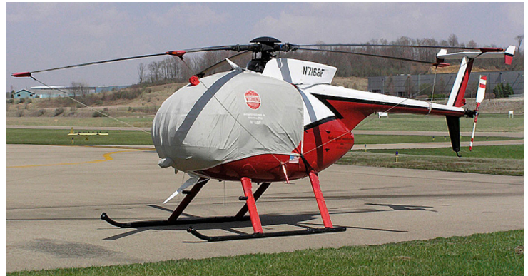
Hughes 500D Bubble Cover with Wire Strike detail and Blade Tie-downs