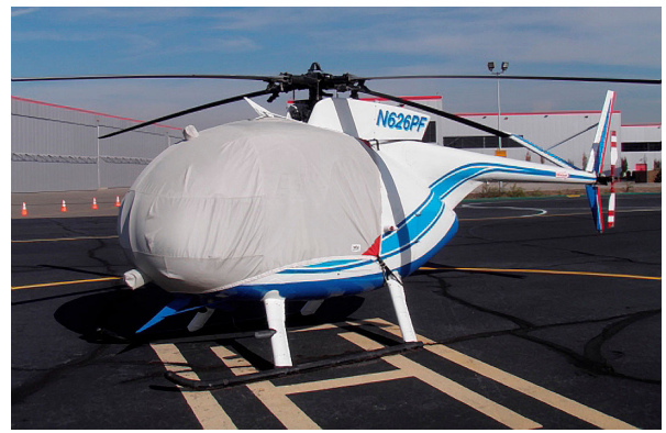
MD500C Bubble Cover with Wire Strike detail