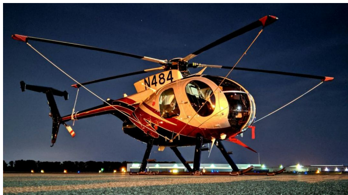
Hughes 500D Blade Tie-Downs

WINTER USE MATERIAL - Made with Solution-Dyed Polyester fabric, this option is intended for seasonal use to aid in deicing, rain mitigation, or for occasional travel. The material is lighter and more compact, but more susceptible to UV damage and may have a shorter useful life if used continuously outside than the all-year use material.