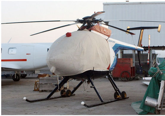
MD-500E Bubble Cover