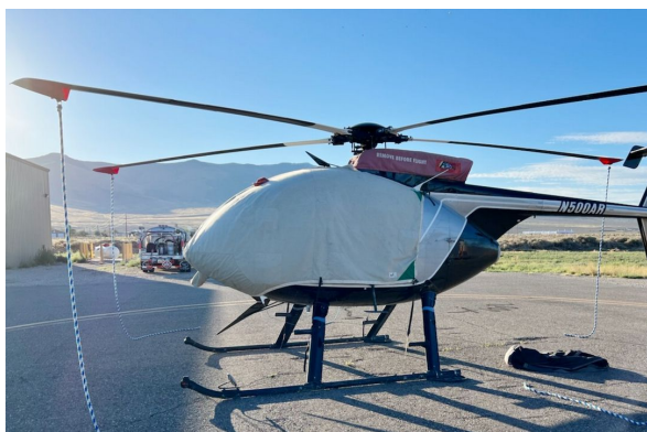
MD 500E Bubble Cover