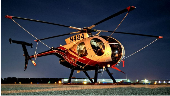
Hughes 500D Blade Tie-Downs

WINTER USE MATERIAL - Made with Solution-Dyed Polyester fabric, this option is intended for seasonal use to aid in deicing, rain mitigation, or for occasional travel. The material is lighter and more compact, but more susceptible to UV damage and may have a shorter useful life if used continuously outside than the all-year use material.