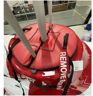
Bell 505 Swash Plate Plug