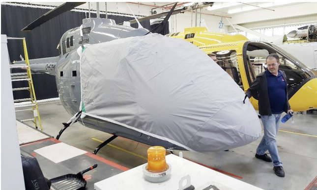
Bell 505 Bubble Cover

Travel Covers are made with Silver Solution-Dyed Polyester fabric and fully lined over the entire cover. The material is lightweight and more compact for easy storage in the aircraft. The polyester material is water resistant, but only intended for occasional use outside. We also have an ultra lightweight material available for fitted hangar dust covers. For daily outdoor use, the non-travel Sunbrella Cover is the best choice.