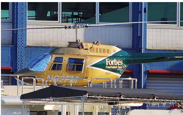
Bell 206B Jetranger Windshield HeatShields

Heatshields are interior sunshades for an aircraft's windows or canopy glass. The product is a unique composite of closed-cell foam with a silver mylar finish. The semi-rigid design is stiff enough to stand along the inside of the windshield using sun visors or window framing. It folds up flat and easily stores in the included storage sleeve. Some designs may require velcro and suction cups. A Heatshield is an excellent short-term remedy for cockpit overheating.