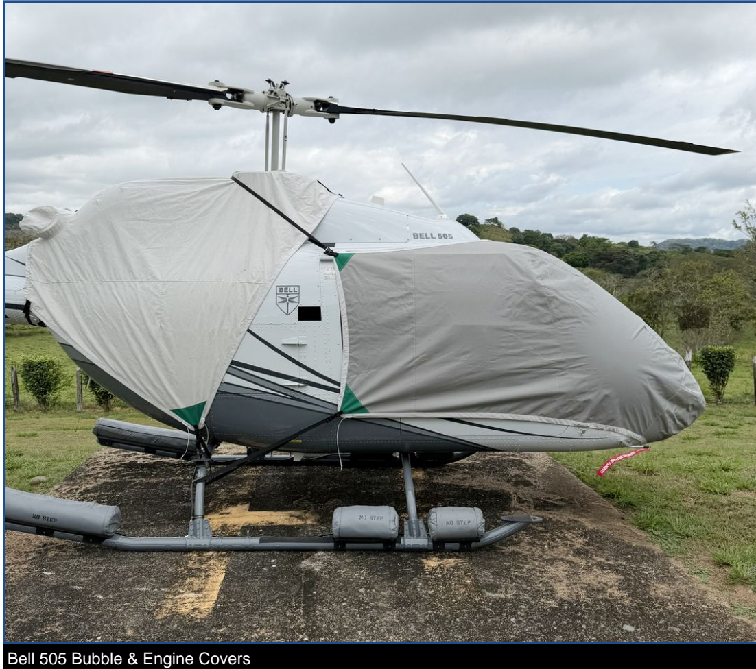
Bell 505 Bubble &amp; Engine Covers