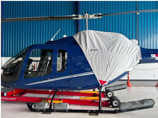
Bell 505 Engine Cover

WINTER USE MATERIAL - Made with Solution-Dyed Polyester fabric, this option is intended for seasonal use to aid in deicing, rain mitigation, or for occasional travel. The material is lighter and more compact, but more susceptible to UV damage and may have a shorter useful life if used continuously outside than the all-year use material.