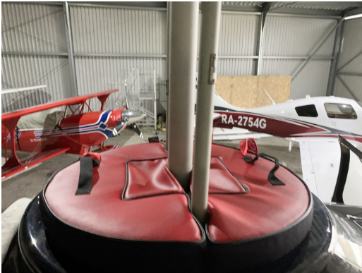
Bell 505 Jet Ranger X Swash Plate Plug

The Engine Inlet Plugs are custom fit for your Bell 505 Jet Ranger X intakes, made with heavy-duty vinyl material, and stuffed with a single block of sculpted urethane foam. Each plug has a zipper that allows the foam to be removed and dried if necessary. Engine plugs have 'Remove Before Flight' streamers sewn onto the face of the plugs. Most plugs are imprinted with the aircraft registration number in black for an extra charge. Storage bag NOT included. Engine plugs may be inserted after flight when the engine is still warm. Engine Inlet Plugs are commonly referred to as Cowl Plugs, Intake Plugs, Cowl Blocks, Engine Blocks, and Engine Bungs.