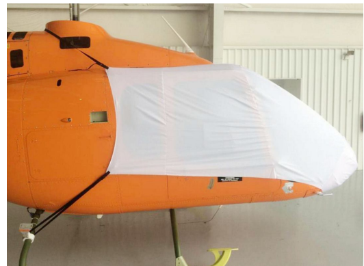
Bell 505 Bubble Cover, test fit cover.