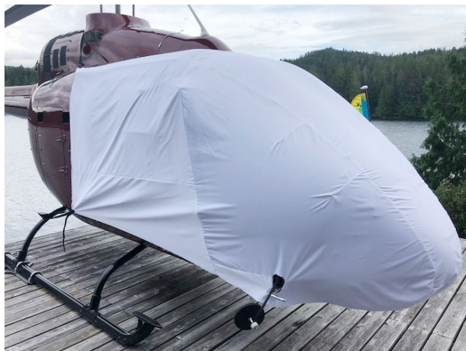
Bell 505 Bubble Cover, test fit cover

Travel Covers are made with Silver Solution-Dyed Polyester fabric and fully lined over the entire cover. The material is lightweight and more compact for easy storage in the aircraft. The polyester material is water resistant, but only intended for occasional use outside. We also have an ultra lightweight material available for fitted hangar dust covers. For daily outdoor use, the non-travel Sunbrella Cover is the best choice.