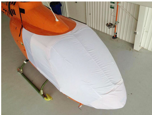
Bell 505 Bubble Cover, test fit cover.

Travel Covers are made with Silver Solution-Dyed Polyester fabric and fully lined over the entire cover. The material is lightweight and more compact for easy storage in the aircraft. The polyester material is water resistant, but only intended for occasional use outside. We also have an ultra lightweight material available for fitted hangar dust covers. For daily outdoor use, the non-travel Sunbrella Cover is the best choice.