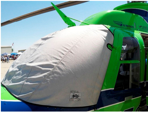
Bell 407 Windshield Cover