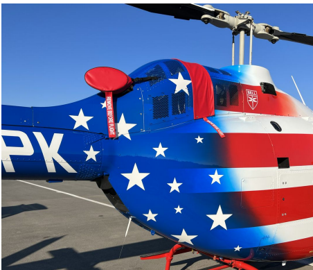
Bell 505 Exhaust & Intake Filter Covers

WINTER USE MATERIAL - Made with Solution-Dyed Polyester fabric, this option is intended for seasonal use to aid in deicing, rain mitigation, or for occasional travel. The material is lighter and more compact, but more susceptible to UV damage and may have a shorter useful life if used continuously outside than the all-year use material.