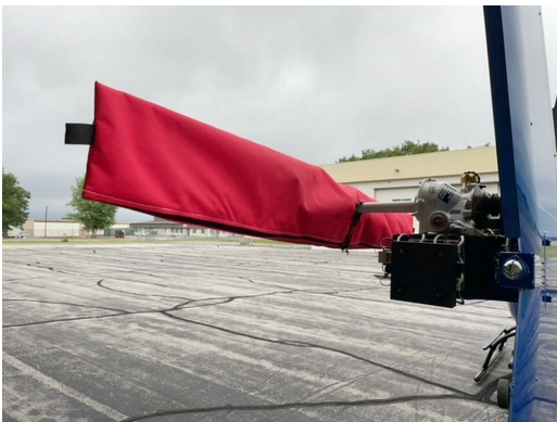
Bell 505 Jet Ranger X Tail Rotor Cover

WINTER USE MATERIAL - Made with Solution-Dyed Polyester fabric, this option is intended for seasonal use to aid in deicing, rain mitigation, or for occasional travel. The material is lighter and more compact, but more susceptible to UV damage and may have a shorter useful life if used continuously outside than the all-year use material.