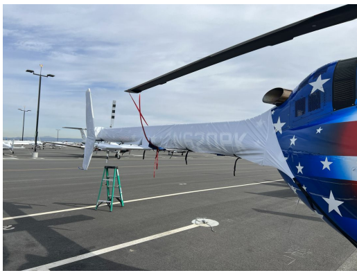
Bell 505 Tailboom & Stabilizer Covers, test fit cover