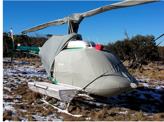
JetRanger Bubble, Engine, Rotor Hub & Blade Covers (& Tie-Downs)