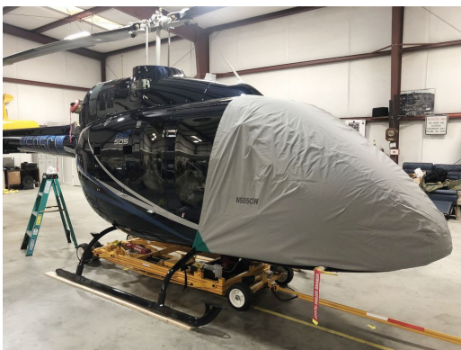
Bell 505 Light Weight Travel Bubble Cover

Travel Covers are made with Silver Solution-Dyed Polyester fabric and fully lined over the entire cover. The material is lightweight and more compact for easy storage in the aircraft. The polyester material is water resistant, but only intended for occasional use outside. We also have an ultra lightweight material available for fitted hangar dust covers. For daily outdoor use, the non-travel Sunbrella Cover is the best choice.