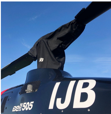
Bell 505 Rotor Mast & Blade Covers

WINTER USE MATERIAL - Made with Solution-Dyed Polyester fabric, this option is intended for seasonal use to aid in deicing, rain mitigation, or for occasional travel. The material is lighter and more compact, but more susceptible to UV damage and may have a shorter useful life if used continuously outside than the all-year use material.