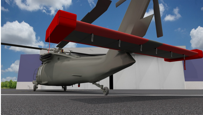
Padded Horizontal Stab Covers, Wingtip Pads (illustration)

Designed to prevent damage to the aircraft extremities in crowded hangars, these products are made of bright red Naugahyde and thickly padded with a sandwich of closed cell foam.