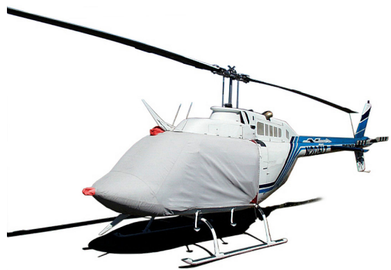
JetRanger Bubble Cover