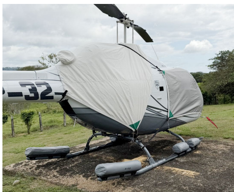
Bell 505 Bubble & Engine Covers

WINTER USE MATERIAL - Made with Solution-Dyed Polyester fabric, this option is intended for seasonal use to aid in deicing, rain mitigation, or for occasional travel. The material is lighter and more compact, but more susceptible to UV damage and may have a shorter useful life if used continuously outside than the all-year use material.