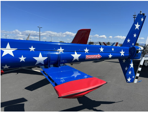
Bell 505 Horizontal Stabilizer Tip Pads