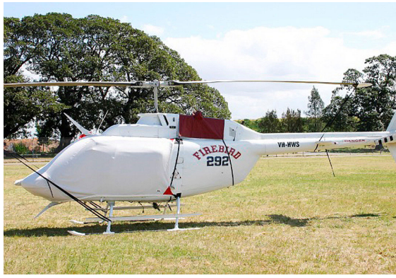
206B Bubble Cover