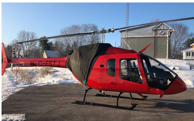
Bell 505 Engine Cover