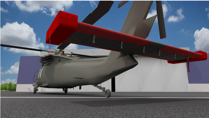
Padded Horizontal Stab Covers, Wingtip Pads (illustration)