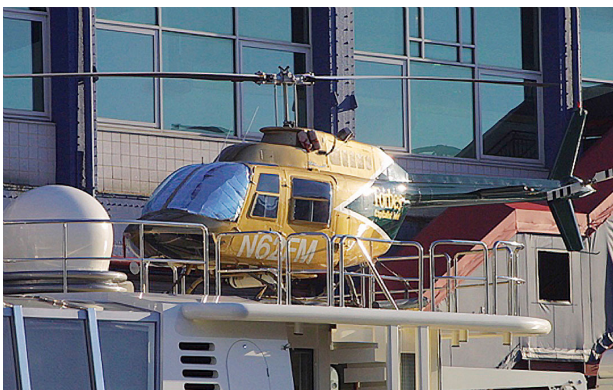
Bell 206B Jetranger Windshield HeatShields

Heatshields are interior sunshades for an aircraft's windows or canopy glass. The product is a unique composite of closed-cell foam with a silver mylar finish. The semi-rigid design is stiff enough to stand along the inside of the windshield using sun visors or window framing. It folds up flat and easily stores in the included storage sleeve. Some designs may require velcro and suction cups. A Heatshield is an excellent short-term remedy for cockpit overheating.