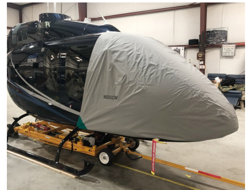
Bell 505 Bubble Cover, travel weight type