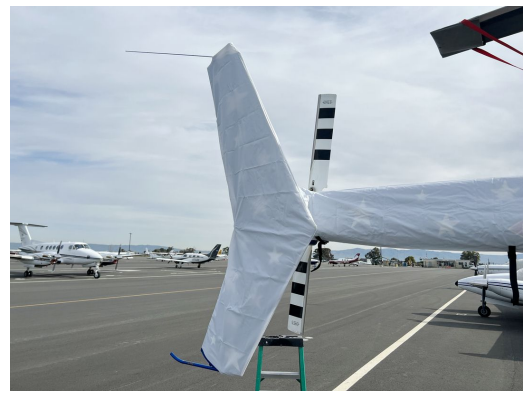
Bell 505 Tailboom & Stabilizer Covers, test fit cover