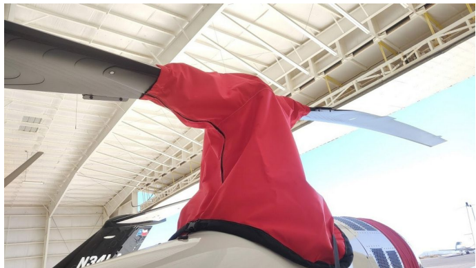
505 Jet Ranger X Rotor Hub/Drive Shaft Cover with outer skirt