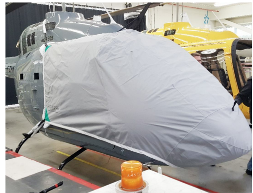
Bell 505 Bubble Cover, travel weight type