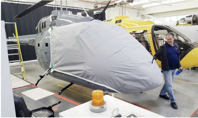
Bell 505 Bubble Cover