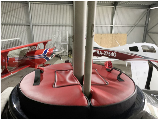
Bell 505 Jet Ranger X Swash Plate Plug

The Engine Inlet Plugs are custom fit for your Bell 505 Jet Ranger X intakes, made with heavy-duty vinyl material, and stuffed with a single block of sculpted urethane foam. Each plug has a zipper that allows the foam to be removed and dried if necessary. Engine plugs have 'Remove Before Flight' streamers sewn onto the face of the plugs. Most plugs are imprinted with the aircraft registration number in black for an extra charge. Storage bag NOT included. Engine plugs may be inserted after flight when the engine is still warm. Engine Inlet Plugs are commonly referred to as Cowl Plugs, Intake Plugs, Cowl Blocks, Engine Blocks, and Engine Bungs.