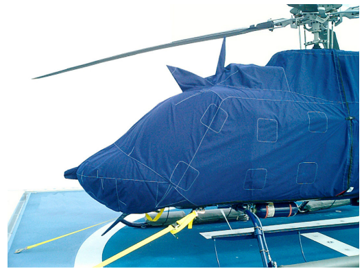
206B/206L/407 Full Body Cover