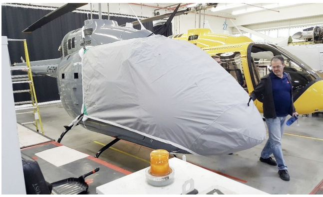
Bell 505 Bubble Cover