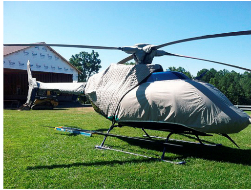
Bell 407 Covers: Bubble, Insulated Engine, Rotor Mast, Blades, Tailboom, Vertical Stabilizer and Tail Rotor