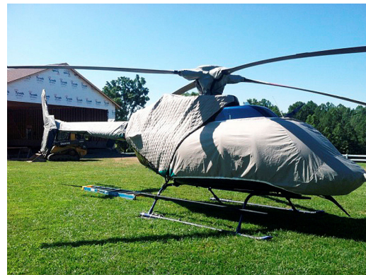
Bell 407 Covers: Bubble, Insulated Engine, Rotor Mast, Blades, Tailboom, Vertical Stabilizer and Tail Rotor