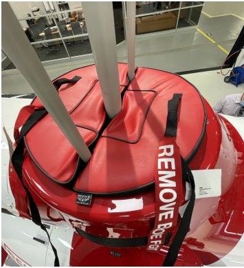
Bell 505 Swash Plate Plug

The Engine Inlet Plugs are custom fit for your Bell 505 Jet Ranger X intakes, made with heavy-duty vinyl material, and stuffed with a single block of sculpted urethane foam. Each plug has a zipper that allows the foam to be removed and dried if necessary. Engine plugs have 'Remove Before Flight' streamers sewn onto the face of the plugs. Most plugs are imprinted with the aircraft registration number in black for an extra charge. Storage bag NOT included. Engine plugs may be inserted after flight when the engine is still warm. Engine Inlet Plugs are commonly referred to as Cowl Plugs, Intake Plugs, Cowl Blocks, Engine Blocks, and Engine Bungs.