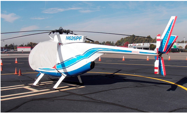
MD500C Bubble Cover with Wire Strike detail