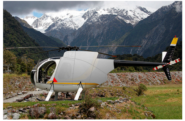
MDD 520 NOTAR Bubble Cover w/Intake Cover Add-On, Exhaust Cover