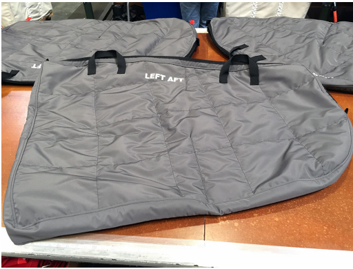
Protective Door Bags

**Padded Door Bags* are designed to provide portable protection of the doors when they are removed from the aircraft. They are padded to moderate thickness, zippered closed, and have sturdy carry handles for easy transport.