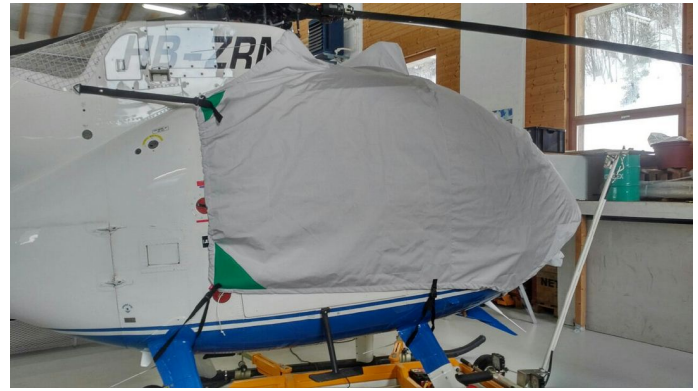
MD520 Bubble Cover with Intake Cover Add-On