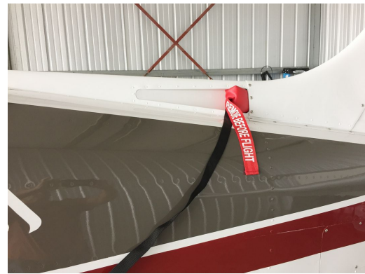
Beech Bonanza/Baron Fresh Air Intake & Exhaust Plugs