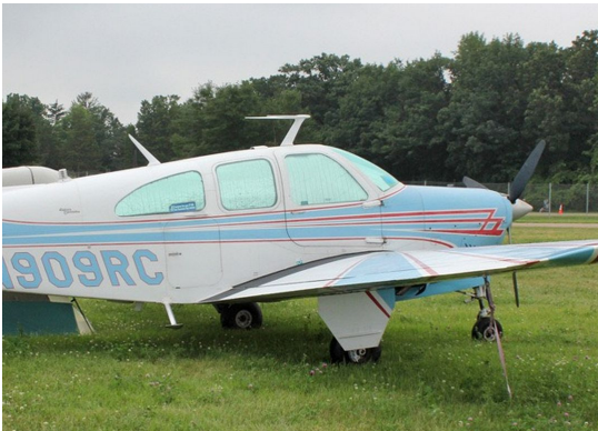
Beech Bonanza/Debonair HeatShield Set

Heatshields are interior sunshades for an aircraft's windows or canopy glass. The product is a unique composite of closed-cell foam with a silver mylar finish. The semi-rigid design is stiff enough to stand along the inside of the windshield using sun visors or window framing. It folds up flat and easily stores in the included storage sleeve. Some designs may require velcro and suction cups. A Heatshield is an excellent short-term remedy for cockpit overheating.