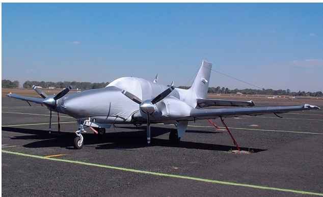
Baron FULL COVER SET, Light Weight Travel &/or Fitted Dust Cover Set

This cover type is made from Silver Acrylic Sunbrella canvas and is 100% lined with a soft and smooth microfiber. Bruce's Custom Covers developed this material combination especially for aircraft protection. The outer material is medium weight and treated for water resistance, UV resistance and anti-static buildup. The inner lining is a very soft and smooth microfiber to prevent scratching. The material is very reflective, and tests show that the cabin interior temperature can be reduced to near-ambient temperature on the hottest of days. It is water, ice and snow repellent, yet breathable to allow moisture to escape from between the cover and the aircraft surface.