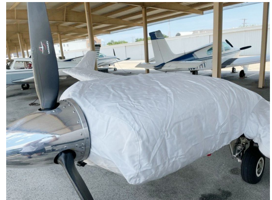
Beech Baron 58P Extended Canopy/Nose Cover, Wing/Engine Covers (test fit) Beech Baron 58P Wing/Engine Covers (test fit)