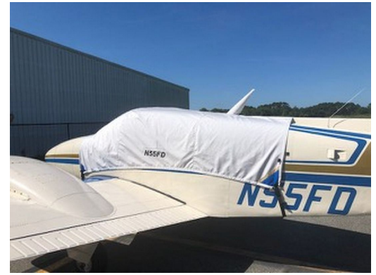
Beech Baron 95-B55 Canopy cover