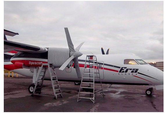
Dash 8 Insulated Engine & Prop Covers