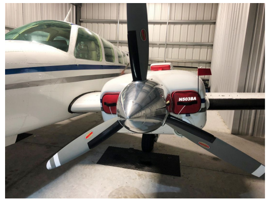
Beech Baron Engine Plugs