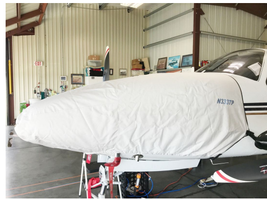
Beech Baron G58 Nose Cover