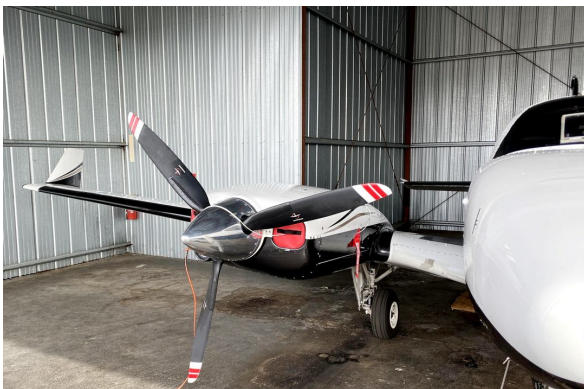
Baron 58 Engine Plugs

Engine Inlet Plugs are custom fit for your Beech Baron 58TC intakes, made with heavy-duty vinyl material, and stuffed with a single block of sculpted urethane foam. Each plug has a zipper that allows the foam to be removed and dried if necessary. Engine plugs have warning flags that are visible from the cockpit or 'remove before flight' streamers sewn onto the face of the plugs. Most plugs are imprinted with the aircraft registration number in black for an extra charge. Storage bag NOT included. Engine plugs may be inserted after flight when the engine is still warm. Engine Inlet Plugs are commonly referred to as Cowl Plugs, Intake Plugs, Cowl Blocks, Engine Blocks, and Engine Bungs.