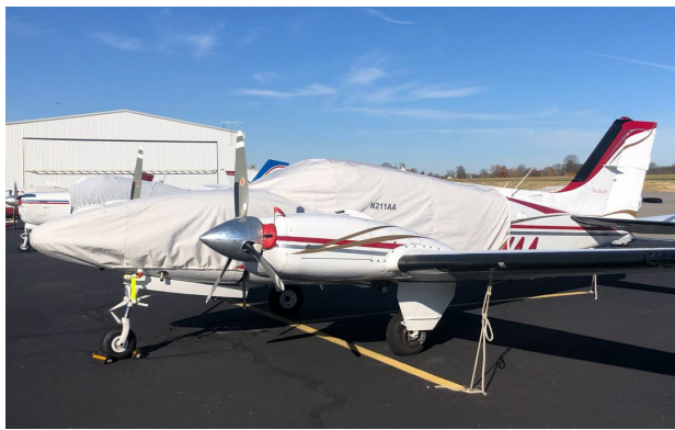
Baron Beech E-55 Extended Canopy/Nose Cover