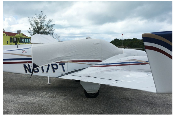
Beech Baron 58 Canopy Cover