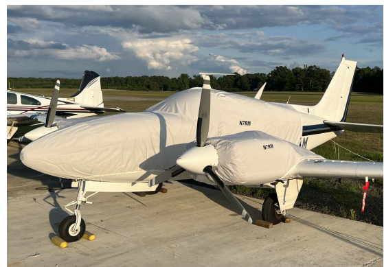
Beech C55 Baron Extended Canopy/Nose Cover, Engine Covers