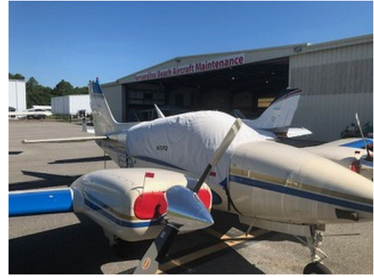
Beech Baron 95-B55 Canopy cover