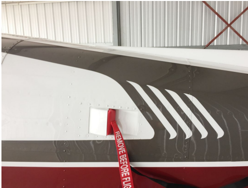
Beech Bonanza/Baron Fresh Air Intake & Exhaust Plugs

Engine Inlet Plugs are custom fit for your Beech Baron 58TC intakes, made with heavy-duty vinyl material, and stuffed with a single block of sculpted urethane foam. Each plug has a zipper that allows the foam to be removed and dried if necessary. Engine plugs have warning flags that are visible from the cockpit or 'remove before flight' streamers sewn onto the face of the plugs. Most plugs are imprinted with the aircraft registration number in black for an extra charge. Storage bag NOT included. Engine plugs may be inserted after flight when the engine is still warm. Engine Inlet Plugs are commonly referred to as Cowl Plugs, Intake Plugs, Cowl Blocks, Engine Blocks, and Engine Bungs.