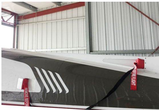
Beech Bonanza/Baron Fresh Air Intake & Exhaust Plugs

Engine Inlet Plugs are custom fit for your Beech Baron 58TC intakes, made with heavy-duty vinyl material, and stuffed with a single block of sculpted urethane foam. Each plug has a zipper that allows the foam to be removed and dried if necessary. Engine plugs have warning flags that are visible from the cockpit or 'remove before flight' streamers sewn onto the face of the plugs. Most plugs are imprinted with the aircraft registration number in black for an extra charge. Storage bag NOT included. Engine plugs may be inserted after flight when the engine is still warm. Engine Inlet Plugs are commonly referred to as Cowl Plugs, Intake Plugs, Cowl Blocks, Engine Blocks, and Engine Bungs.