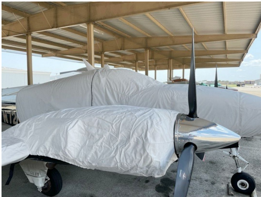
Beech Baron 58P Extended Canopy/Nose Cover, Wing/Engine Covers (test fit)

WINTER USE MATERIAL - Made with Solution-Dyed Polyester fabric, this option is intended for seasonal use to aid in deicing, rain mitigation, or for occasional travel. The material is lighter and more compact, but more susceptible to UV damage and may have a shorter useful life if used continuously outside than the all-year use material.