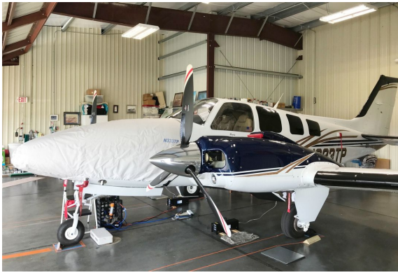
Beech Baron G58 Nose Cover