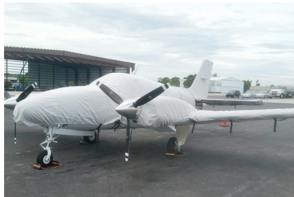
Beech Baron 58P Extended Canopy/Nose Cover, Wing/Engine Covers (test fit) Full Cover Set (58P-020, 58P-225, 58P-405)