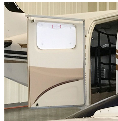
Beech Baron 58 Cabin HeatShield