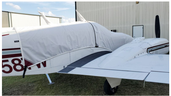
Beech Baron 58 Canopy/Nose Cover