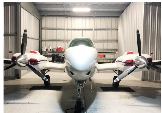
Beech Baron Engine Plugs