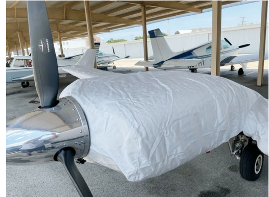
Beech Baron 58P Wing/Engine Covers (test fit)