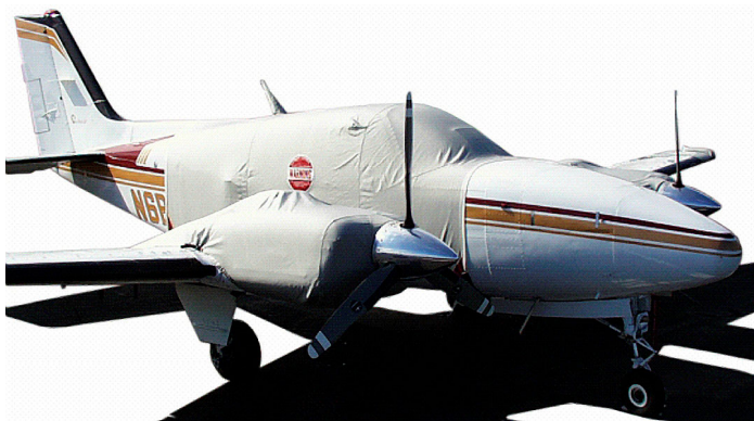
Standard Canopy Cover & Engine Plugs. Extended Canopy Cover & Engine Cover

This cover type is made from Silver Acrylic Sunbrella canvas and is 100% lined with a soft and smooth microfiber. Bruce's Custom Covers developed this material combination especially for aircraft protection. The outer material is medium weight and treated for water resistance, UV resistance and anti-static buildup. The inner lining is a very soft and smooth microfiber to prevent scratching. The material is very reflective, and tests show that the cabin interior temperature can be reduced to near-ambient temperature on the hottest of days. It is water, ice and snow repellent, yet breathable to allow moisture to escape from between the cover and the aircraft surface.