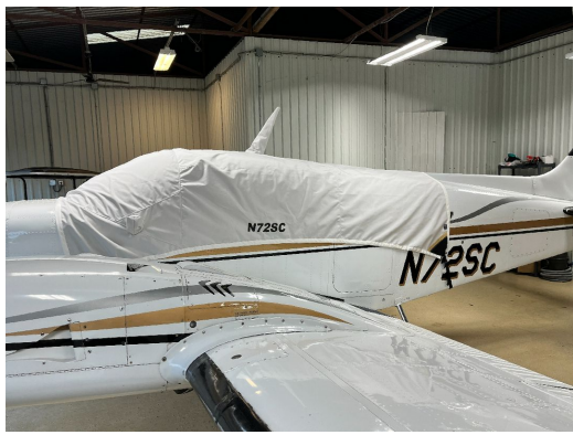
Baron 58P Canopy Cover