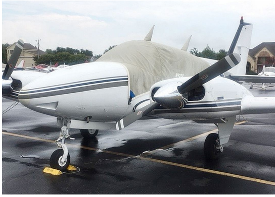
Beech Baron Canopy Cover