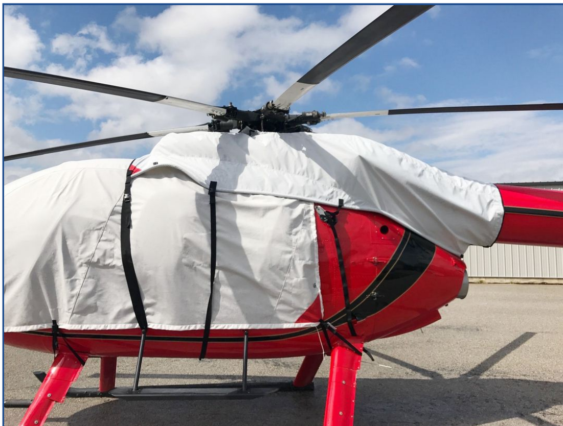
MD Helicopters 600 Bubble &amp; Doghouse Covers