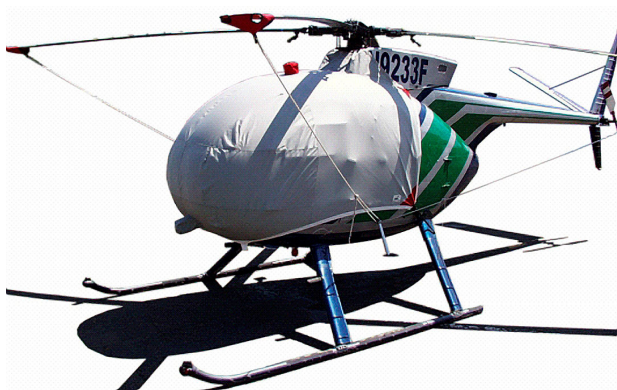
Hughes 500C Bubble Cover with Intake Add-on, Blade Tie-downs