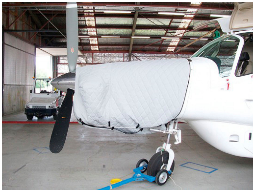
750XL Insulated Engine Cover