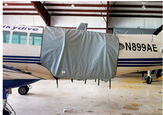
750XL Jump Door Cover