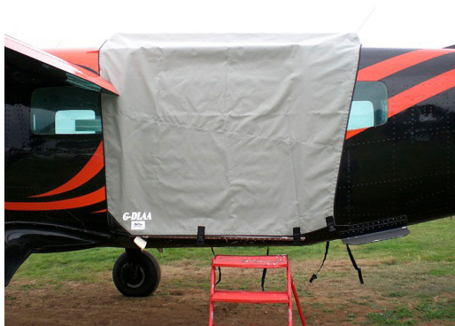
Cessna 208 Caravan Jump Door Cover