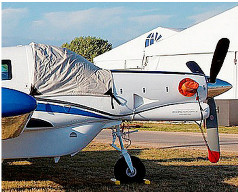
750XL Cockpit Cover & Prop Tie/Exhaust Covers