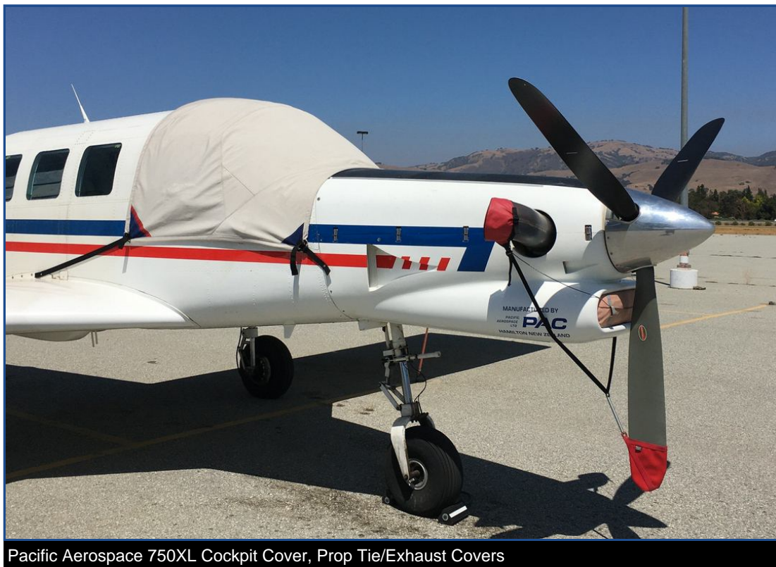
Pacific Aerospace 750XL Cockpit Cover, Prop Tie/Exhaust Covers