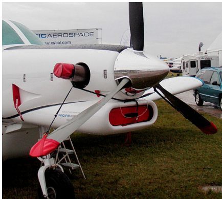
750XL Engine Inlet Plugs & Prop Tie/Exhaust Covers

This cover type is made from Silver Acrylic Sunbrella canvas and is 100% lined with a soft and smooth microfiber. Bruce's Custom Covers developed this material combination especially for aircraft protection. The outer material is medium weight and treated for water resistance, UV resistance and anti-static buildup. The inner lining is a very soft and smooth microfiber to prevent scratching. The material is very reflective, and tests show that the cabin interior temperature can be reduced to near-ambient temperature on the hottest of days. It is water, ice and snow repellent, yet breathable to allow moisture to escape from between the cover and the aircraft surface.